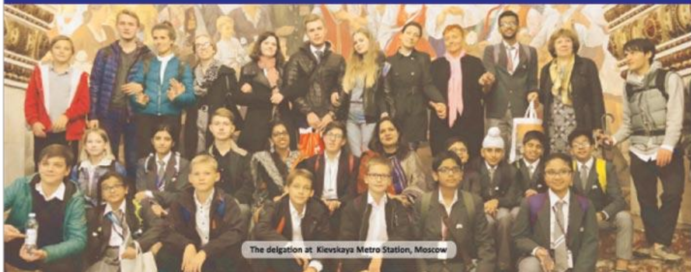
The delegation at Kievskaya Metro Station, Moscow