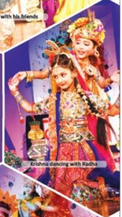
Krishna dancing with Radha