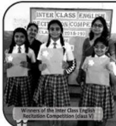
Winners of the Inter Class English Recitation Competition (class V)