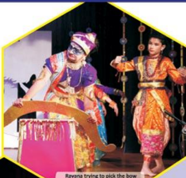
Ravana trying to pick the bow during Sita's Swayamvar