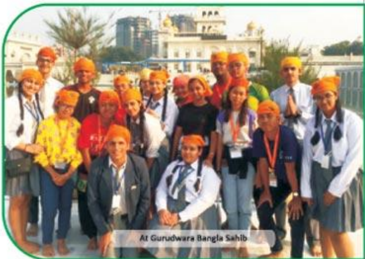
At Gurudwara Bangla Sahib