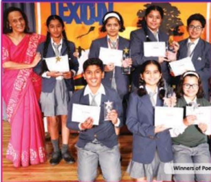
Winners of Poetic Magic, Classes VI & VII