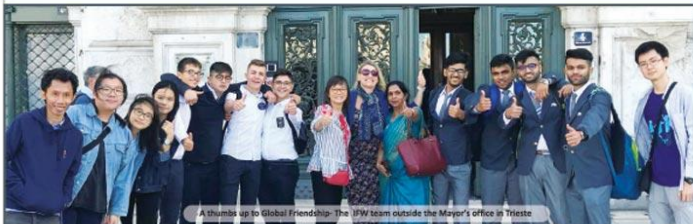
A thumbs up to Global Friendship- The IFW team outside the Mayor's office in Trieste