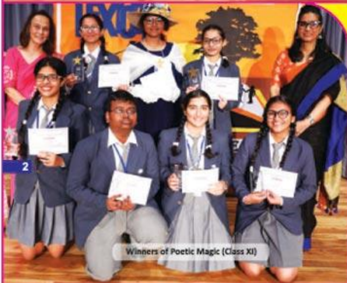
Winners of Poetic Magic (Class XI)