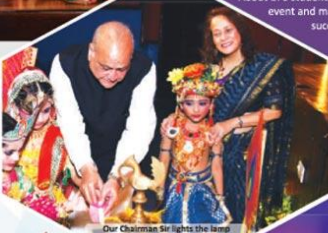
Our Chairman Sir lights the lamp