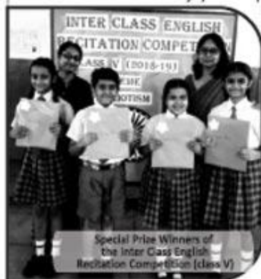
Special Prize Winners of the Inter Class English Recitation Competition (class V)

The final round of Inter House GK Quiz of Class II took place on 19 November 2018. The quiz consisted of 8 rounds with topics like festivals and traditional dresses of India, facts about our country and places on earth, our sports persons and different musical instruments. It also had questions about the different flowers and animals that help us. Each round had an audience round in which the audience participated actively and was also given prizes for correct answers. The students answered the questions with great enthusiasm and enjoyed the quiz.