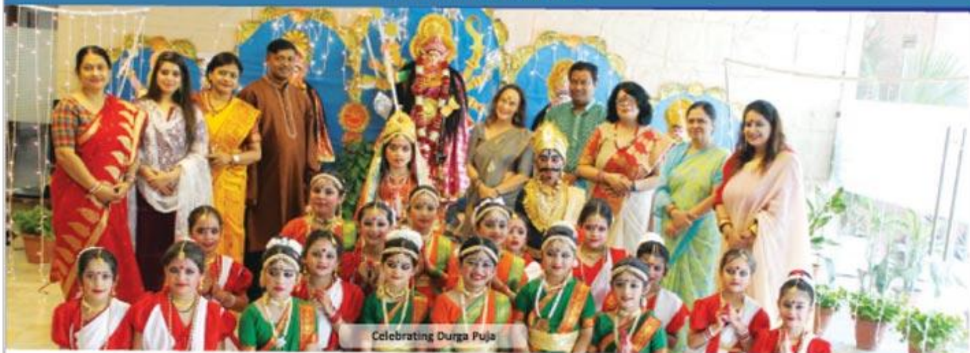
Celebrating Durga Puja