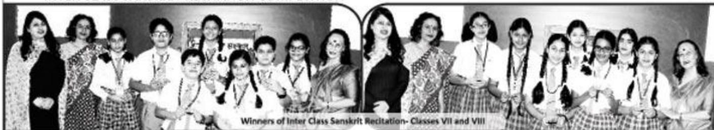
Winners of Inter Class Sanskrit Recitation- Classes VII and VIII

An Inter Class Sanskrit Recitation for Classes VI, VII and VIII was conducted on 12 October, 2018. The children recited beautiful poems of eminent scholars. The students who won prizes were :-