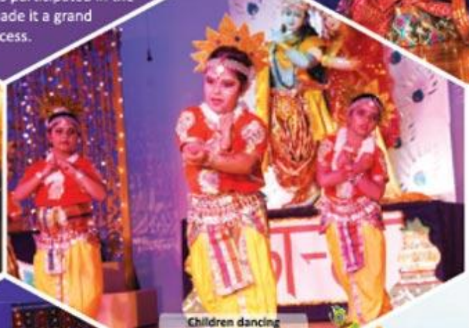
Children dancing to the tune of 'Kanha re'