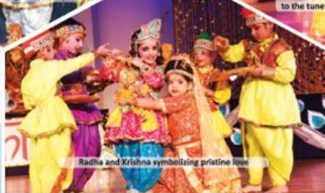
Radha and Krishna symbolizing pristine love