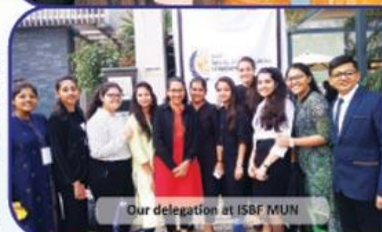
Our delegation at ISBF MUN