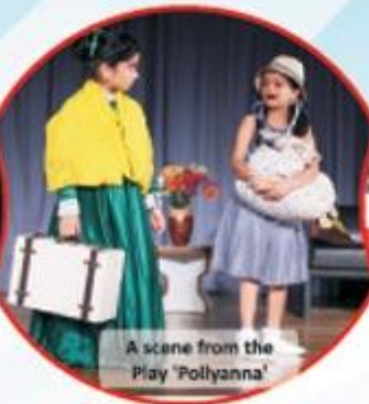
A scene from the Play 'Pollyanna'