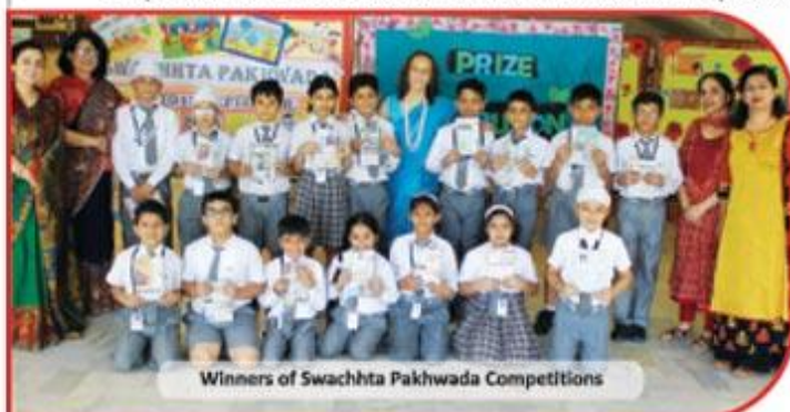
Winners of Swachhta Pakhwada Competitions

Under 'Swachhta Pakhwada' Campaign students of Class IV made beautiful charts, posters and flash cards on water borne diseases and talked about 'How to save water'. This activity helped the children to gain knowledge about the water borne diseases and how to prevent them, while giving them an insight on saving water. The winners of essays, poems, letter writing, poster making and painting competition were awarded. It was based on awareness and promotion of the Swachh Bharat Abhiyaan.