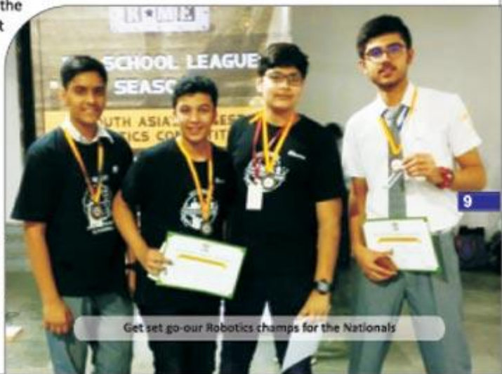
Get set go-our Robotics champs for the Nationals