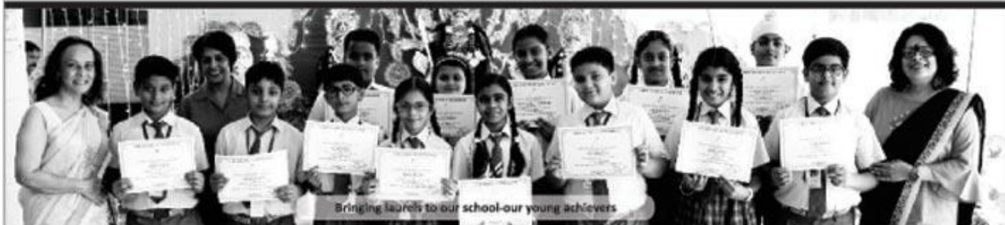
Bringing laurels to our school-our young achievers