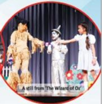
A still from 'The Wizard of Oz'