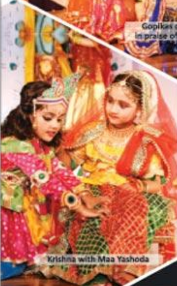
Krishna with Maa Yashoda

About 170 students participated in the event and made it a grand success.