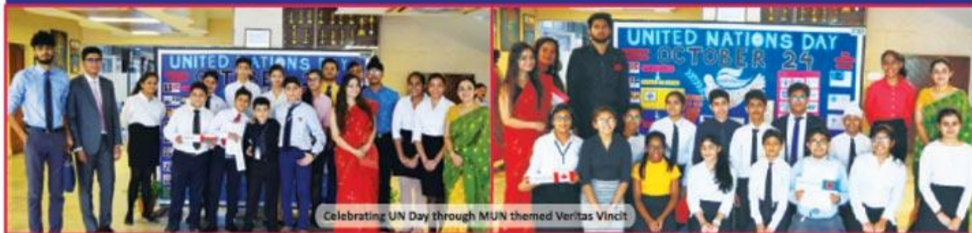
Celebrating UN Day through MUN themed Veritas Vincit