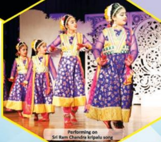
Performing on Sri Ram Chandra krpalu song