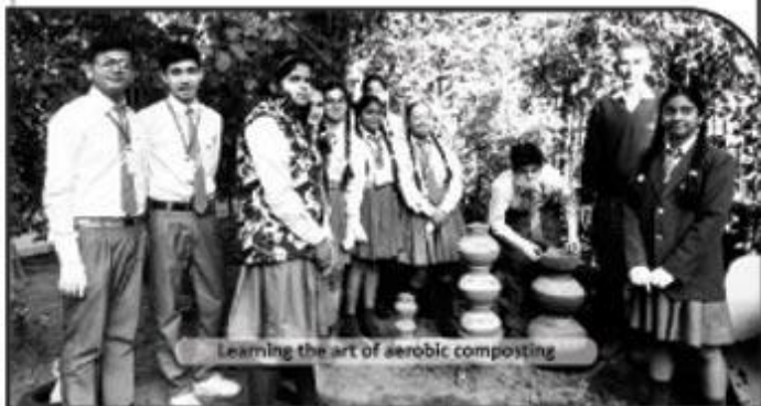
Learning the art of aerobic composting