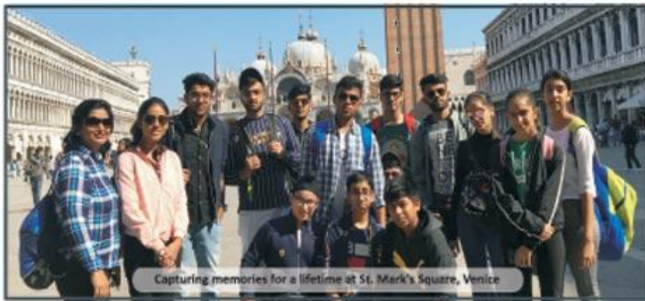
Capturing memories for a lifetime at St. Mark's Square, Venice