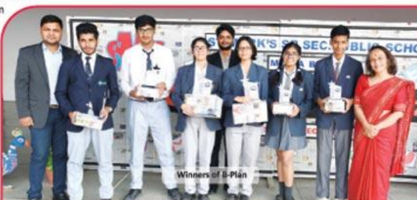
Winners of B-Plan

Judged by the prominent people of the field from Delhi University, NSIT Delhi, NIIT University, Edu next and Singgridcorp. etc. Being the host school, our school was not competing for the rolling trophy which was bagged by D.P.S, R.K. Puram and Indraprastha World School, Dwarka won the runner-up for the rolling trophy. The event was sponsored by Microsoft, Ebix Smartclass, Edunext, DeLL, SGT University, Bennett University, NIIT University, IL & FS Education, Aakash Institute & Geeksforgeeks.org. Prize distribution ceremony was attended by the leaders of Microsoft, IL & FS Education, iBall and Edunext.