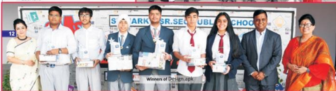
Winners of Design.apk