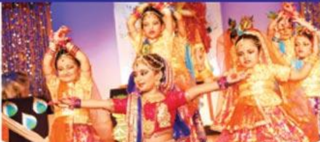
Gopikas dancing in praise of the Lord