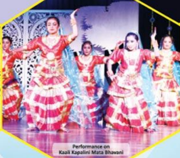
Performance on Kaali Kapalini Mata Bhavani