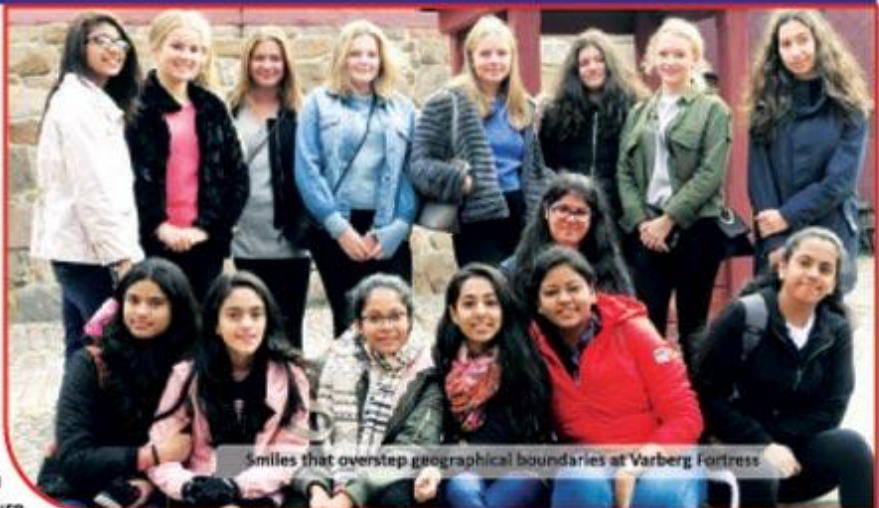
Smiles that overstep geographical boundaries at Varberg Fortress