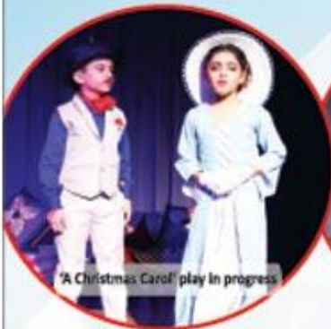
'A Christmas Carol' play in progress