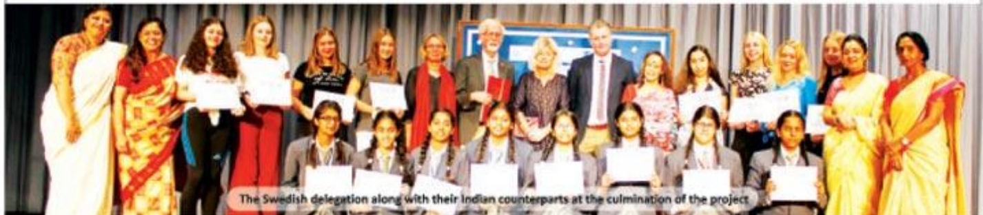
The Swedish delegation along with their Indian counterparts at the culmination of the project