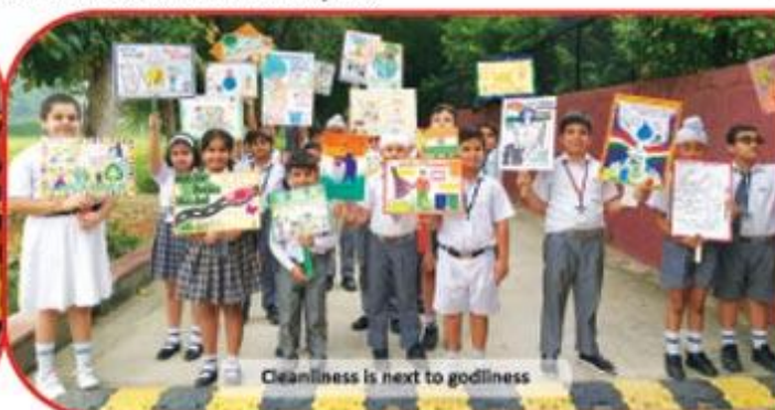
Cleanliness is next to godliness