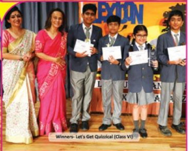
Winners- Let's Get Quizical (Class VI)