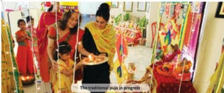
The traditional puja in progress

Ganesh Chaturthi, the birth of Lord Ganesha, the son of Lord Shiva and Parvati, also known as Vinayak Chaturthi or Ganesh Utsav was celebrated in our school. The celebration started with the lamp lighting and aarti. The students of class 1 chanted the shlokas and were also told about the life of Lord Ganesha. They were told how to celebrate Ganesh Chaturthi and what the different body parts of Lord Ganesha signify. It was a great learning experience for the students.