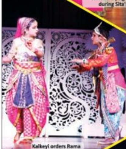
Kaikeyi orders Rama to go into exile