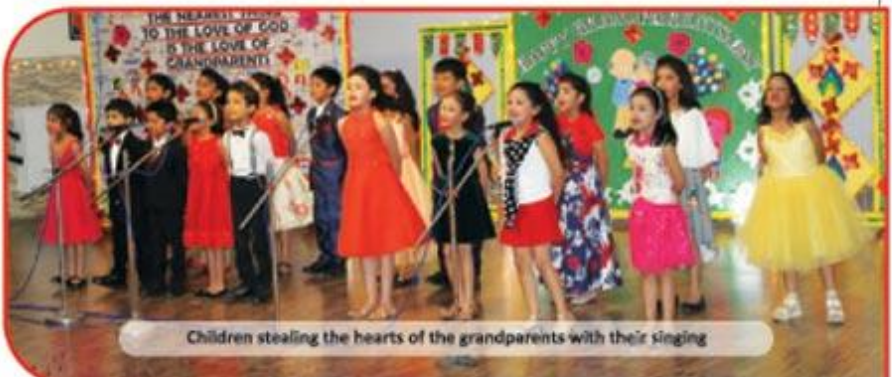
Children stealing the hearts of the grandparents with their singing

Grandparents are a family's strong foundation. Through their love and affection they keep the family united, so to honour them, we organized 'Grandparents Day' on 11 September 2018. The students of Grade II presented a show wherein they danced and sang melodious songs of their era. They even performed a street play. All the performances were applauded and appreciated by the Principal, Vice Principals and the grandparents.