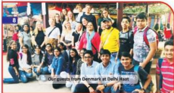
Our guests from Denmark at Delhi Haat