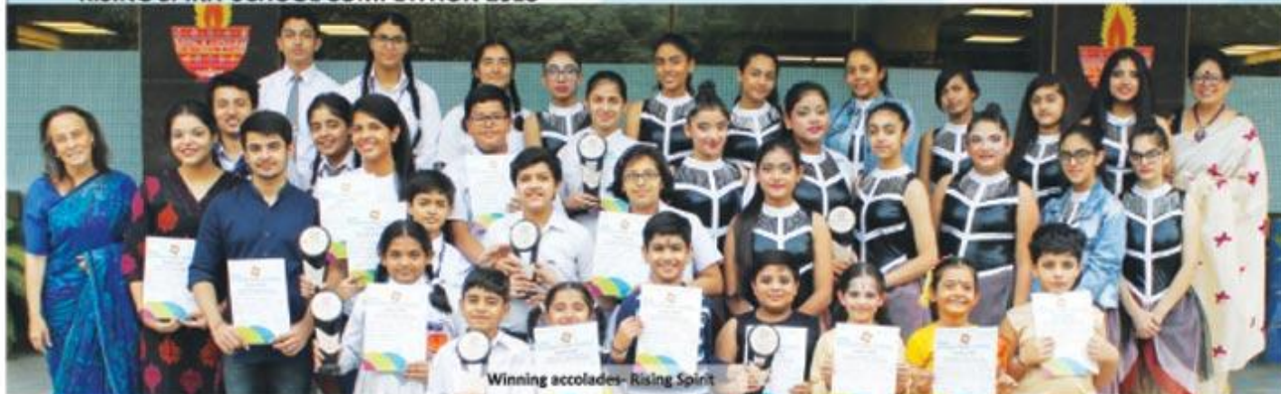
Winning accolades- Rising Spirit

35 Students from Classes I to XI of our school participated in different events in Rising Spirit Inter School Competition -2018 organized on 26 October, 2018 by Shah International School, Paschim Vihar. The students won prizes in the following events: