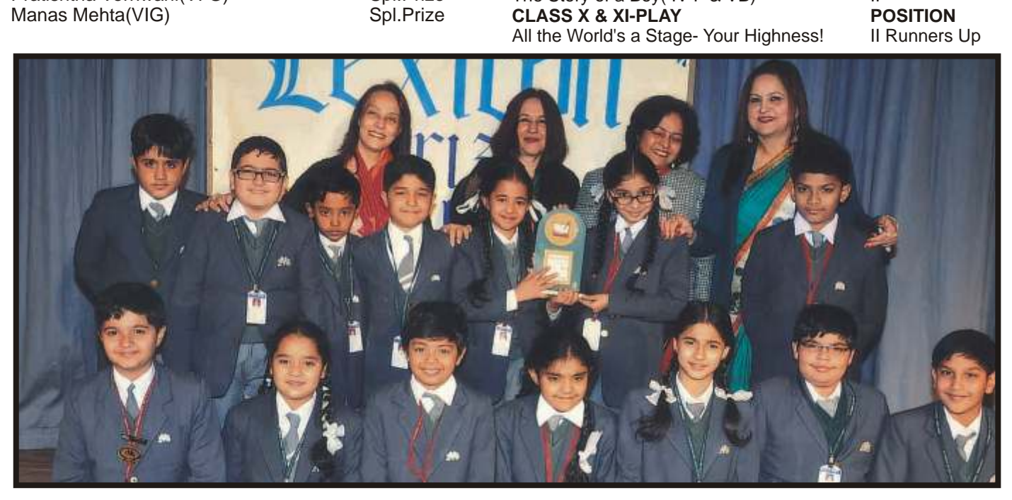
Class IV bagged the Second prize in English Play Competition during Lexicon.