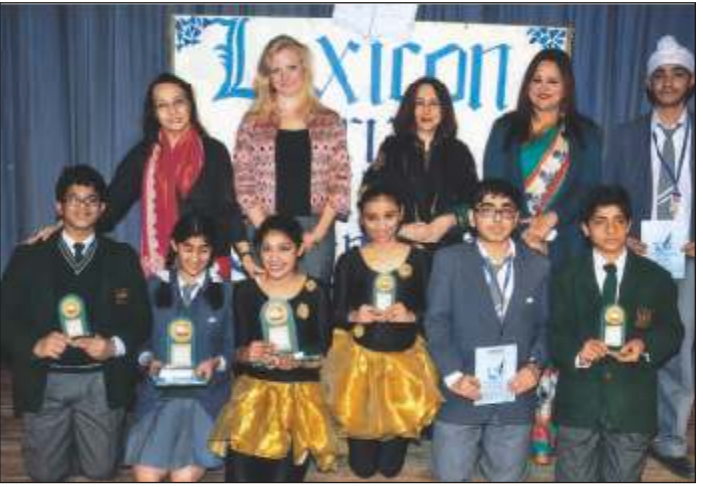
Poetry Dramatization Winners- Lexicon 2013.