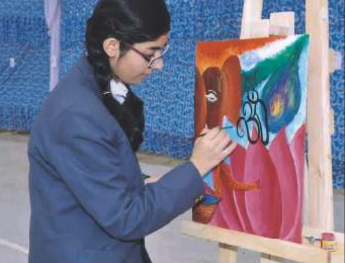
Artists at Work.