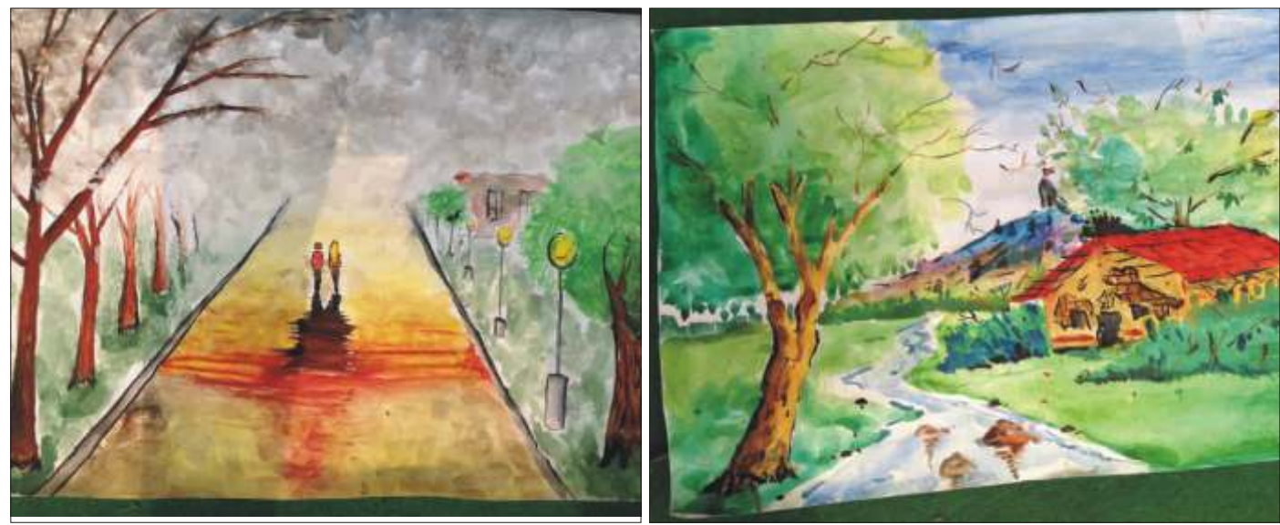
Creativity at its Best – Paintings By : Varun Sethi (6 C) and Acchyut Jolly(VI A).