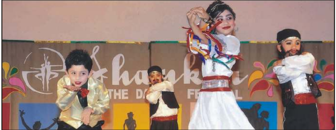
The madness of Shammi Kapoor spreads on stage with 'Suku-Suku'.