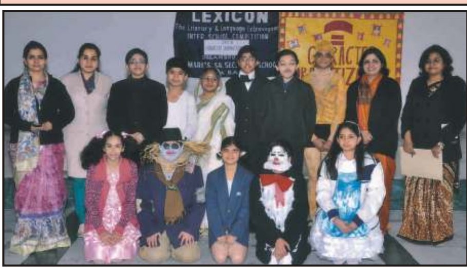
Popular fictional characters.

"Books are the carriers of civilization. Without books, history is silent, literature dumb, science crippled, thought and speculation at a standstill. They are engines of change, windows to the world, lighthouses erected in the sea of time." Barbara Tuchman. The new year began on a positive note when approximately 25 schools from all over Delhi participated in LEXICON-A LITERARY AND LANGUAGE EXTRAVAGANZA, an Inter School event organized by our school from 18 Jan'2013 to 23 Jan'2013. More than 900 students participated in the event which was divided into 3 categories primary, middle and seniors. The little ones captured everyone's attention by