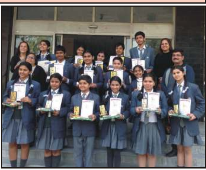
Kudos to the Winners of the Art Contest.