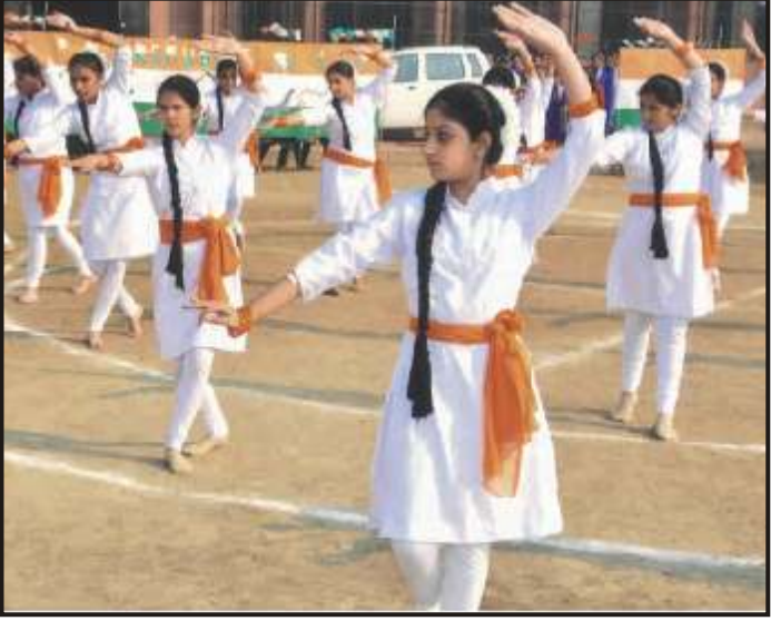
Students dancing to the beats of patriotic songs.