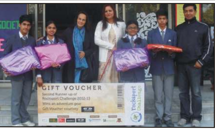
The Winners of Rocksport Challenge with their rewards