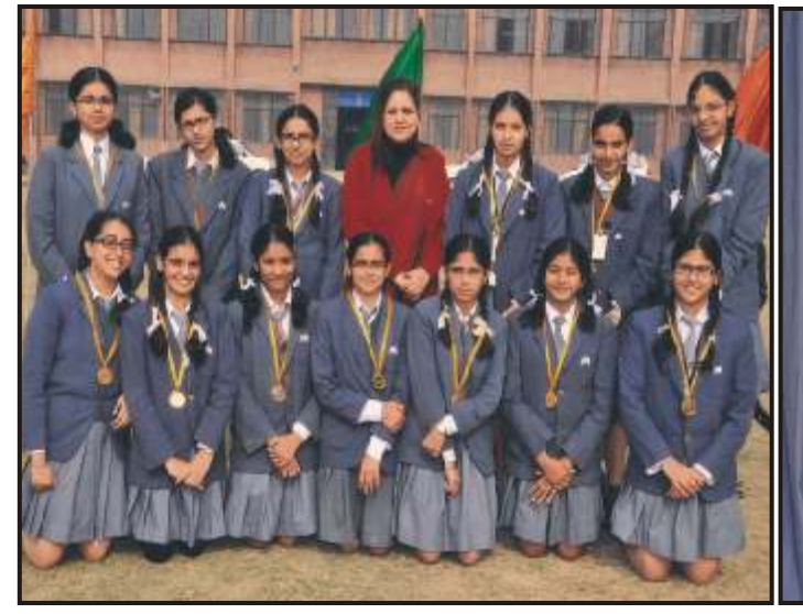
The Winning Streak- Nehru House Girls' Basketball Team.