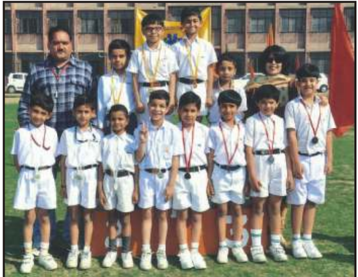
Our young sprinters with their medals