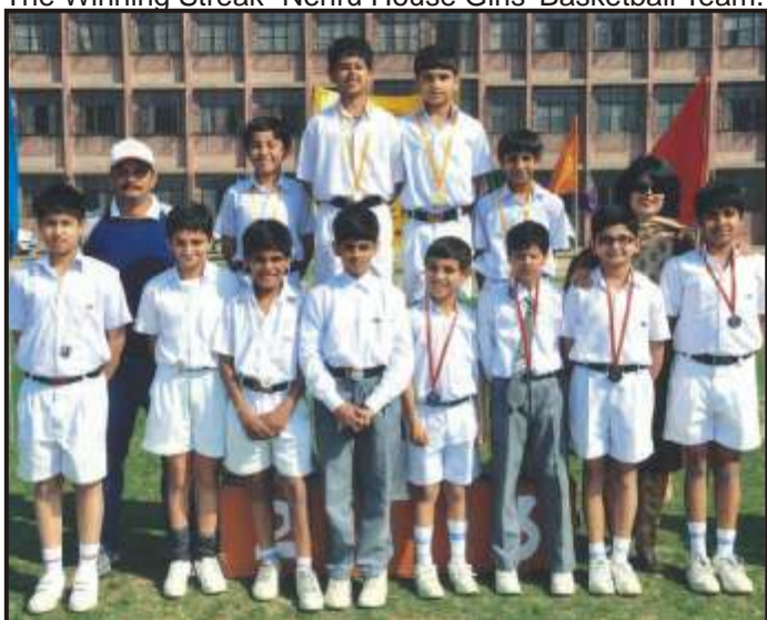
Winners of Relay Race - Class V