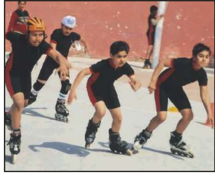
Hot Wheels on the Go.