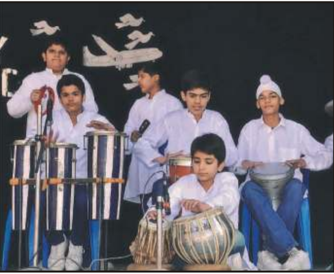
The Orchestra lending music to Republic Day Celebrations.