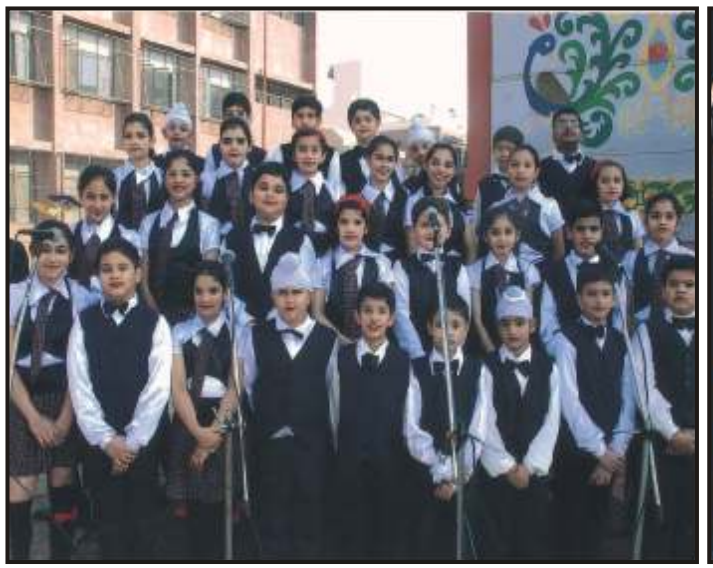
The Choir ushering in the fever of Christmas.