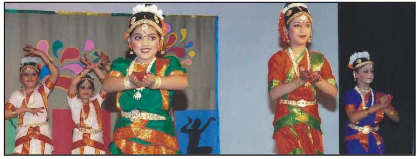
The classic beauty of Bharatnatyam on stage.

This was followed by 'Taal'-an Indo Western fusion dance. The celebration of 100 years of Hindi cinema was the real treat to the eyes of the audience as they witnessed three performances each of the black and white era, the coloured era, the golden period and the modern period. The transformation from the 40's to the 21<sup>t</sup> century left the audience awestruck. The finale was a tribute to the great showman 'Raj Kapoor'. The programme ended with the rendering of a beautiful and melodious song 'We are the world' by the school choir. The audience was mesmerized by the entire programme and the hall reverberated with their whole hearted appreciation.