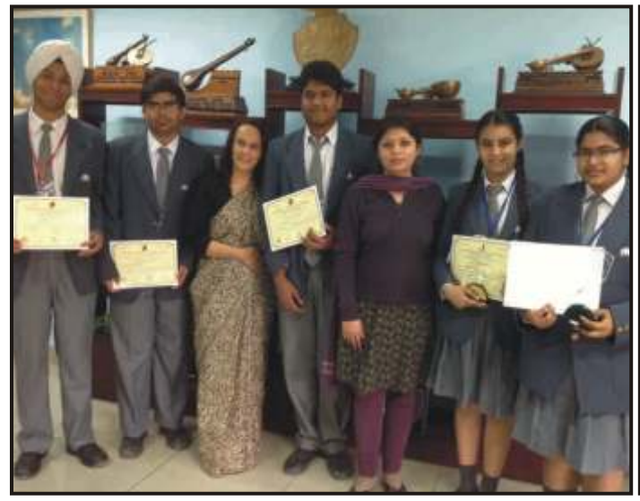
Winners of International Commerce Olympiad.