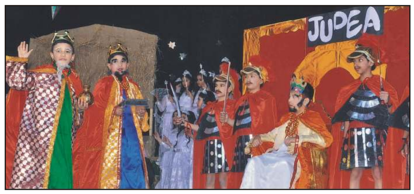
The birth of Jesus Christ was beautifully enacted.

The students of classes IV and V celebrated Christmas with a festive spirit in the school premises. The students of class IV presented a nativity play about the birth of Jesus Christ. The choir group of classes IV & V sang carols with excellent musical accompaniment that gladdened the hearts of all present.