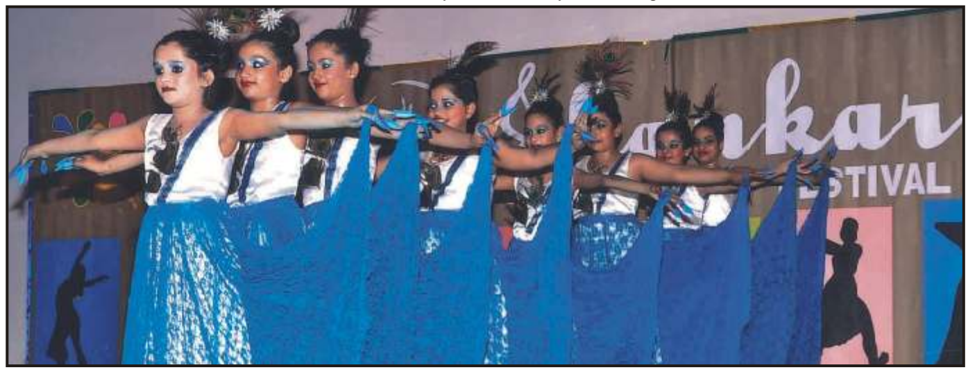
The Peacock Dance of China.