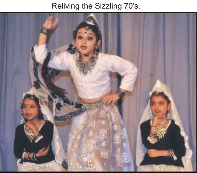
The graceful 'Oui Ma Oui Ma' from Parasmani