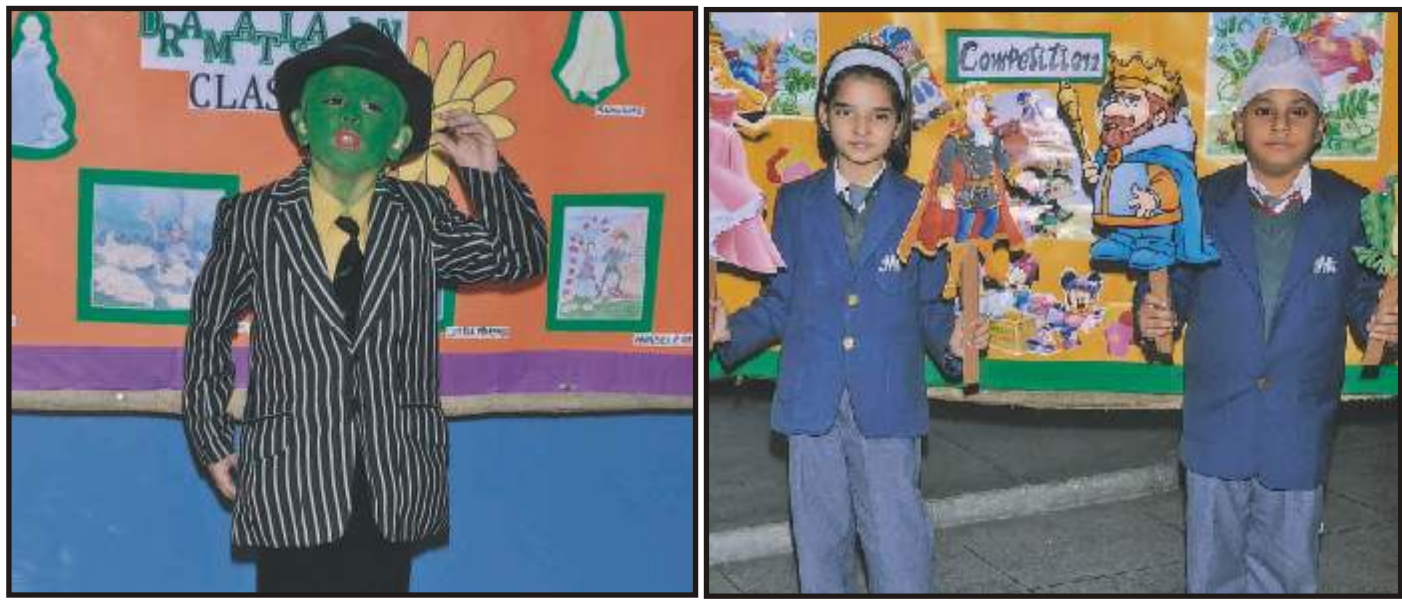
Our very own Jim Carrey performing ' The Mask'.