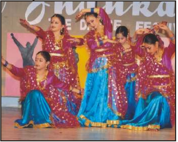
Kathak Dance in progress.