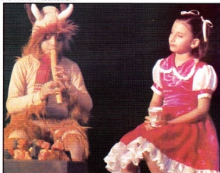
Enactment of 'The Chronicles of Narnia' by class V students.