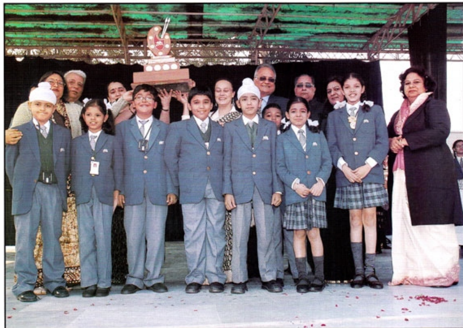
Our young artists emerge winners.

"Ramjas Foundation Art Contest" was organized in 2008-09 whose results were announced lately and many students emerged victorious in painting and collage making. The winners are :-