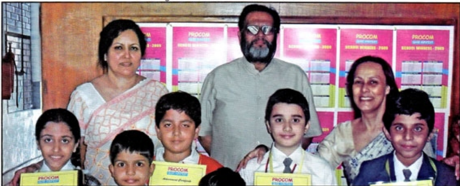
Science is our forte - Science Quiz winners