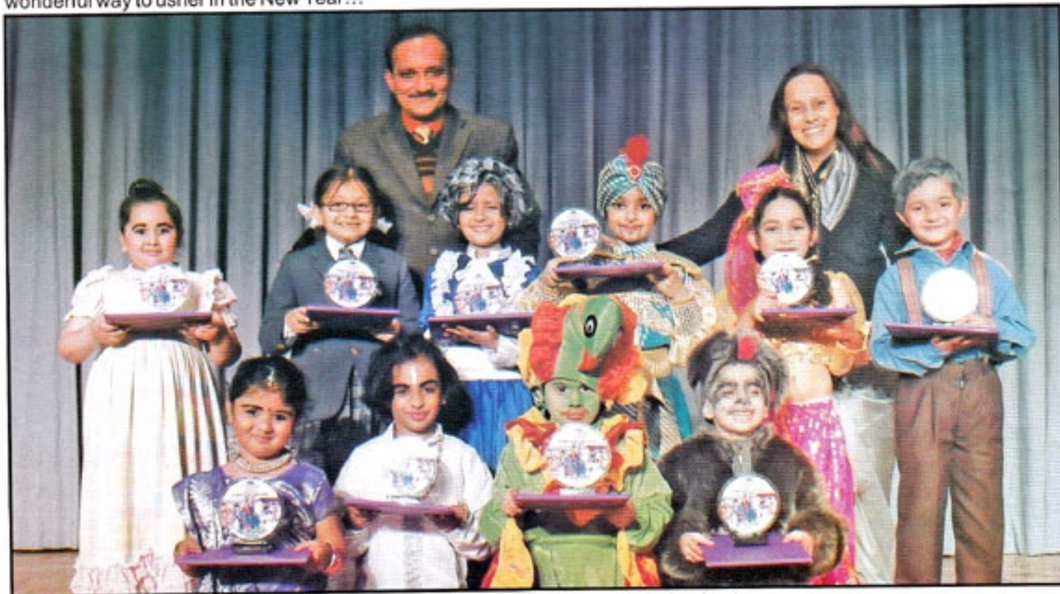
The winners of English Play (Class I) during Lexicon.