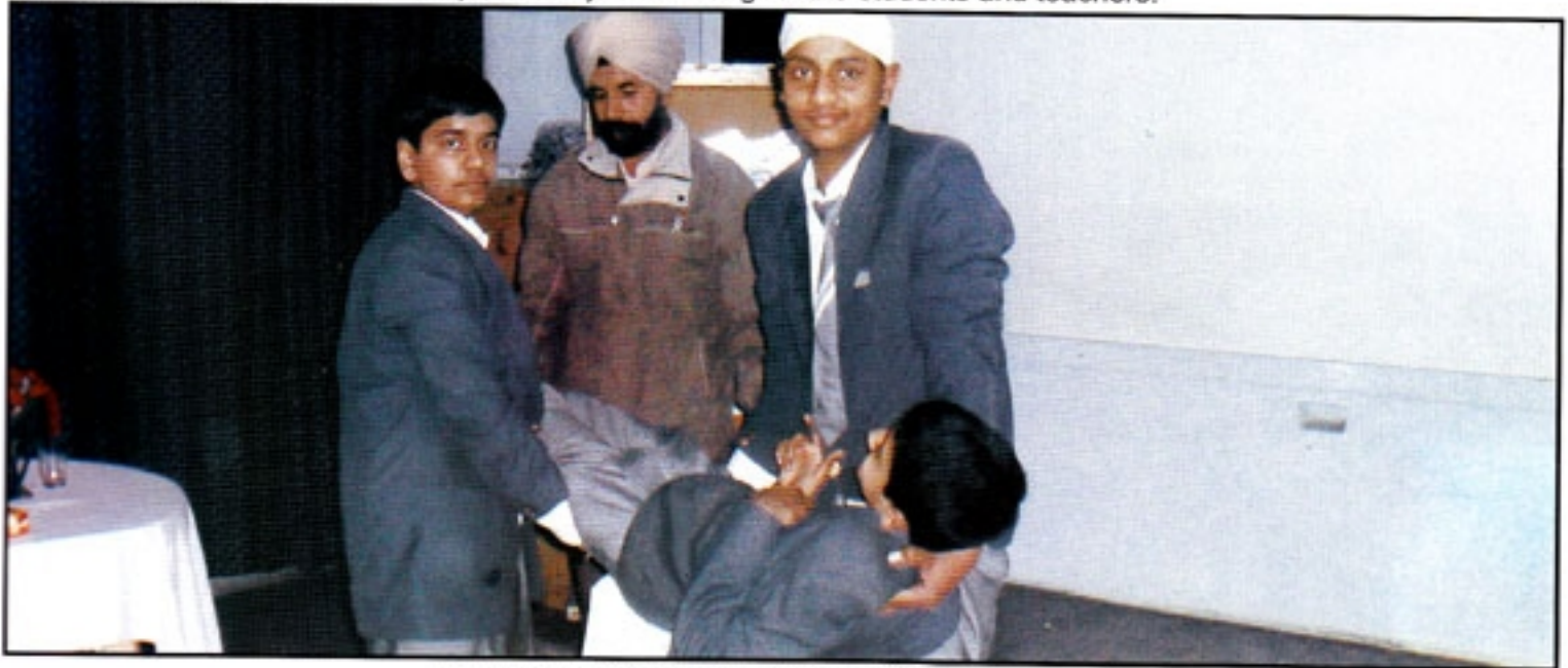
Students received training in disaster management.

A workshop on Disaster Management was organized by Red Cross Society of India on 28.1.2010 at our school. Selected students from class IX attended this workshop in which students were guided to meet various emergencies caused due to natural and man made disasters. The Fire Department too conducted a workshop in which the students were told various ways to handle different types of fire extinguishers. The workshop was very illuminating for the students and teachers.