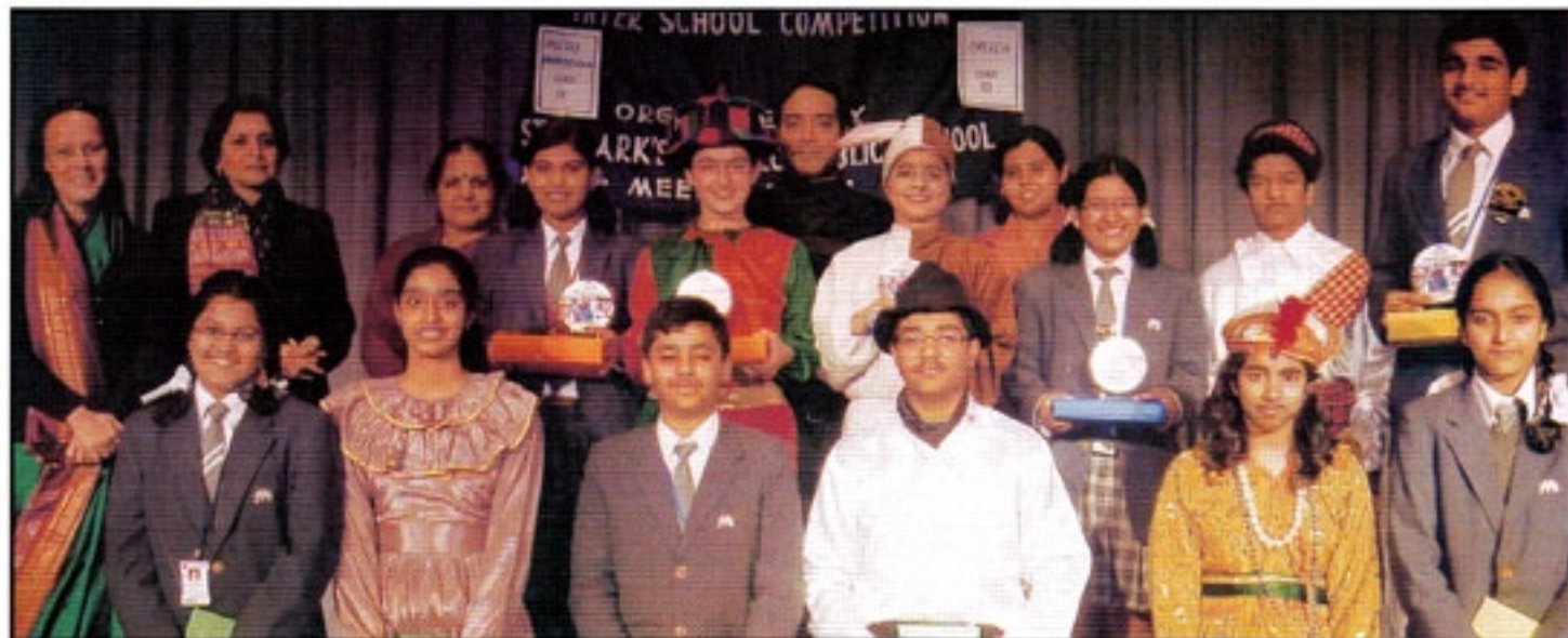
The proud winners of Poetry Dramatization (class IX) at Lexicon.

'Language is called the garment of thought'