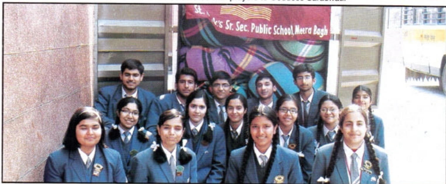
Students with contribution for 'Goonj'.