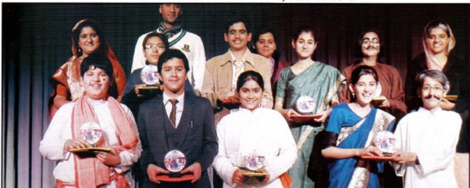
The young actors with their trophies - Hindi Play class VIII.