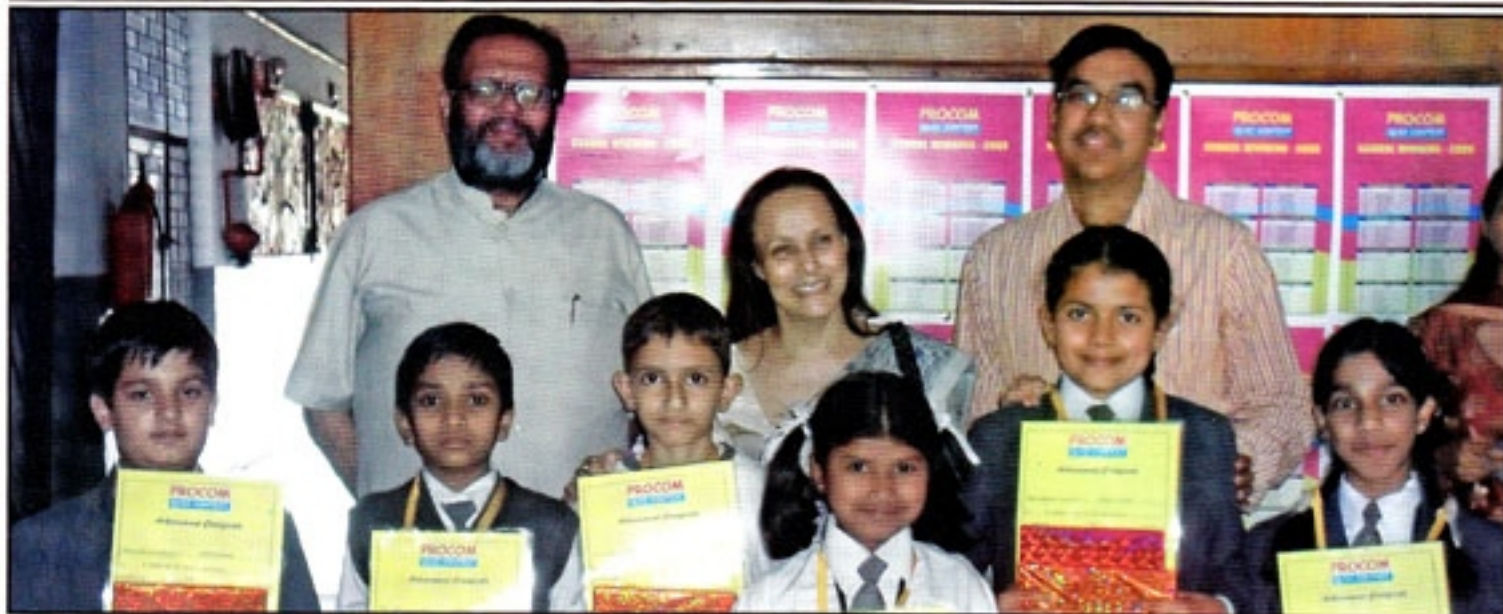
The Aptitude Quiz winners