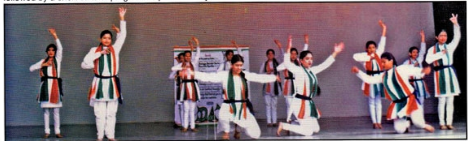
Students showcase the patriotic fervour on Republic Day.