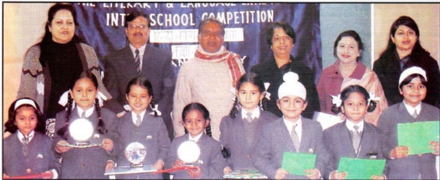
Winners of I, II, III for the Hindi Recitation