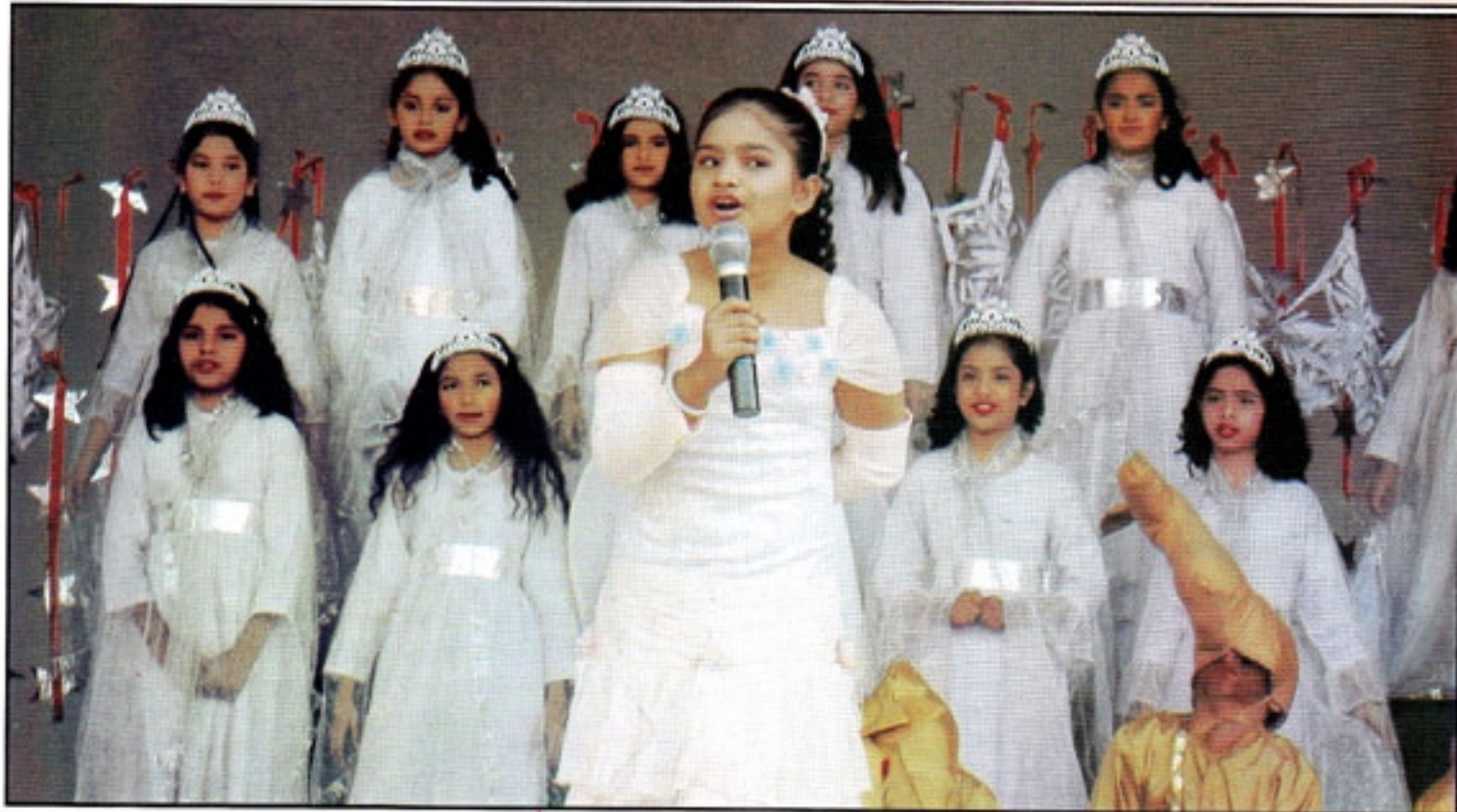
The angels came down to celebrate Christmas.