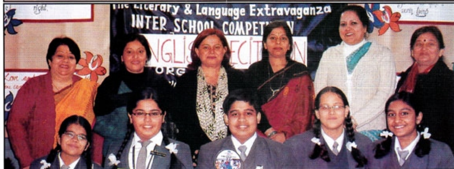
English poetry Recitation winners class VIII - Lexicon.