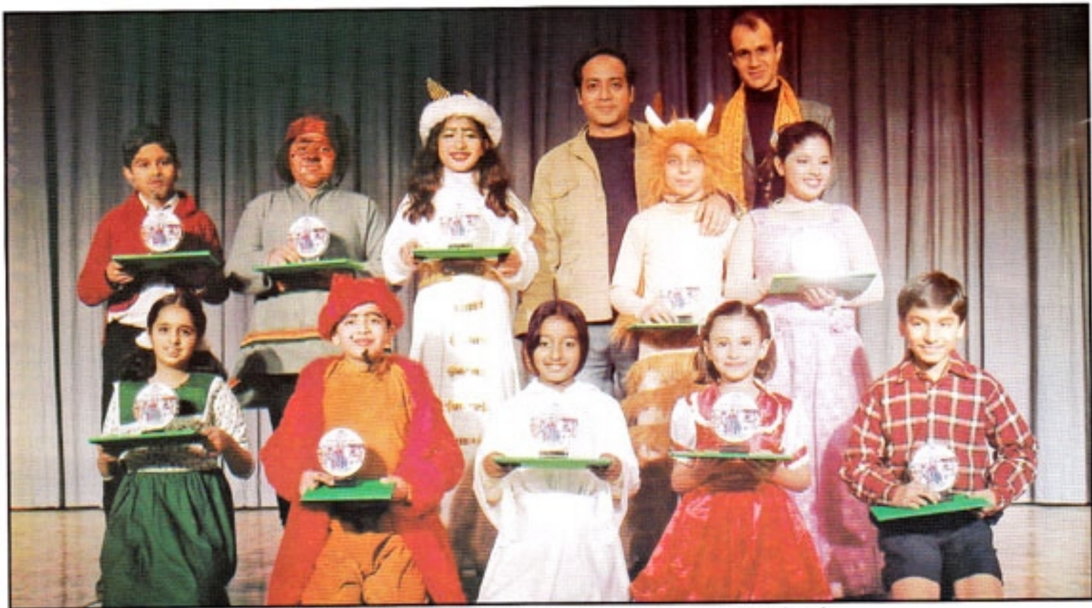
The winners of class V during the Theatre Festival (Lexicon)