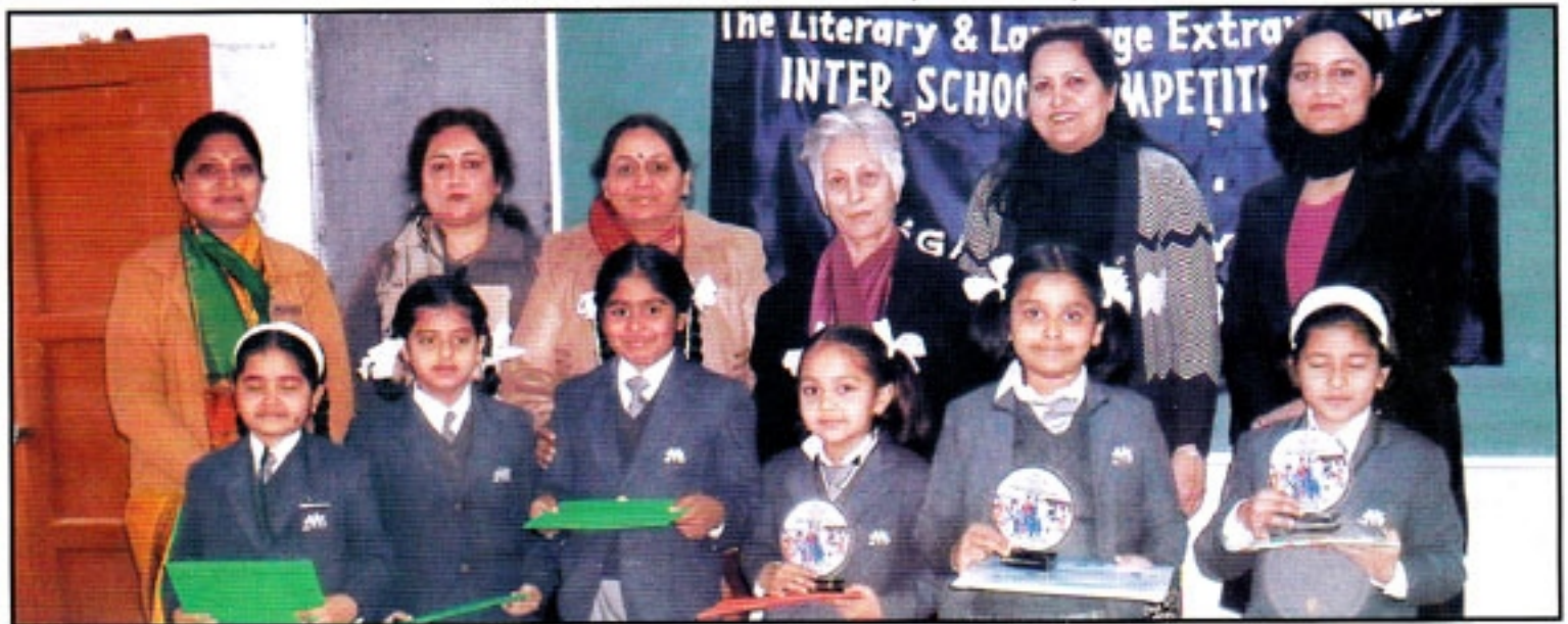
Winners of English Recitation Competition - class I (Lexicon).