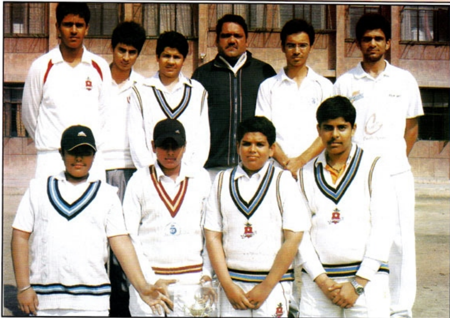
The victorious cricket team.

Our school Cricket team won the runners-up trophy of Delhi State Seven a Side Cricket Tournament held at Laxmibai College organized by Dainik Jagran newspaper. The players were the following :-