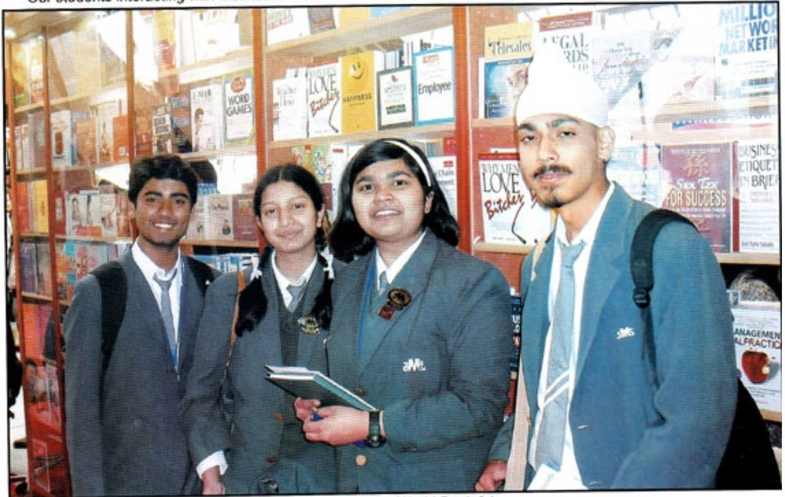
Students at the World Book fair.