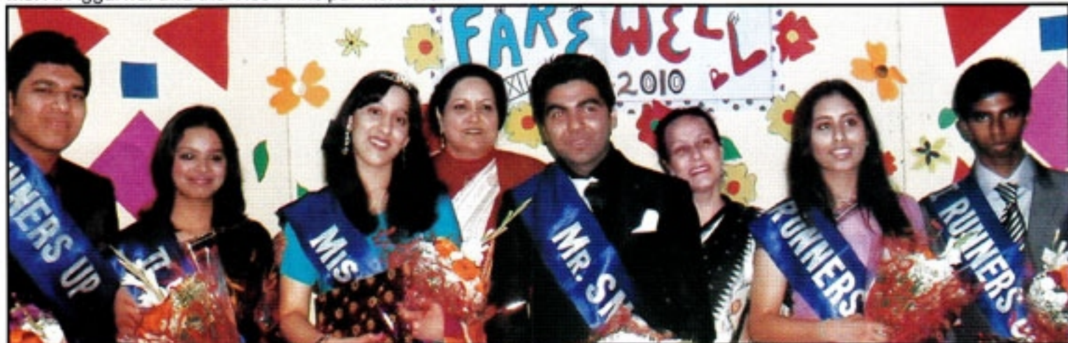
The proud winners of the titles at the farewell to class XII.