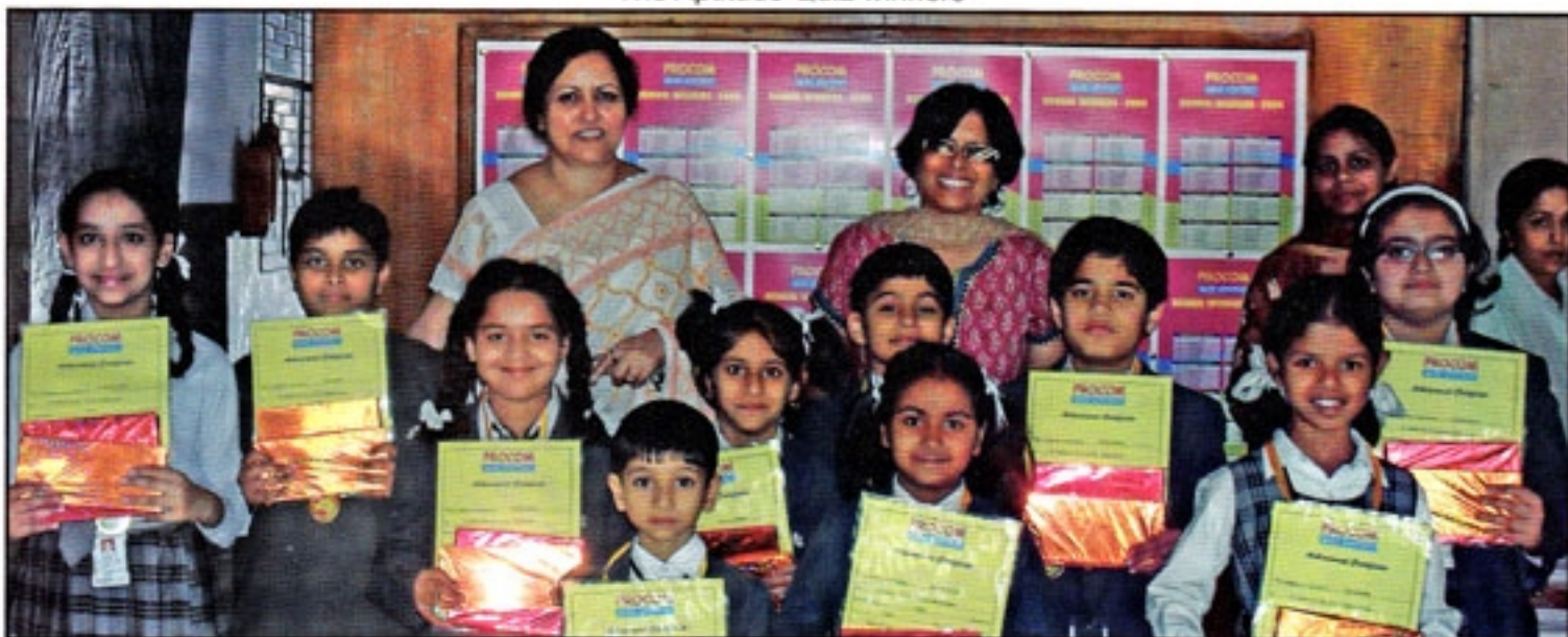
We are good at Colour and Puzzles - The winners