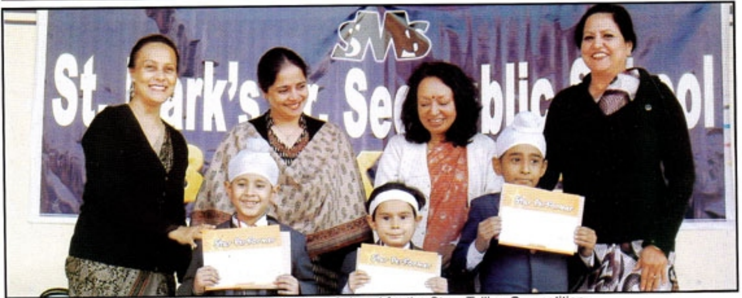
The victorious story tellers of class I for the Story Telling Competition