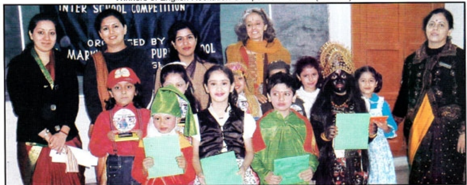
The Class II winners of Character Dramatization (Lexicon).