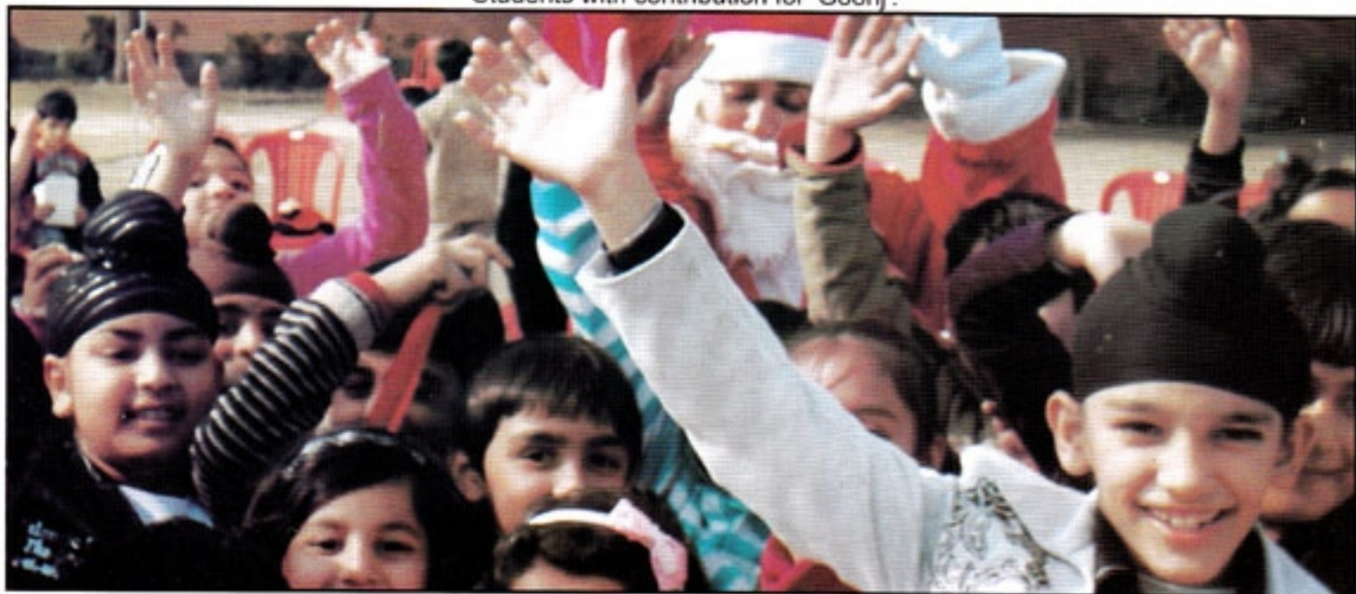
Christmas party in progress.