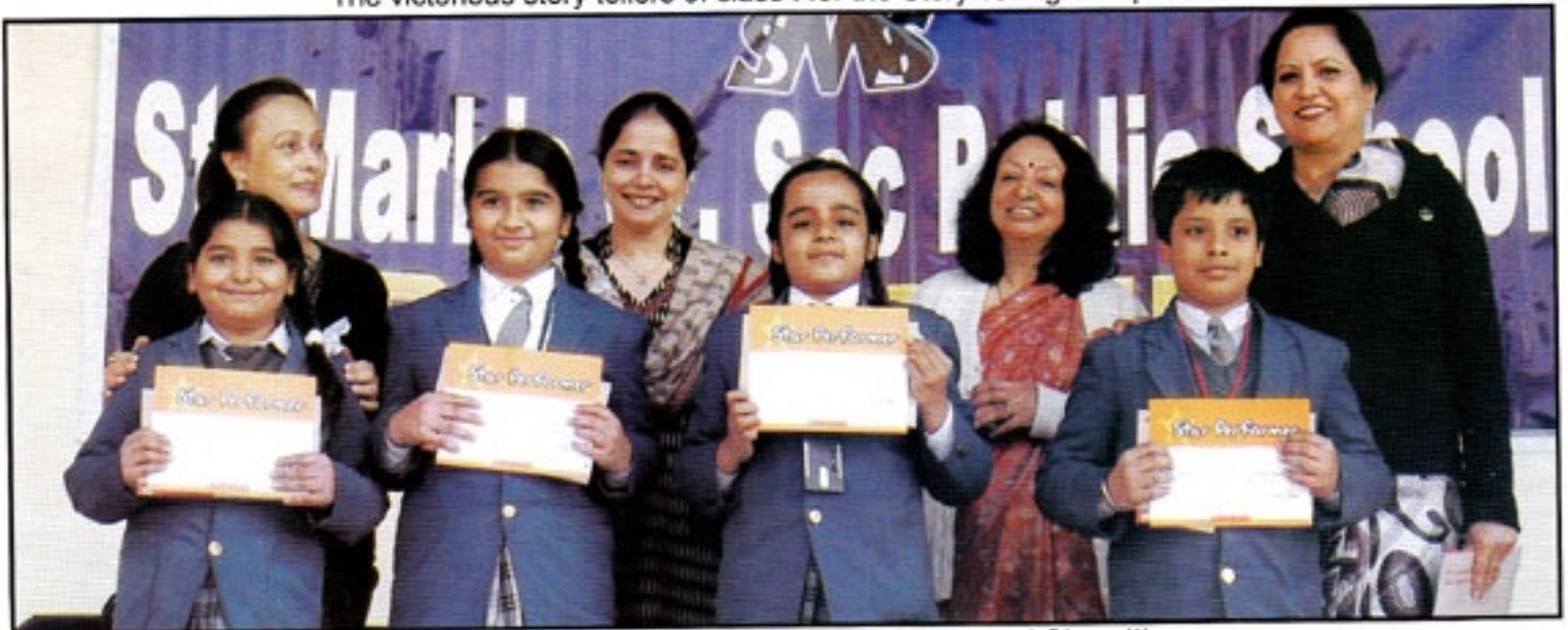
The proud winners of 'Read and Enact a story' Class III