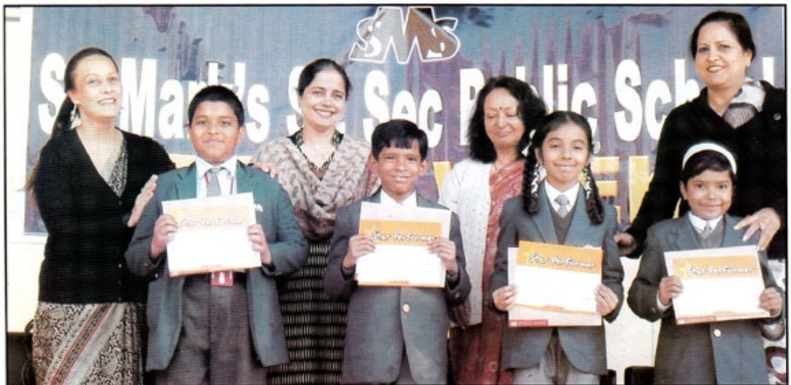
The winners of 'Quiz on Fairy Tales and Nursery Rhymes' at Book Week.