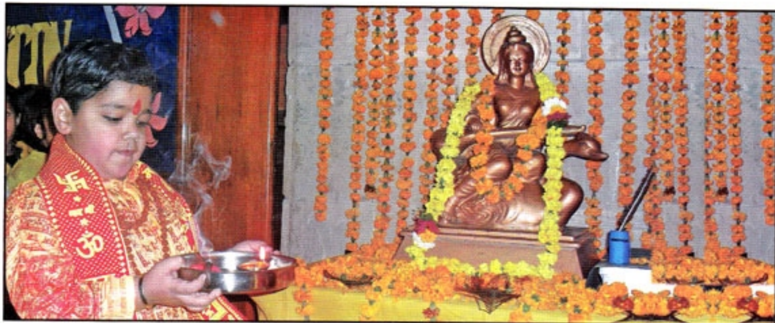
Basant Panchmi celebrated with prayers to Goddess Saraswati.