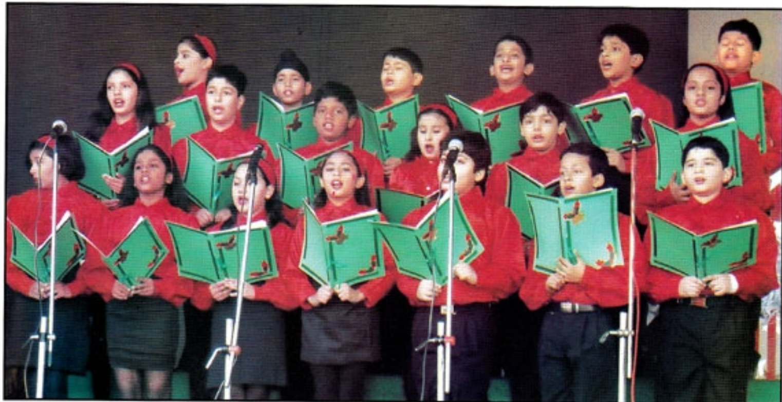
The school choir during Christmas.

Christmas parties were organized for the young children from 21 to 23 December with interesting activities, games, sports and magic shows and fun. All the students thoroughly enjoyed the parties and went home happily with gifts from their dear Santa Claus.