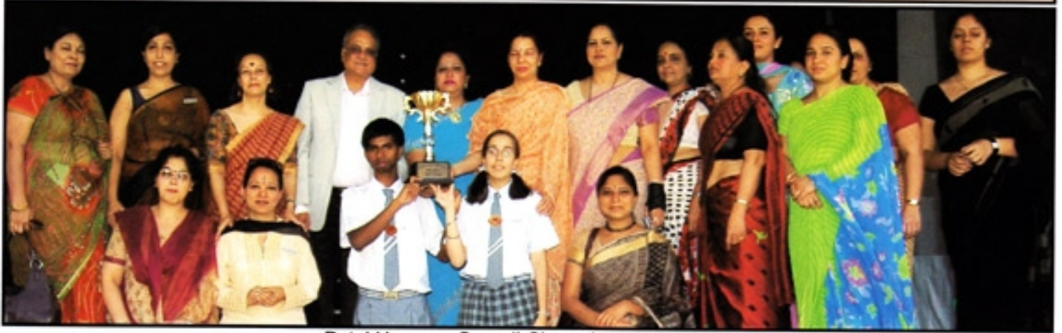
Patel House - Overall Champions - 2008 - 09