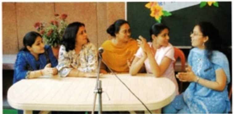
Teachers play games too