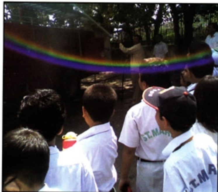
Students watch the working of the fire brigade

Our students of classes I, II and III and 6 students of V F of Exploration Club were taken to the Fire station Meera Bagh. They were shown the working of the fire brigades, different type of fire bus services and were also told on how to prevent fire mishappenings and what to do if there is a fire. In all it was a great learning experience for all of them.