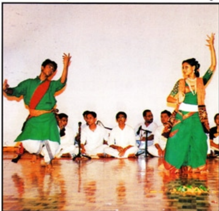
Our friends from Shanti Niketan enthrall the audience

Thereafter they interacted with our students and even taught them how to make Rakhis for the occasion of Raksha Bandhan. They enjoyed the food of Delhi and the sight seeing in particular. It was a privilege to have this group of students from the eastern part of India. It was a wonderful learning experience indeed proving that distances don't really matter!