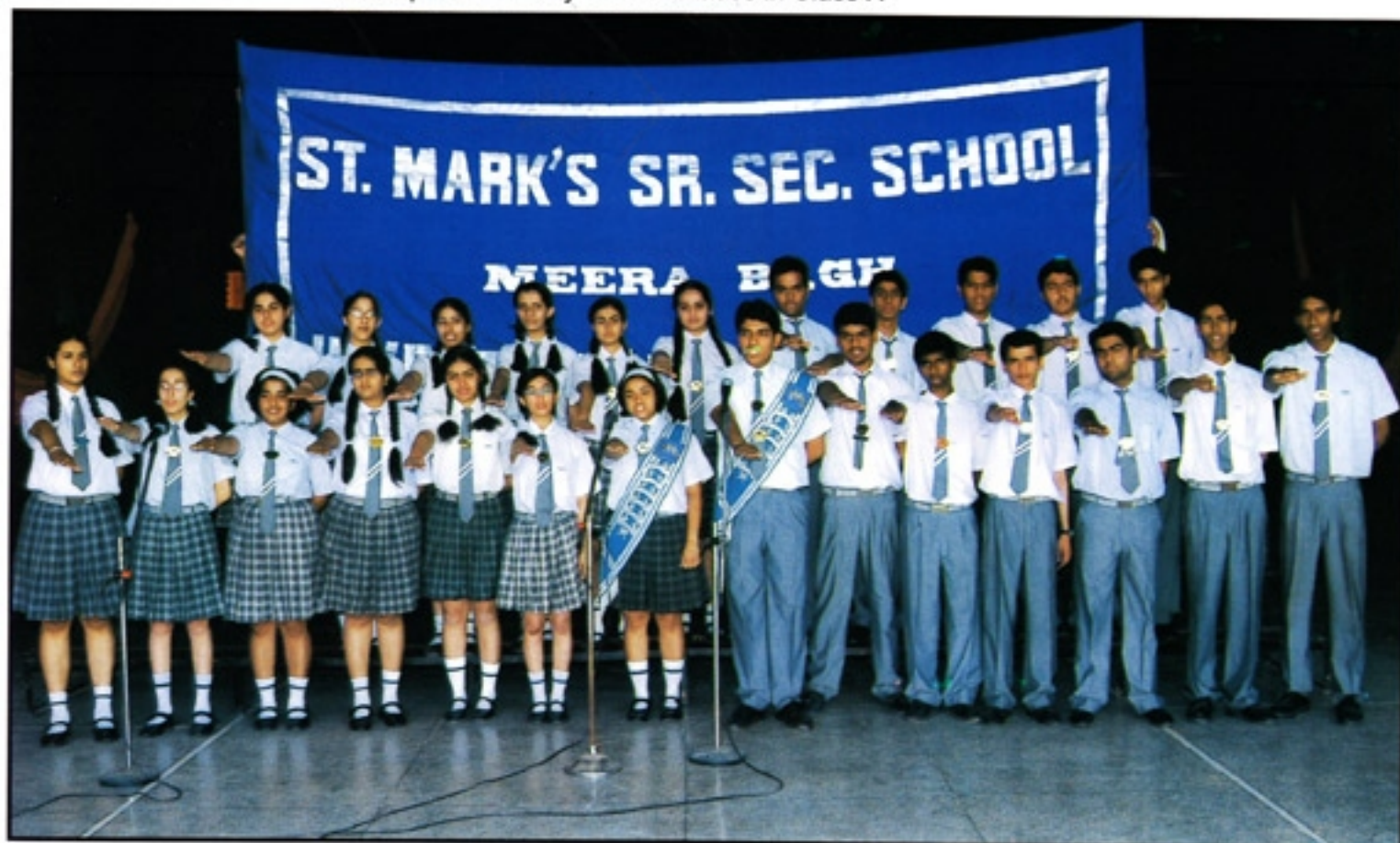
We pledge our dedication to our school - The Senior Office Bearers