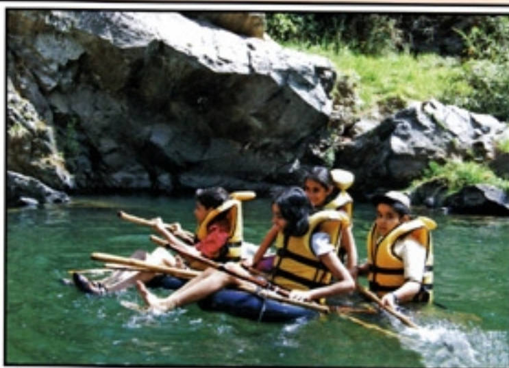
River rafting - an unusual experience

It was an exciting and enriching experience for the students as the activities really boosted their confidence level.