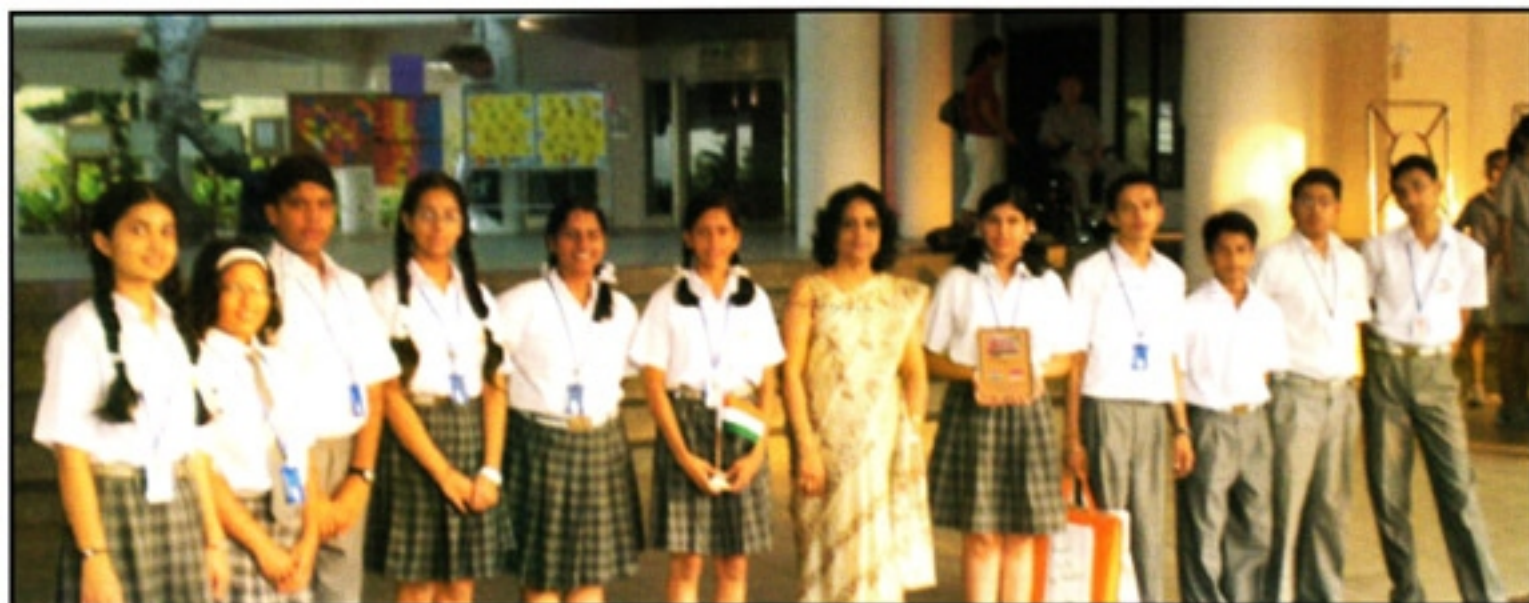
Our enthusiastic delegation at National Junior College, Singapore