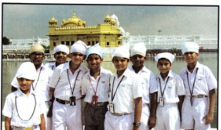
Visiting Sri Harminder Sahib