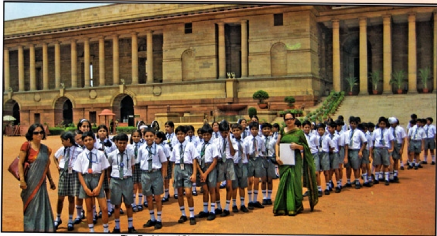
The Rashtrapati Bhawan leaves students spellbound.

70 students of class - V were taken on a visit to the Rashtrapati Bhawan. They were escorted by four teachers. This visit was organised by HT Pace. It was indeed an interesting and fruitful outing for the students as - well - as the teachers. A guide showed them around the Rashtrapati Bhawan and were shown the various halls namely Darbar Hall, Ashoka Hall and Banquet Hall where the Civil awards, Gallantry awards and functions are held respectively. There is a wonderful statue of Lord Buddha with his 1001 hands. It was presented to the first President of India, Dr. Rajendra Prasad by the Government of Vietnam. Various museums and the statues of all the previous Presidents of India were also shown. Overall, it was indeed an interesting and informative visit and the students surely gained a lot.