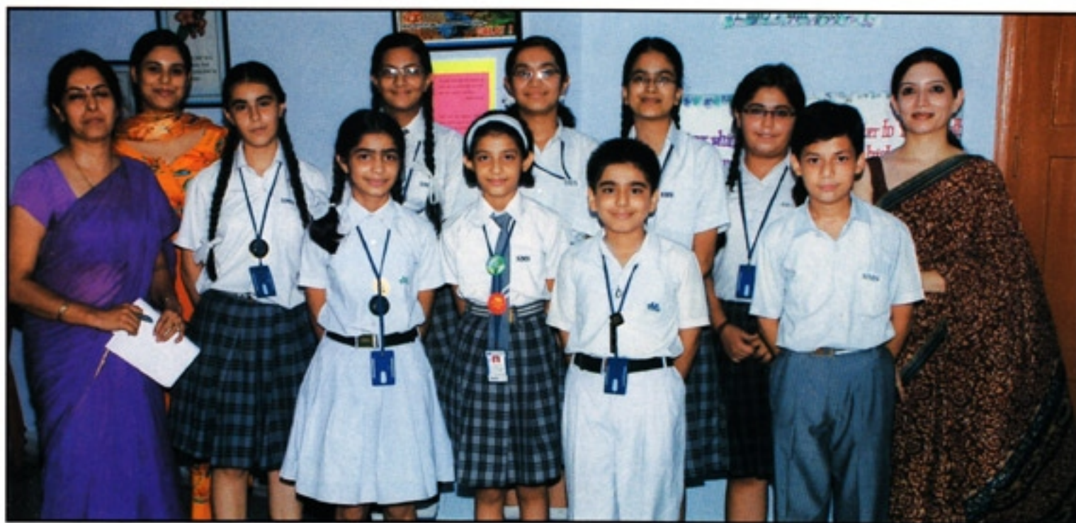
The Winners of English Recitation - VI - VIII