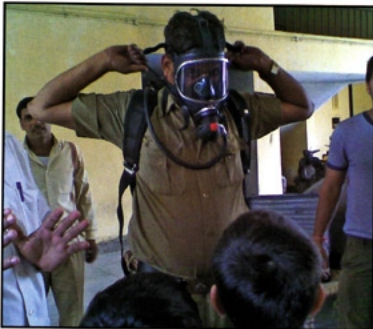
Use of face mask during a fire being demonstrated.

Our students of classes I, II and III and 6 students of V F of Exploration Club were taken to the Fire station Meera Bagh. They were shown the working of the fire brigades, different type of fire bus services and were also told on how to prevent fire mishappenings and what to do if there is a fire. In all it was a great learning experience for all of them.