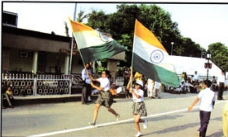
An honour indeed to hold aloft our National Flag

An educational trip to Amritsar was organized for students of class V, on 28 and 29 August 2009. They were given an extensive guided tour of the Jallianwala Bagh and the Golden Temple. They were made aware of the religious history of the place and also the patriotic fervour in the people of Punjab. The students also witnessed the Retreat Ceremony and Parade by BSF Jawans at Wagah Border. The trip was an enjoyable and knowledgeable experience for the students as well as the escorting teachers. Our students were also given the honour of running with the National Flag at the Wagah border.