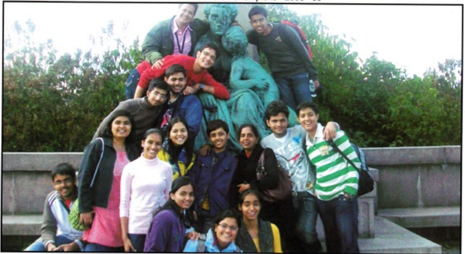
The 15 member delegation with their escort teacher at Copenhagen.