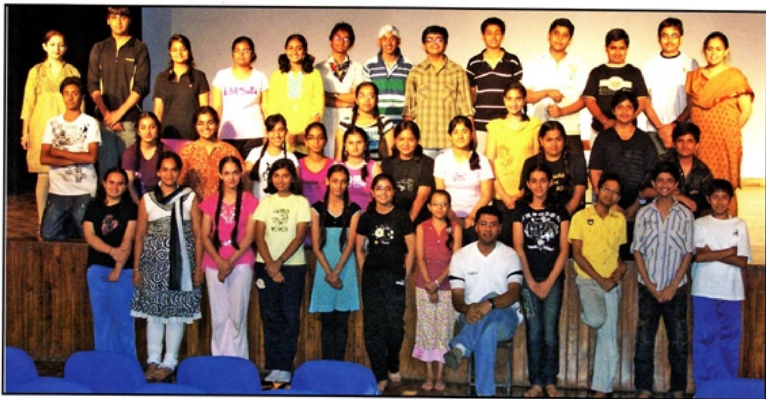
Students of classes VIII, IX and X at the theatre workshop.