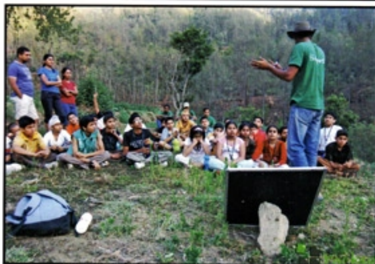
The avid listeners taking instructions at the adventure camp.