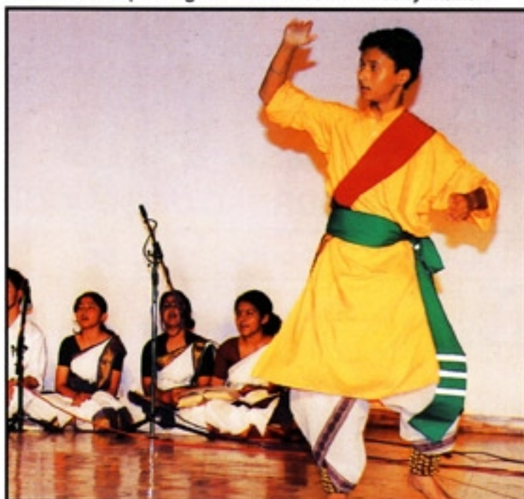
A boy of Path Bhawan performs as part of the Cultural Exchange.