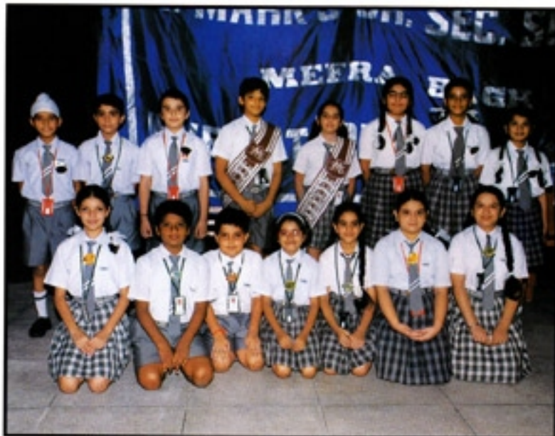
Young Shoulders Great Responsibilities - The Junior Office Bearers