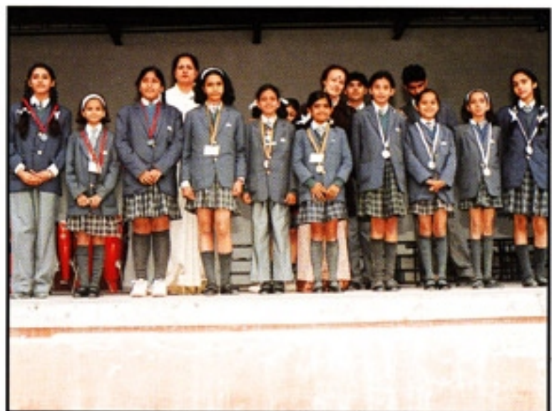
Our Junior sporting stars