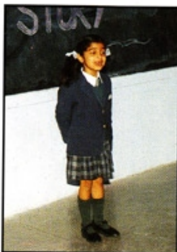
A young story teller

They displayed their artistic talents in competitions like 'Paint a Character', 'Design a Book Mark' and 'Design a Book Cover'. The Creative Writing Competition brought forth a combination of literary and artistic talent. Game shows like 'Playing with Words' and 'World of Words' tested their vocabulary skills alongwith their speed in making words.