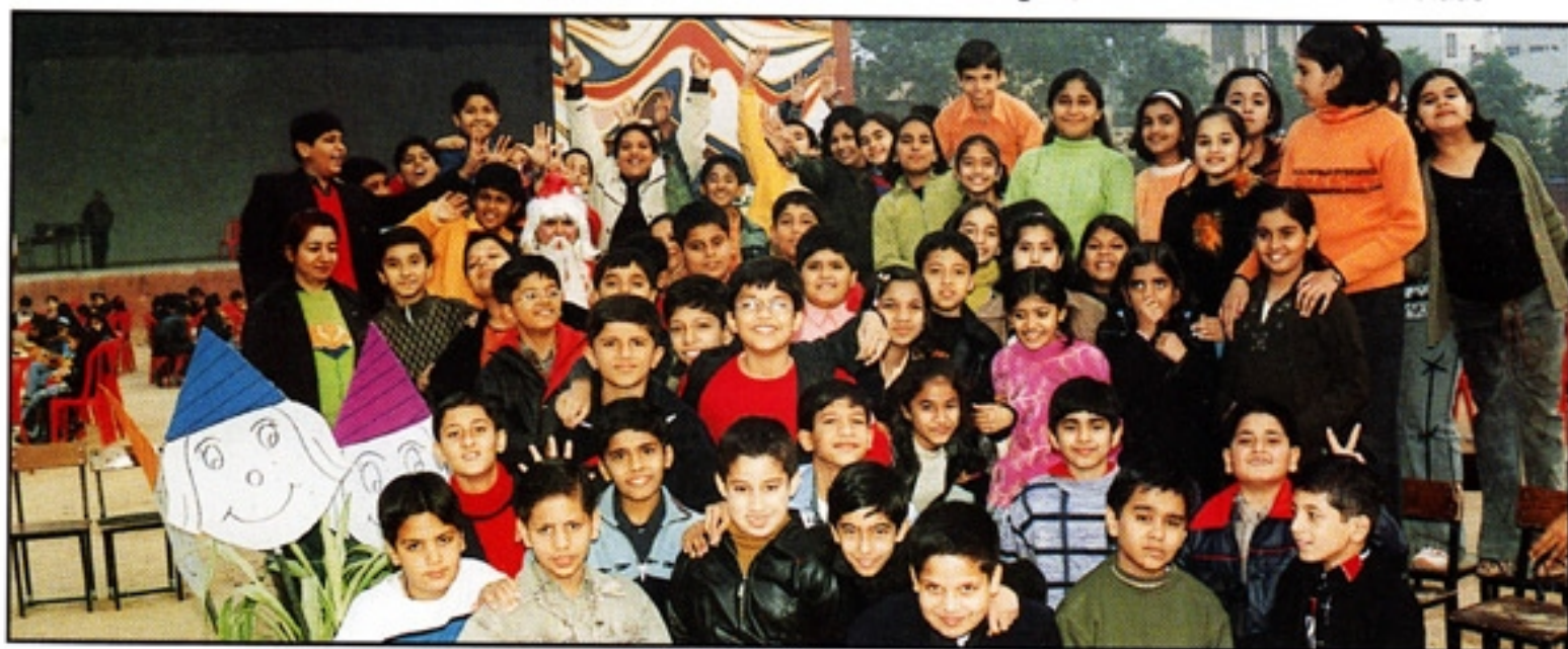
It's a season of festivity Christmas celebrations in school