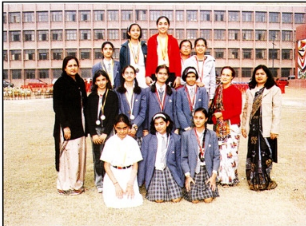
Gold, Silver, Bronze-the girls take them all