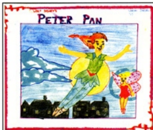
Sakshi Jindal VI