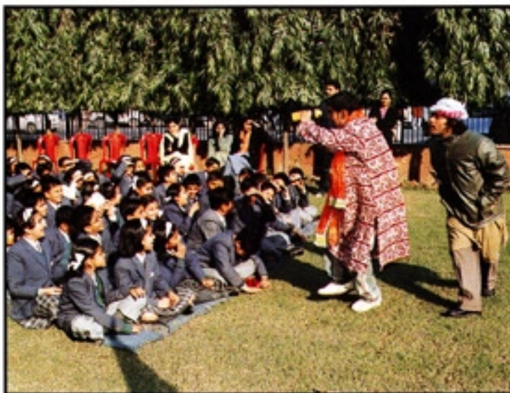
'Nukkad natak' brings forth the message of safety for all

Under the aegis of SMS Road Safety Club the 'Up Stage Group' artistes representing the transport department visited our school on 13.1.2005 and performed a 'nukkad natak' for the students highlighting the rules of the road in a very interesting manner. The entire experience was fun and very educative for the students.