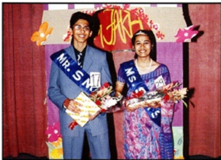
A clean sweep! Winners of the coveted titles