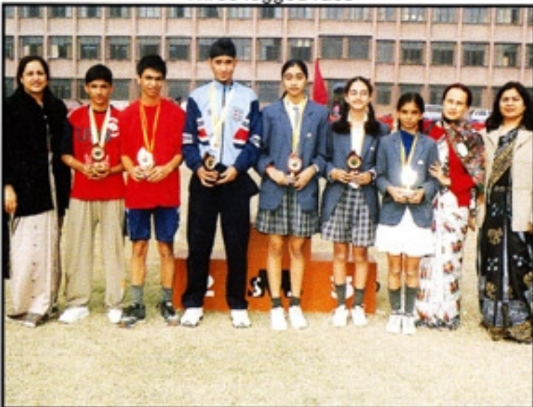
Young winning athletes enjoying a moment of pride