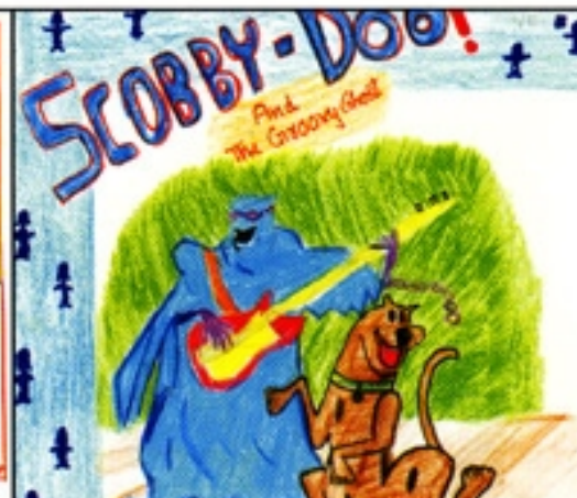
Ankita Sondhi VII

Book Cover Credits : Top Left - Arsh Marwaha VI, Top Right - Avni Dhingra VII