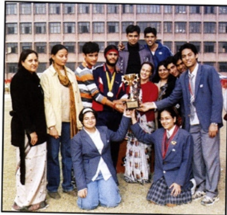
Gandhi and Patel houses - champions at the Annual Sports Day

The students of class V performed the March Past, who then took oath to take part in the events in true spirit of games and sports. This was followed with the students of class I taking part in 50m flat race followed by many other interesting events like balloon Burst race, Hurdle Sack race, Orange race, Ball-relay etc. Students of classes VI onwards participated enthusiastically in games like Football, Volleyball, Table Tennis, Badminton and Cricket. The Athletic Meet for all the categories was conducted successfully for events like 100m, 200m, 400m, 800m, 4x100m relay, Shotput, Long Jump etc. on the 23rd.