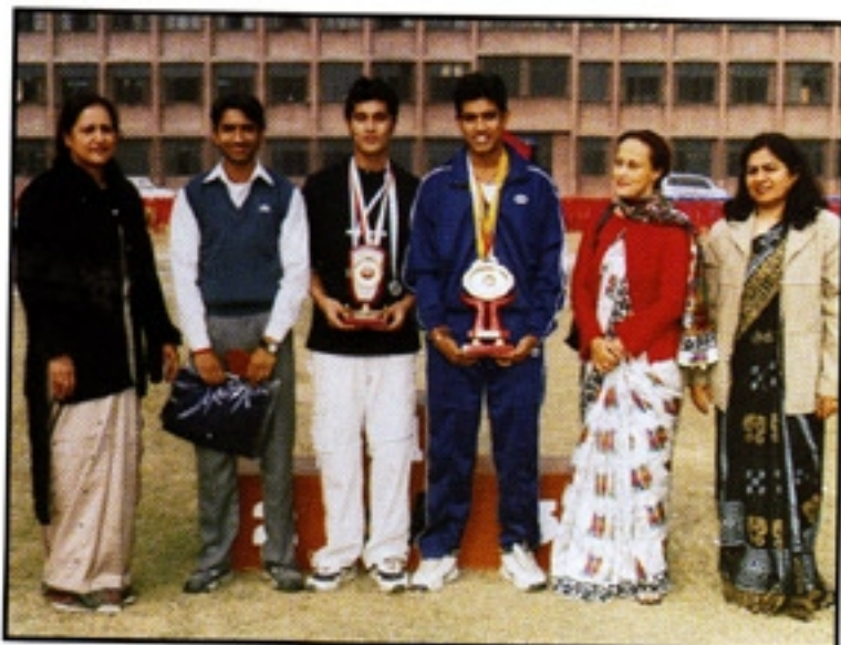
Stars of the sporting events