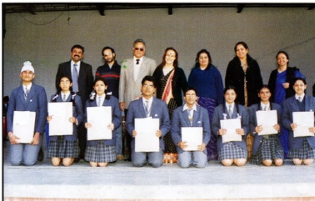
Proud winners of the creative writing competition