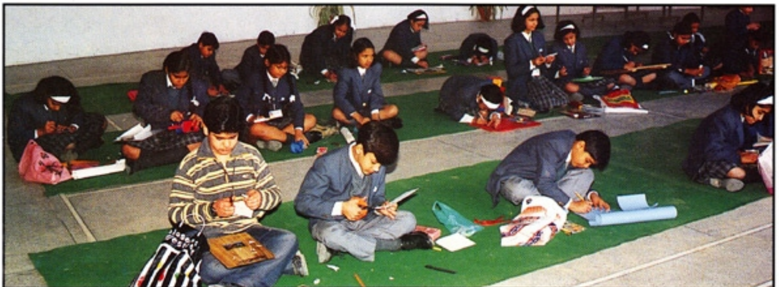
Making a mark with Book Marks!