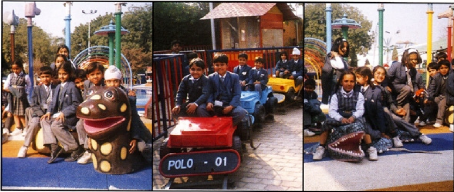
Happy picnickers at Fun 'N'Food

All the students from Class I to Class XII had fun and frolic during their Annual picnics at the Fun 'N' Food Village.