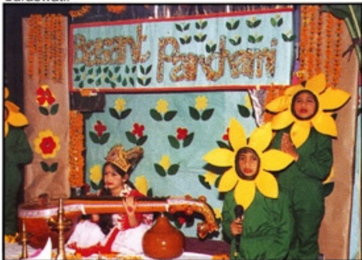
Invoking the blessing of the Goddess of Learning Saraswati

Basant celebrations in school started in a colourful and lively manner which befits the mood of the season. The students of class II presented a festival bonanza through which they depicted the celebration of Basant Panchami in the various states of India. The coming of spring brings in joy and merriment as it denotes the beginning of a new season. The programme concluded with the chanting of the shlokas by enthusiastic students who paid rich tributes and homage to the Goddess of Learning Saraswati.