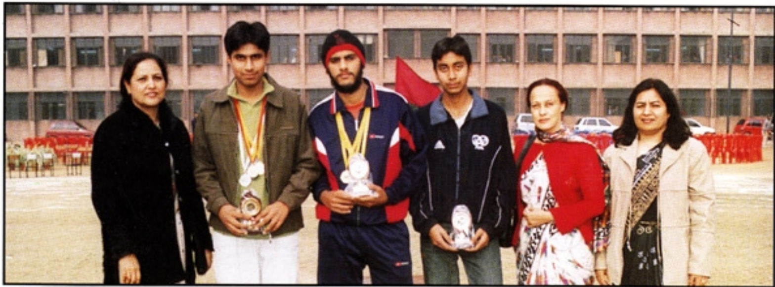
'They bend it like Beckham'. Our football champs!