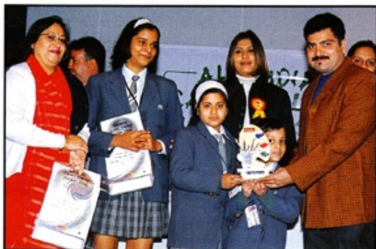
'On the footsteps of great masters' Our proud Camlin winners