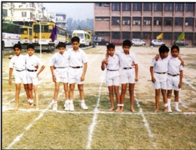
On your marks Get Set -----Go Three legged race