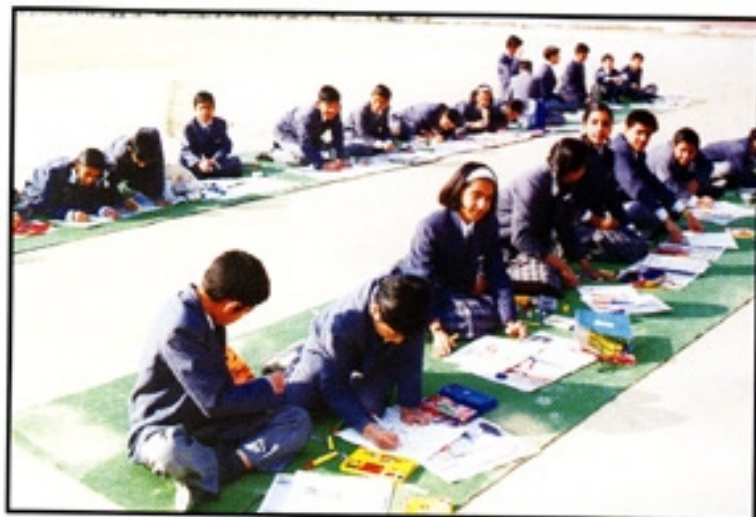
Creativity at large- 'Designing a book cover'

The students revealed their love for books through activities like 'Tell a Story', 'Read Aloud', Story Enactment', 'Literary Quiz', 'Book Review' and 'Know an Author'