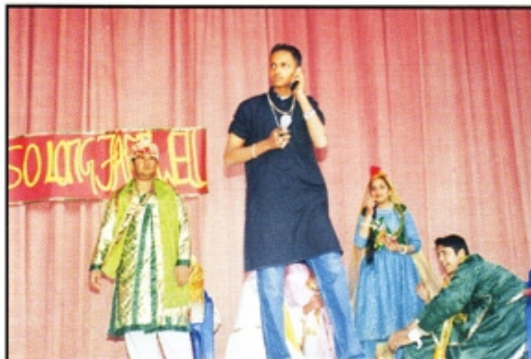
A candid moment. Mughal-e-Azam remix at the farewell gathering