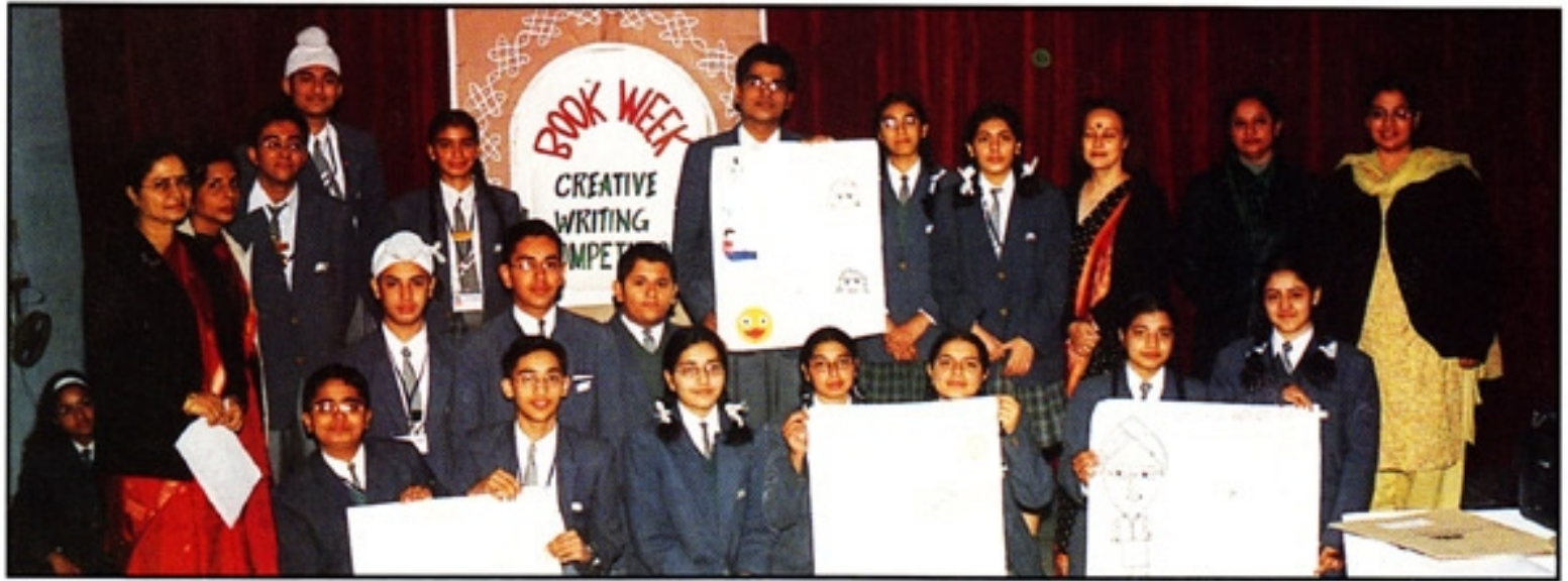
Creative young masters display their creativity