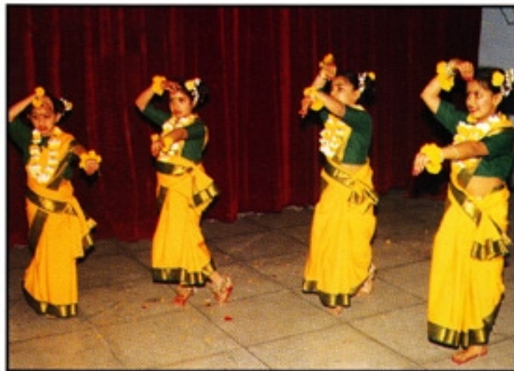
Welcoming Basant with grace and rhythm