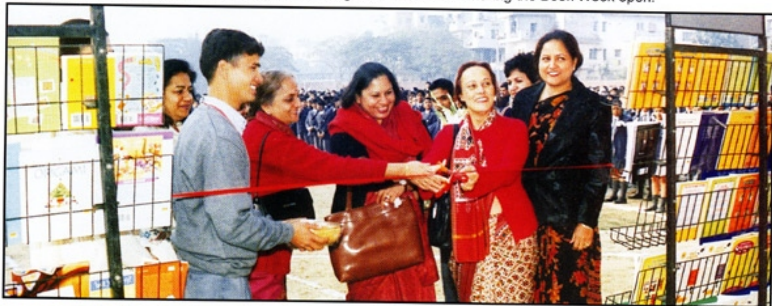
Cutting the ribbon at the 4th Annual Book Week