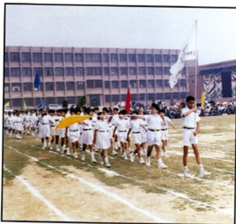
The smart marching contingents at the Junior Sports Meet