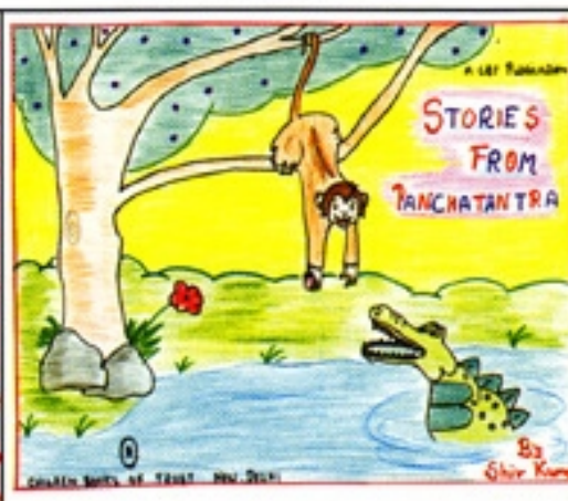
Shivani Arora VII