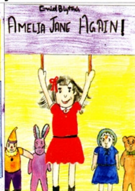
Prachi Grover (VII)