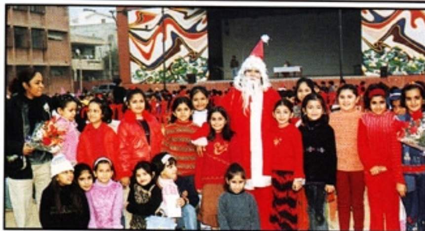
Christmas means gifts, eats and fun with Santa Claus

Our school sported a colourful look on 23 and 24 December. With a huge Christmas Tree and beautiful decorations at the school Reception. On this occasion the students of class V presented the nativity scene depicting the birth of Jesus Christ and represented the role of Joseph, Mary, King Herod and the three wise men to perfection. Christmas Carols were sung and Christmas Parties were organized for the primary section after school hours. The children had a very good time playing various games, followed by some music, masti and a lot of fun. Students were overjoyed to receive gifts from the Santa Claus.