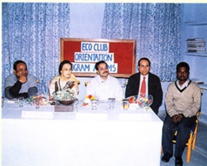
Our school was chosen as the lead school by the Dept. of Environment and was privileged to host the Eco Club Orientation Programme