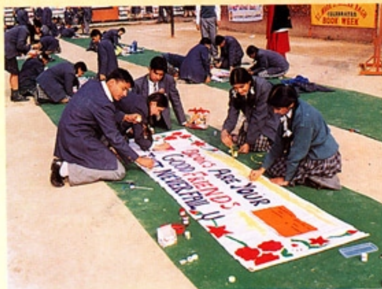
Banner making competition for class XI in progress.

The team work by the students for making banners has to be appreciated. Their creative outputs through effective colour schemes are commendable. Book covers and book marks are eyecatching.