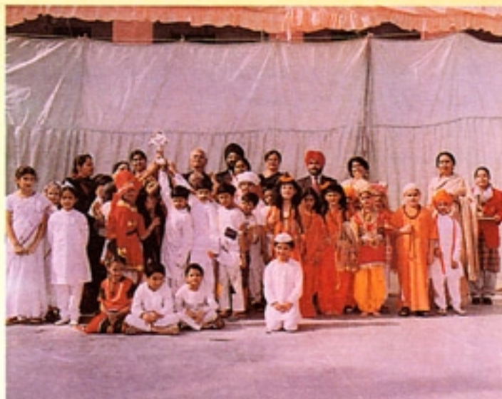
Jubilations among our tiny tots, who won the Inter School Ballet Trophy.

The tiny tots of classes I and II of our school took part in a Ballet competition organized by Jagat Convent Sr. Sec. School, Paschim Vihar, titled as Innocent Flutterings-2002 held on 22 Dec.'02. They won the trophy for the best performance. The theme for the ballet was 'My dream world' and the students of our school dreamt of a world where everyone will be literate, and pledged to make it their first priority, rightly justifying the title of their ballet 'Pehla Kaam'.