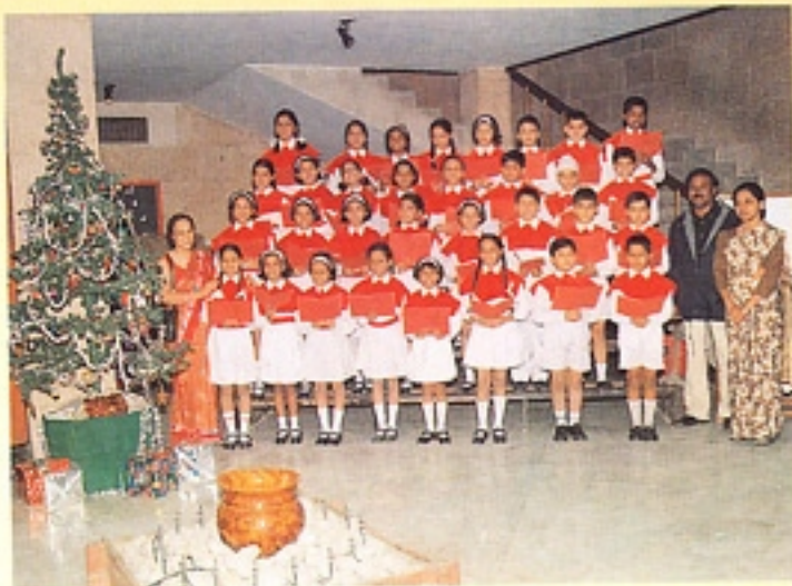
Our endearing CAROL SINGERS captivated us with their music.