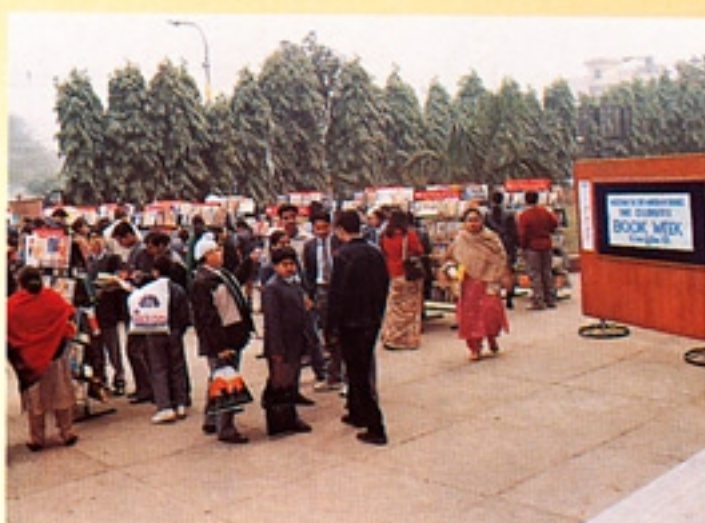
Avid readers browse through books during the Book Week Celebrations.