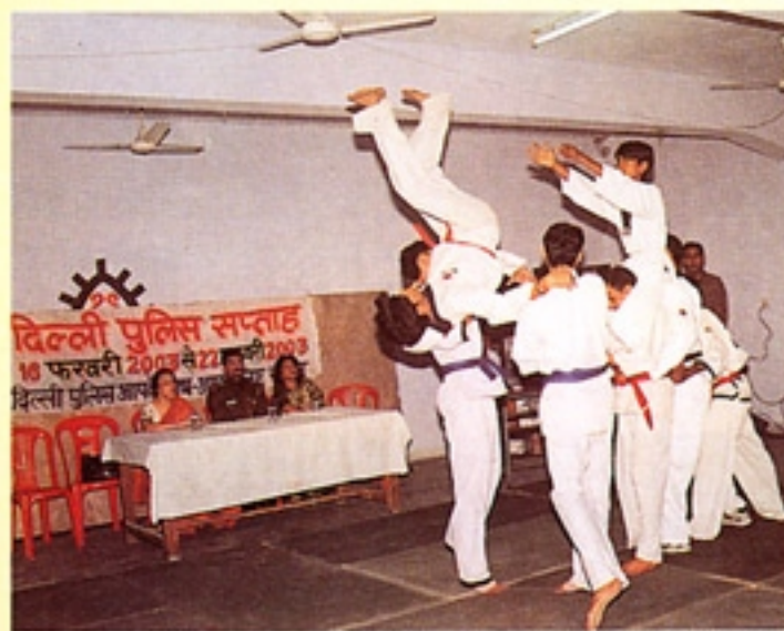
Taekwando style demonstration of self-defence.