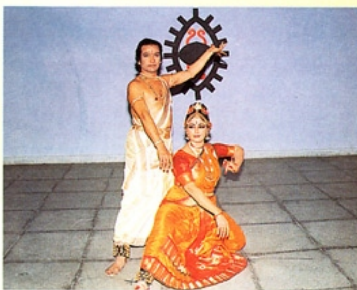
An awe inspiring performance by the artistes at the Kuchipudi Dance recital.