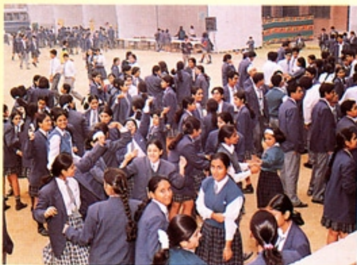
Fun filled-times at the Winter Carnival.