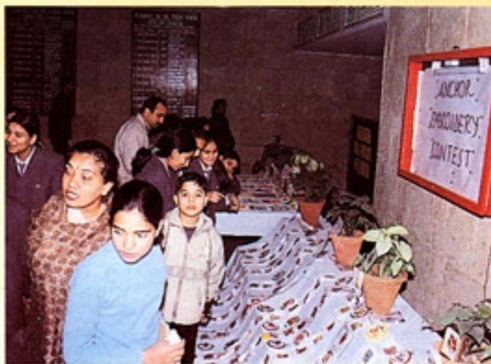
Weaving Magic with threads—visitors appreciate the students work at the Anchor Embroidery Contest.