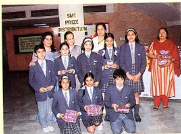
Winners of the Pidlite (1st Round) Art Competition.