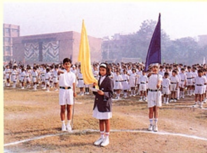
House Prefects of the Primary Wing being administered the Oath on Annual Sports Day.