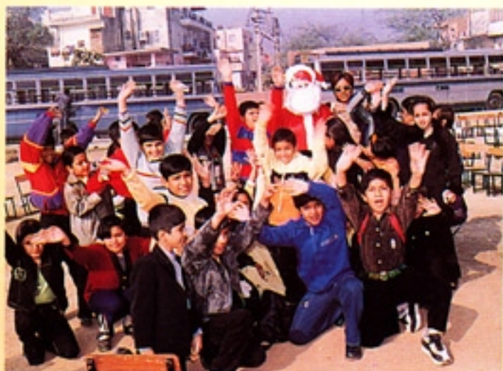
Its 'Santa Time' for our tiny tots at Christmas.