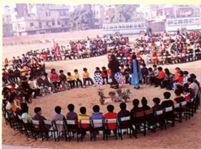
Students enjoy Games during the Christmas Party.