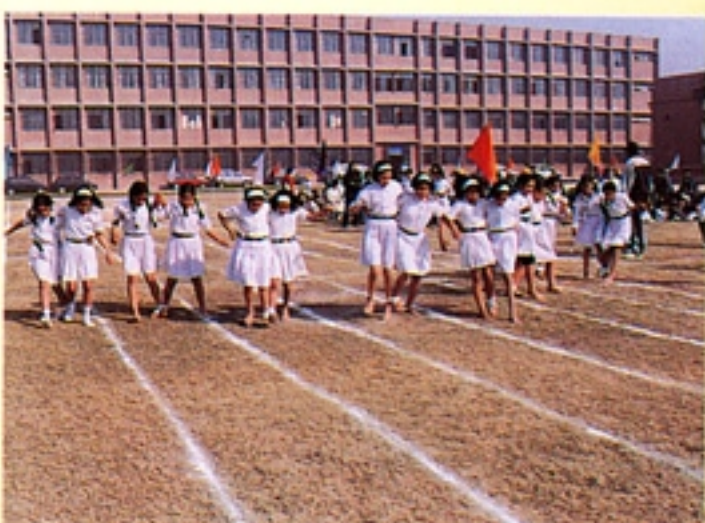
Three Legged Race—so girls, Rise and run, don't fall !