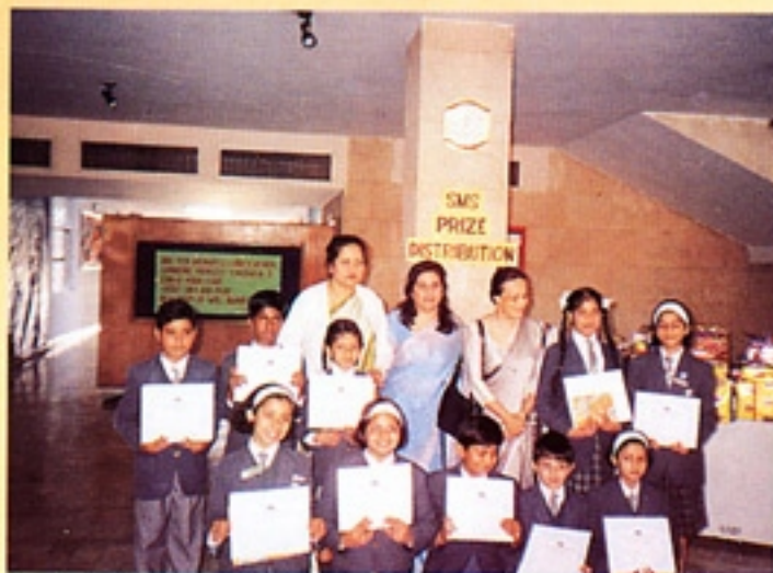
Winners of the Inter Class Paragraph Writing Competition.