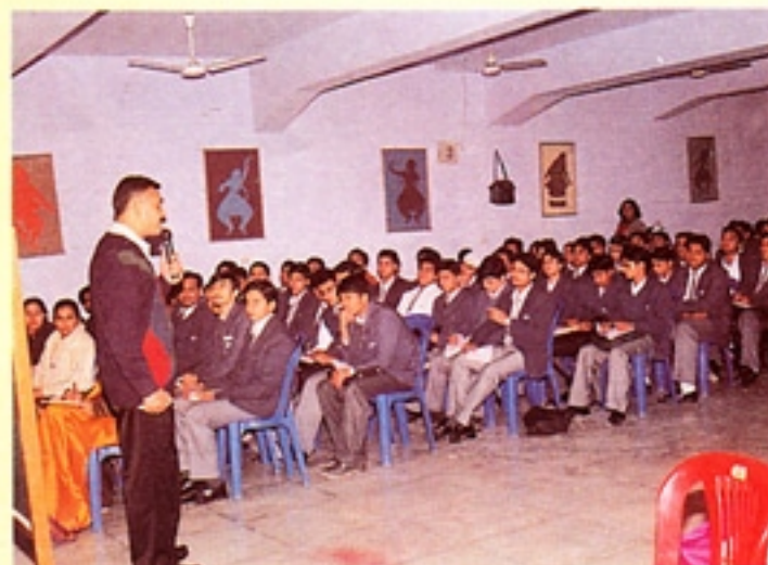
Seminar on Vedic Mathematics was conducted for students of class XII.