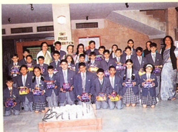
Congrats to the class toppers of PROCOM—G.K., Aptitude, Maths, Puzzles and Computers.