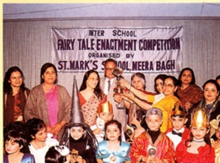
St. Mark's Prep. School Janakpuri-winners of the Inter School Fairy Tale Enactment Competition proudly display their trophy.