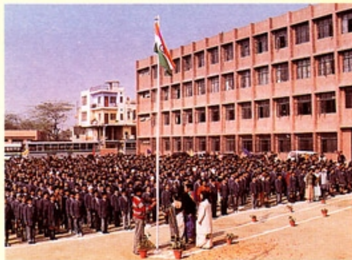
Tricolour being unfurled during Republic Day Celebrations.