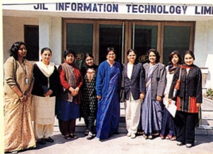
Our teachers on their visit to JIL IT in Sahibabad.