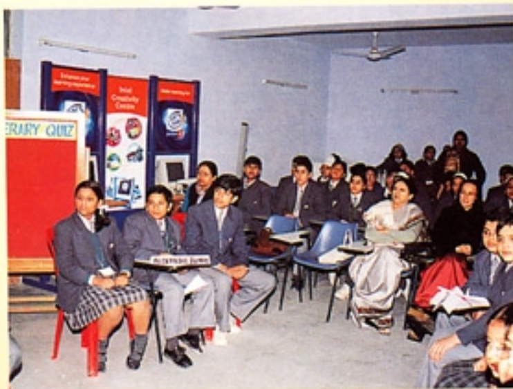
Students of VII and VIII being quizzed on Literary personalities.