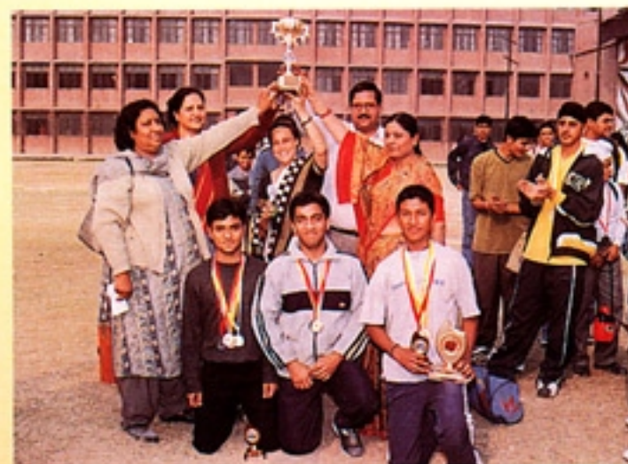
"The winner takes them all", cheer the students for Patel House who won the Overall Championship during Annual Sports Day.