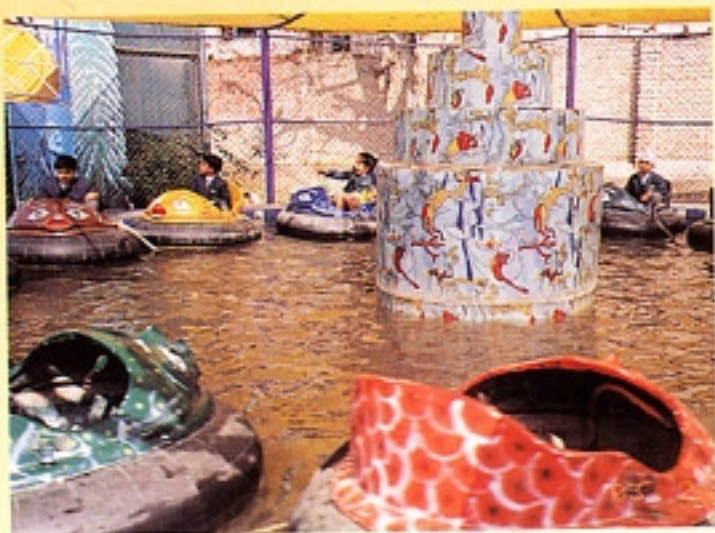
Children have a Fun-Day Out at 'Fun-N-Food Village'