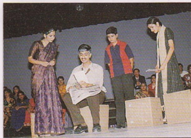
A scene from the English Skit 'Identity'.