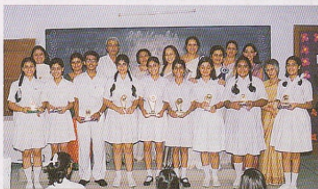
The prize winners of the poetry recitation competition held in our school - Class IX