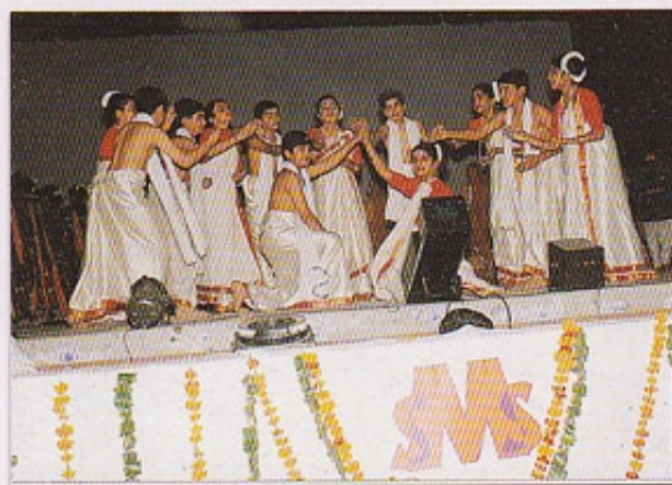
A close up of the Malayali folk dancers - Fusion folk lore.