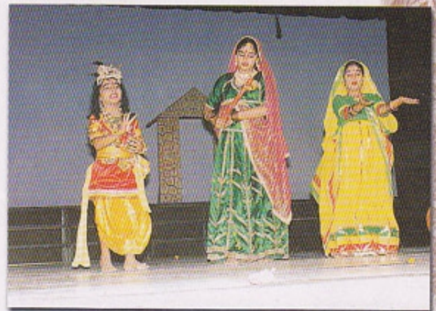
Krishna pacifying Yashoda.