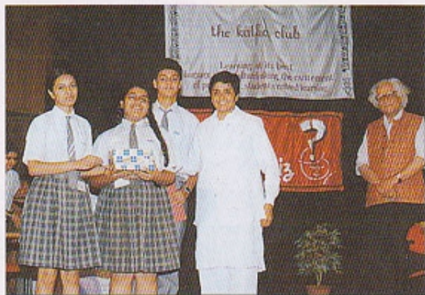
Our students being awarded by Ms. Kiran Bedi for their excellent performance in 'Chandalika'.

in the Katha Quiz based on Education, Excellence and Indian literature and were awarded special appreciation certificates for their noteworthy performance on 7 September, 2000.