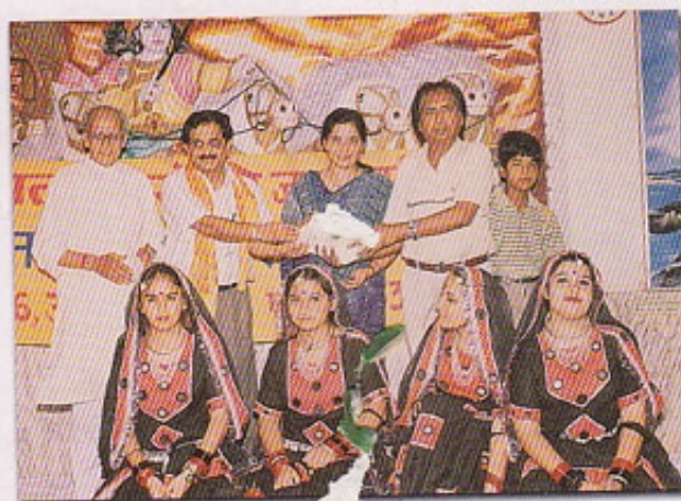
2 prize winners in 'Gita Ramayan' Competition held on 17 Sept. 2000.