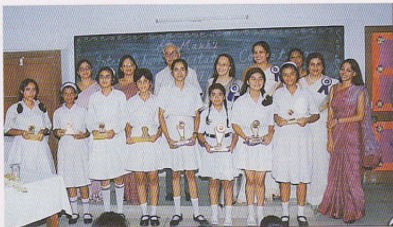
The prize winners of the poetry recitation competition held in our school - Class VIII

In English recitation, the maximum trophies were bagged by St. Mark's School, Meera Bagh, St. Mark's Girls School, St. Mark's School, Janak Puri, St. Francis De Sales School and Bal Bharti Public School, Pitampura.