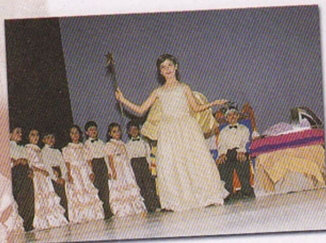
The fairy sings and blesses the princess.