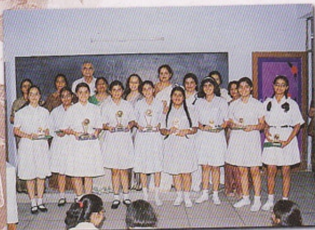
Students of Class X in the English Recitation Competition.