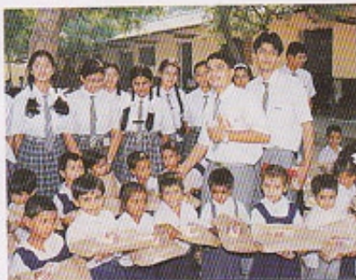
SMS Team with the Nursery students of MCD Girls Schools, Jwalapuri distributing uniform material.

Students of our school enthusiastically collected funds for 'Threads' - A project which is a brain child of all those who are concerned about the education of under privileged children, especially girls. This concern manifested itself in collection of funds, subsequent conversion of the funds to uniform material and prompt, personal distribution of the material among the needy students in the neighbourhood schools.