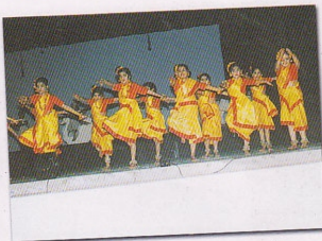
Saraswati Vandana by students of class V.