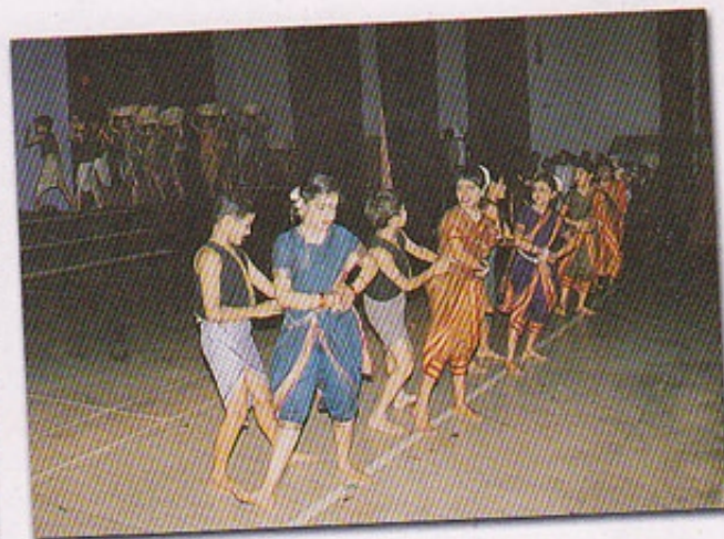
The Maharashtrian folk dancers in their joyous mood.