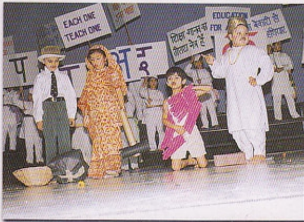
'Pehla Kaam' - a literacy campaign by the tiny tots.