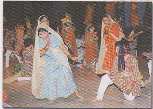
Gopis playing Holi - a scene from Lakh Roop Tere.