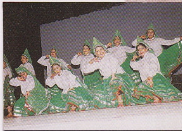
A Haryanvi dance performance by young students of class VIII.