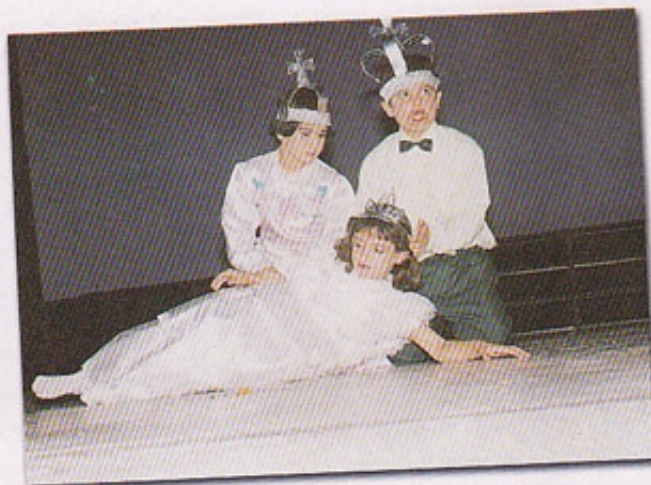
The magic spell has started working.