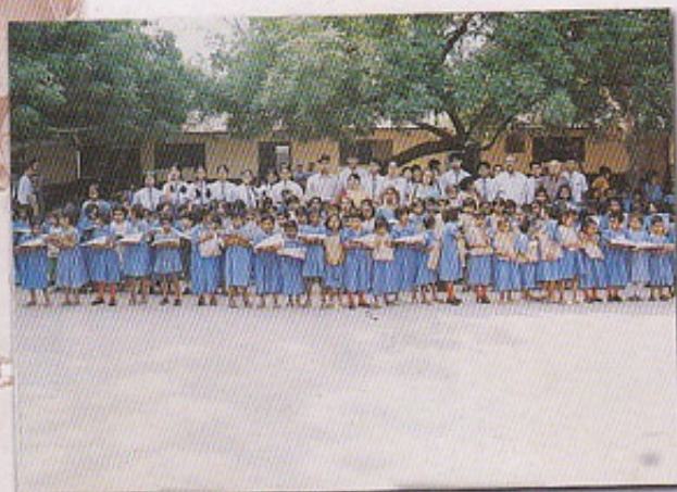
The tiny tots of MCD Girls School Jwalapuri after receiving the uniform material - Project Threads.