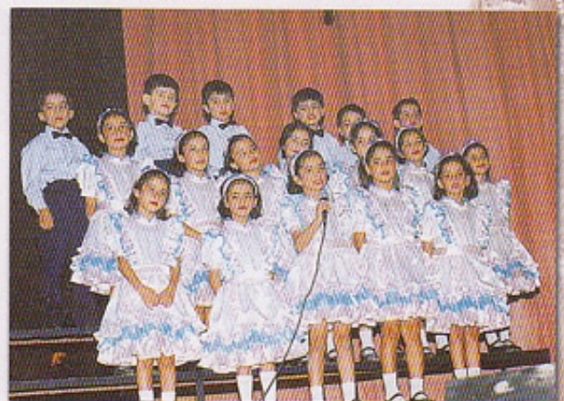
Que Sera Sera - the uncertainty of the future.