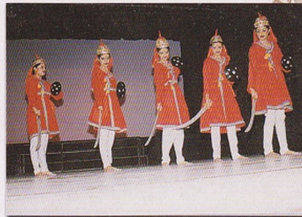
A scene from the beautiful choreography 'War and Peace'.