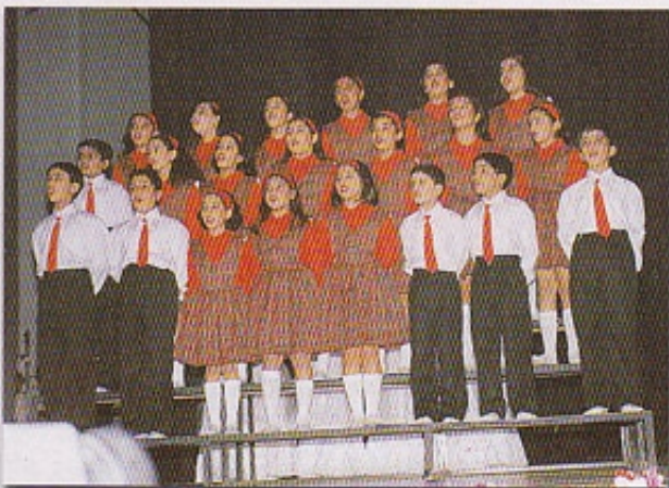
The Choir singing in their joyous mood.