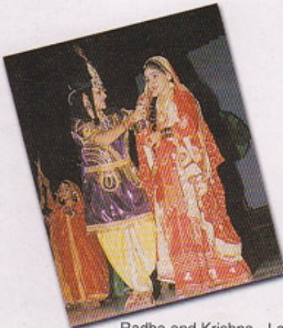
Radha and Krishna - Lakh Roop Tere.