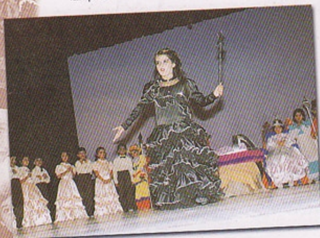
The wicked witch waving her Magic wand. A scene from 'The Sleeping Beauty'.