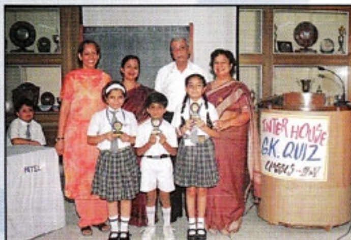
Winners of Inter house G.K. Quiz Competition