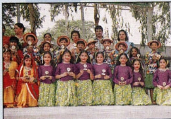
Members of Shastri house with their trophies.

In the junior category the joint winners were Patel House with their Dandiya dance who brought to life the colour and rhythm of Gujarat and Shastri House who enthralled with the movements from Daman and Diu.