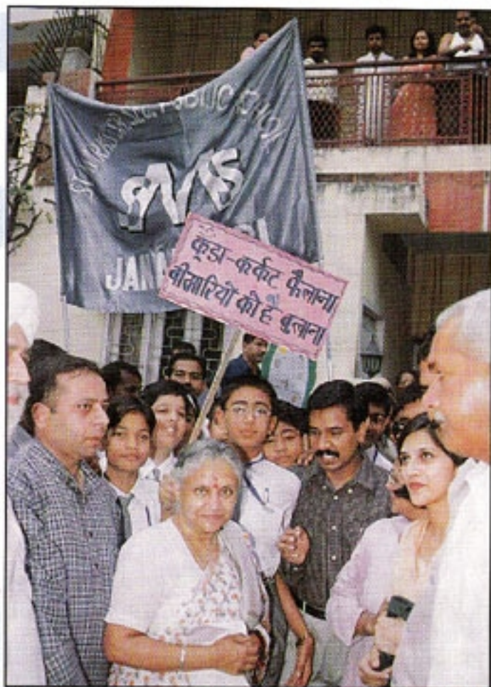
Members of 'Cleanliness Drive' with the chief minister of Delhi, Mrs. Sheila Dikshit.

Creative writing competition was organized by Scholastic Book Reading Club from 1-14 February for classes 6 th to 8 th . Certificates were given to the students who excelled in creative writing.