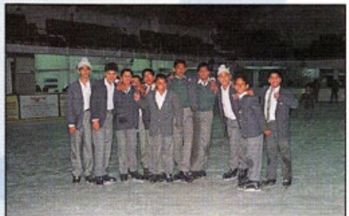
Students enjoying ice skating 'Fun 'n' Food'