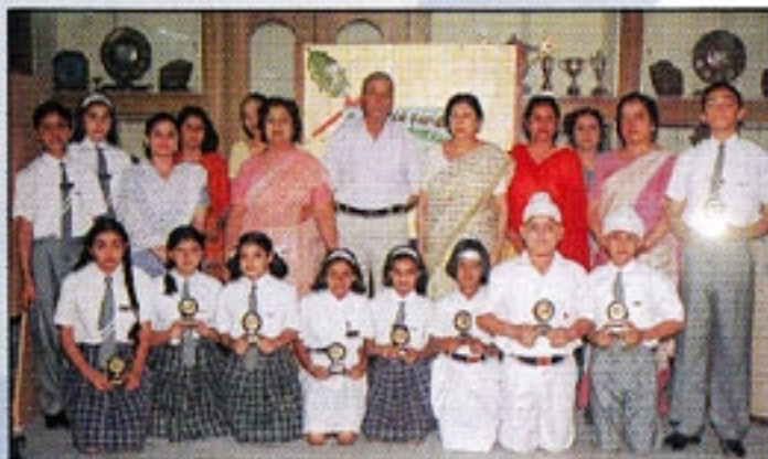
Winners of English Recitation

INTER CLASS ENGLISH RECITATION for classes VI VII and VIII was held on May 6, 2004 in the school's conference hall. Students were exposed to nuances of poetry, expressions, intonation.