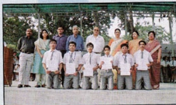
Young scientists with their prized certificates.

INTER SCHOOL science state level exhibition was held at Salvan Public School from 5th to 8th October 2004 in which three of our models were exhibited. The model selected from middle section was "KIDNEY TRANSPLANT" prepared by :