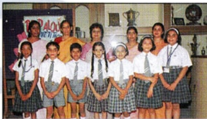
Winners of Read Aloud competition

ON account of 150th Anniversary of Swami Vivekanand, a recitation competition in English, Hindi and Sanskrit was held on 6th & 7th of Nov. 04 by Ramakrishna Mission Schools from all over Delhi participated in the Competition. The following students stood as the winners :