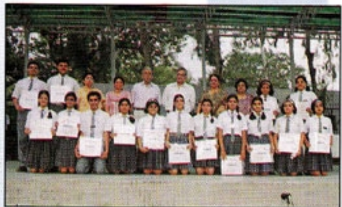
Young achievers : students who scored 95% and above in sanskrit with their certificates.