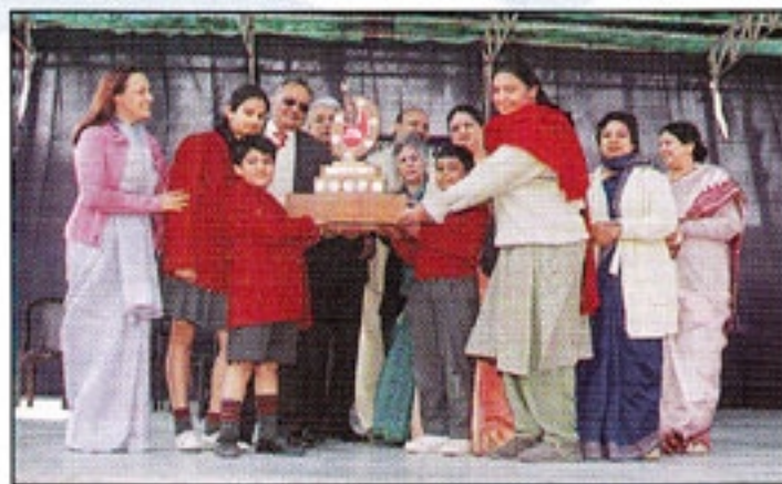
Students and teacher incharge of Spring dales School receiving the prized trophy from the chairman.