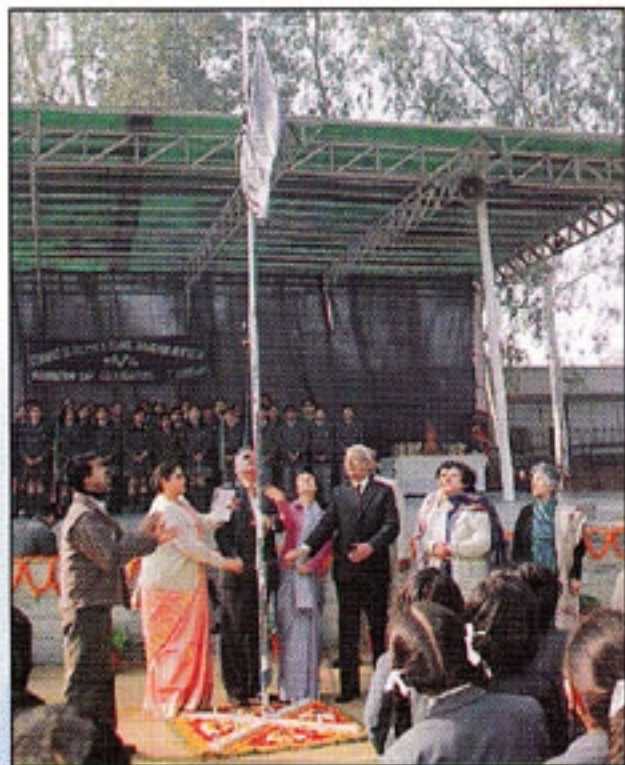
School Flag being hoisted on the occasion of foundation day celebrations

The school assembly was addressed by the chairman and he wished the school many more glorious years. On the same day the prize distribution ceremony of