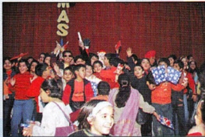
It is Christmas time! let's enjoy

Students of classes 1st to 5th celebrated Christmas with great enthusiasm and excitement on 23rd and 24th December 2004. It was party time for them as they enjoyed singing carols, playing games and winning lots of prizes. There was a spirit of joy and fun all around. The most exhilarating moment for the children was when Santa Claus distributed gifts to them.