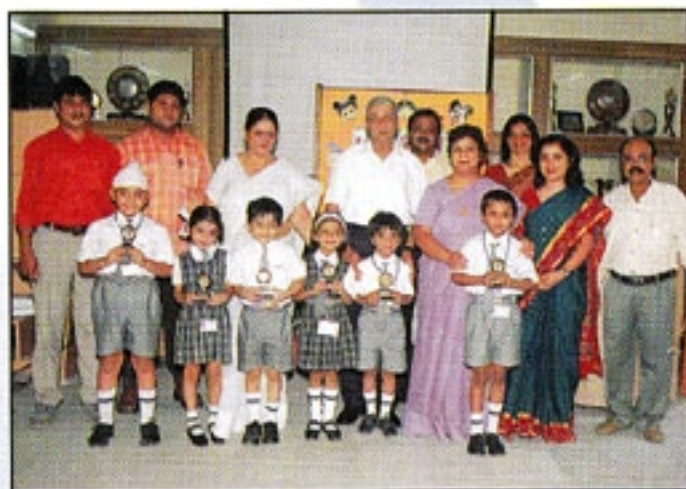
Prize winners of Solo singing competitions.