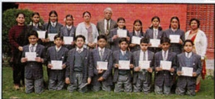
Prize winners of creative writing