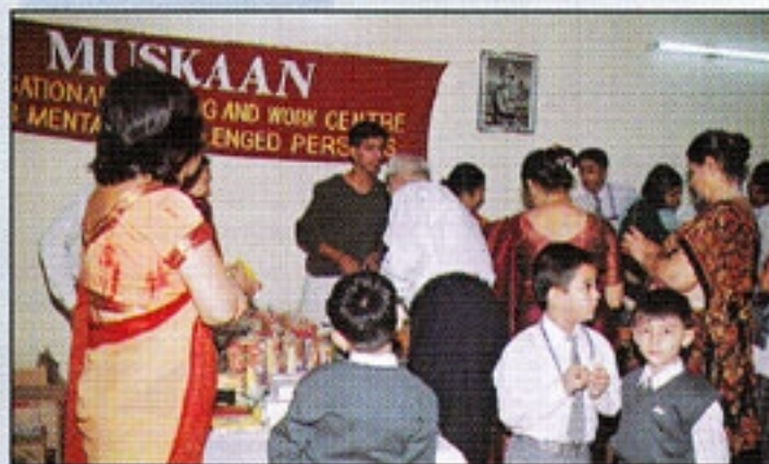
Purchases being made from the stalls put up by Muskaan.

All the staff members contributed a day's salary for the Tsunami victims. A sum of Rs. 56,800/- by the school staff and Rs. 21,000/- from the school management was donated to the CM. Relief fund for the noble cause.