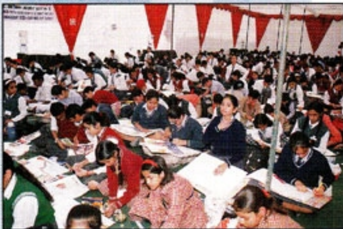
Students – Their imagination, brush & Canvas