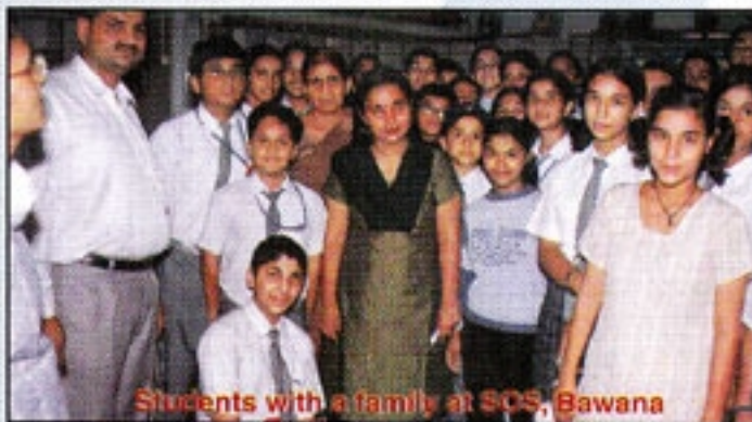
Students with a family at SOS, Bawana