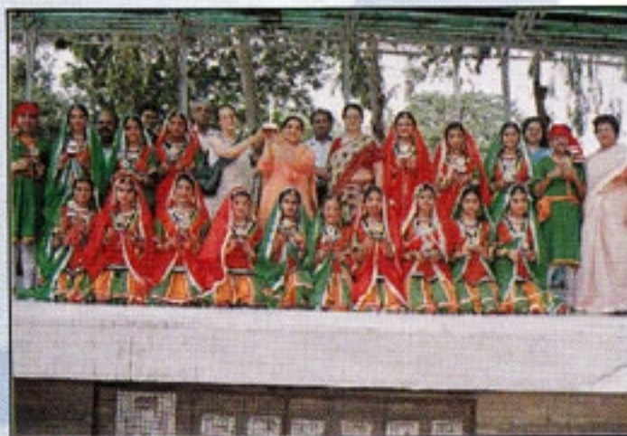
Proud winners of Patel House.