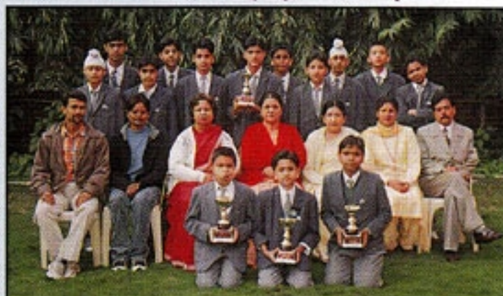
Sub Junior & Junior athletes who bagged championship trophy at Zonal Level

Championship bagged by Sub Junior Boys and Runners up by Junior Boys