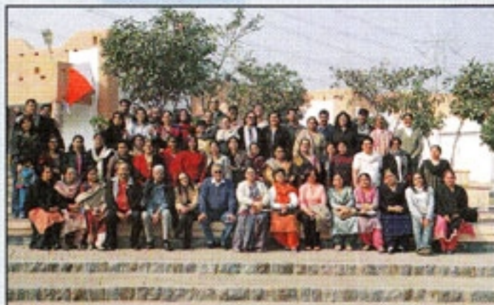
This one is for album, Teachers on Staff picnic

With the arrival of the spring, picnics were arranged in the school. The students of various classes were taken to Fun 'n' Food & they thoroughly enjoyed themselves. The most eagerly awaited staff picnic was arranged where the staff unleashed their free spirit by participating in various activities.