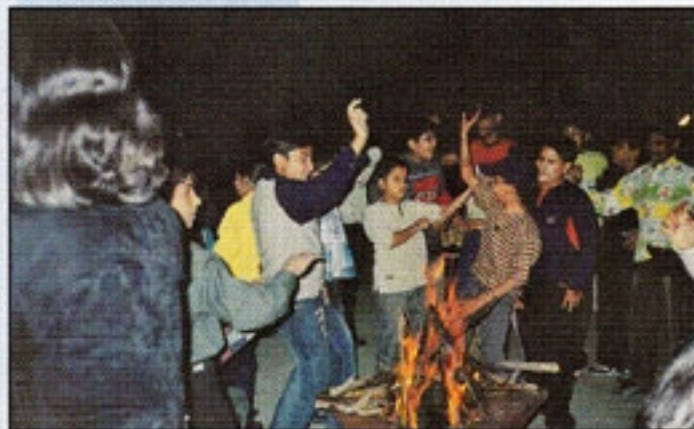
Its time to sing 'n' dance- students enjoying bon fire.

The students were overjoyed to see the beautiful marble carvings of the ancient Dilwara temples and climbed 300 stairs to Guru Shikhar, the top most point of Mt. Abu. They also visited the famous Nakki Lake and trekked up to the Toad rock. The students purchased gift items and souvenirs. A visit to the Brahmakumari Ashram and Museum quenched the spiritual thirst. The unforgettable sunset, good food, bonfire, music and dance remained etched in