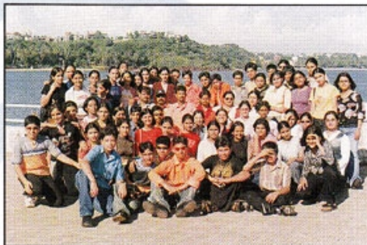
Holidaying in Goa—land of Sun & Sand.

The educational trip to Goa in the month of September was the holiday of a lifetime for classes IX & X. The memory of lush green hills, valleys and a wide choice of beautiful beaches and the boat cruise on river Mandavi is still green in the memory of the students. They were impressed by the Cathedrals and churches, including the famous Bon Jesus Church. Goa is a remarkable mixture of Indo-Portuguese culture. The Mangesh temple is also a great attraction for the visitors.