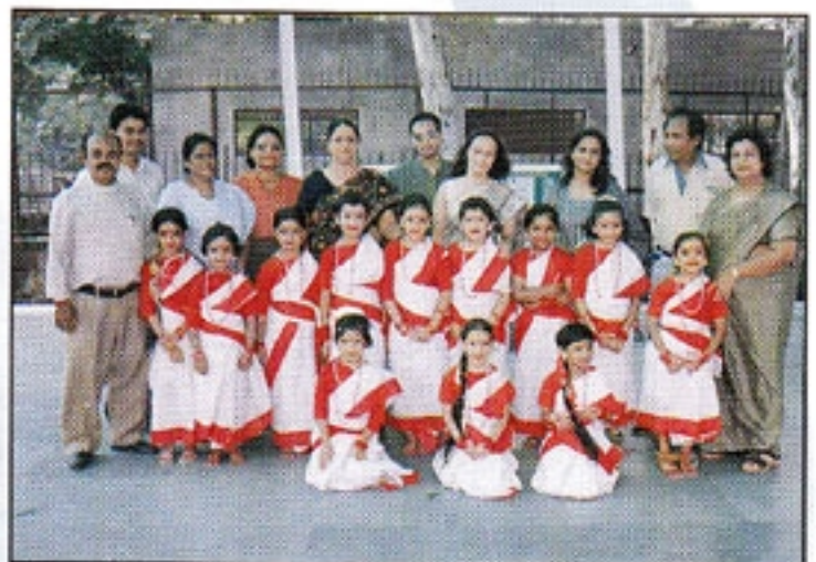
Members of Shastri House (Class I & II), Winners of Inter House Dance Competition.

VASUDHA – the Eco Club of our school received an appreciation letter from the residents welfare association C Block Janakpuri appreciating the efforts of the club by taking up cleanliness drives on & off, in the district park Janakpuri and spreading the message of 'Say No To Plastic'. The club has been invited to care for the park in their block with promise to share the responsibility of parks maintenance by the local residents.