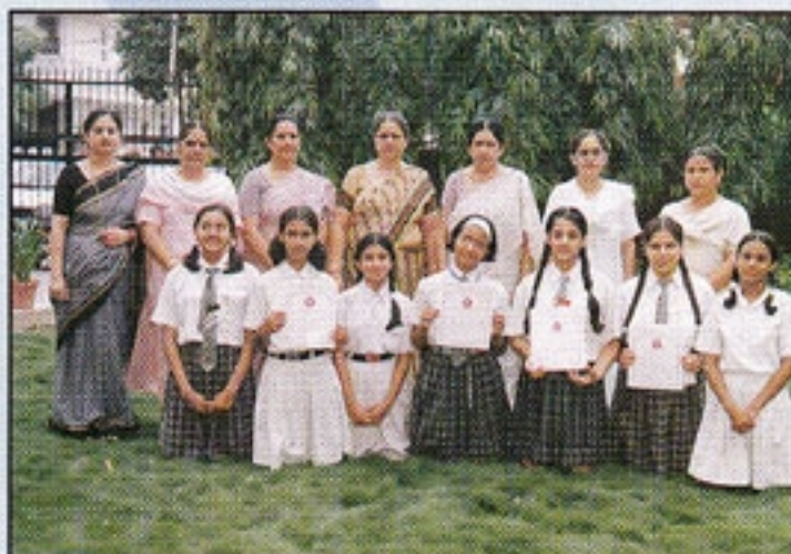
Winners of Debate Competition (Juniors & Seniors) at Zonal Level.