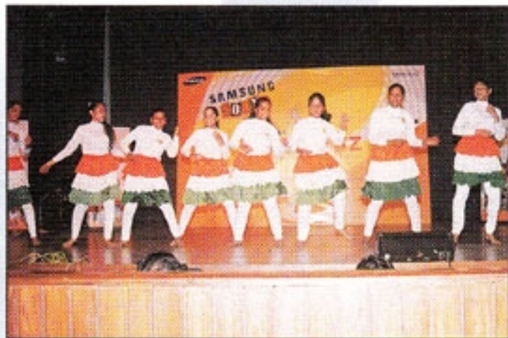
Students exhibiting their talent in choreography.

Students showed their excellence in Extempore, Jam Session, Debate, Web Designing and exhibited their talent in choreography and fashion show. In all these events, our students qualified for the finals.