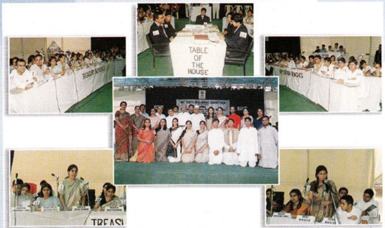
Scenes from Youth Parliament.