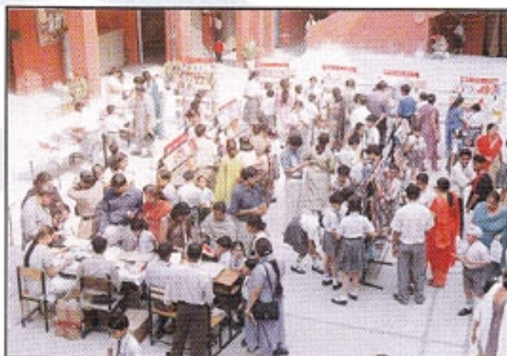
Pen is still mightier, strong crowd that scholastic week attracted proves the fact.