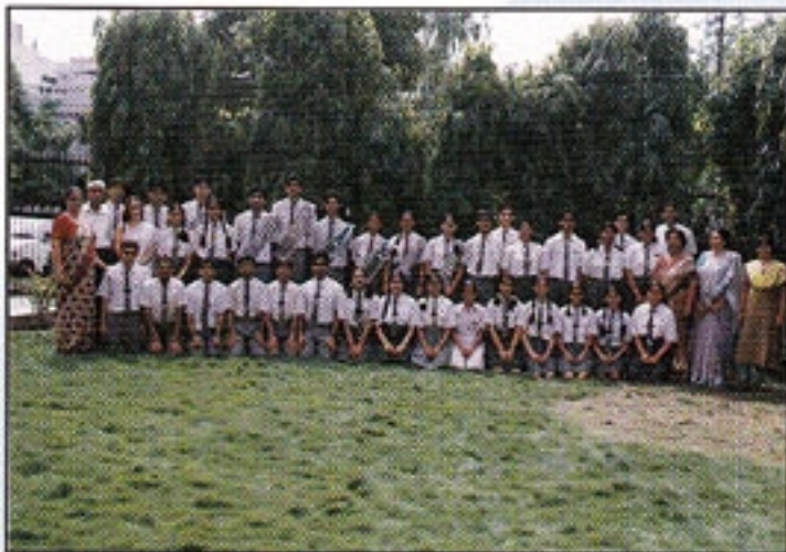
Ready to take on the responsibilities, newly inducted office bearers alongwith members of the management, teacher incharge and their seniors.