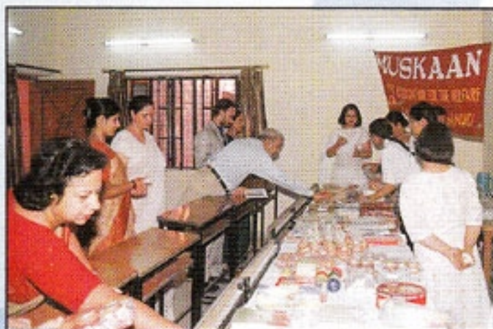
All for a noble cause.