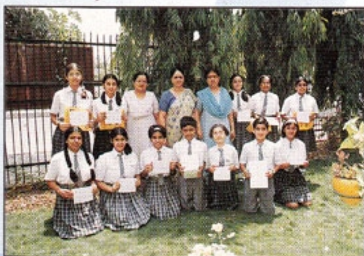
Participants and Winners alongwith Principal and teachers incharge, of Painting Competition held in Salwan Public School.