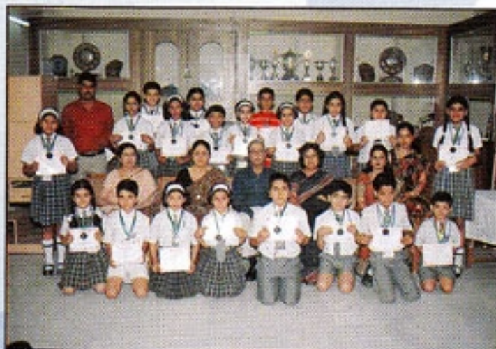
Winners of Anamika Painting and Essay Competition Year-2003.