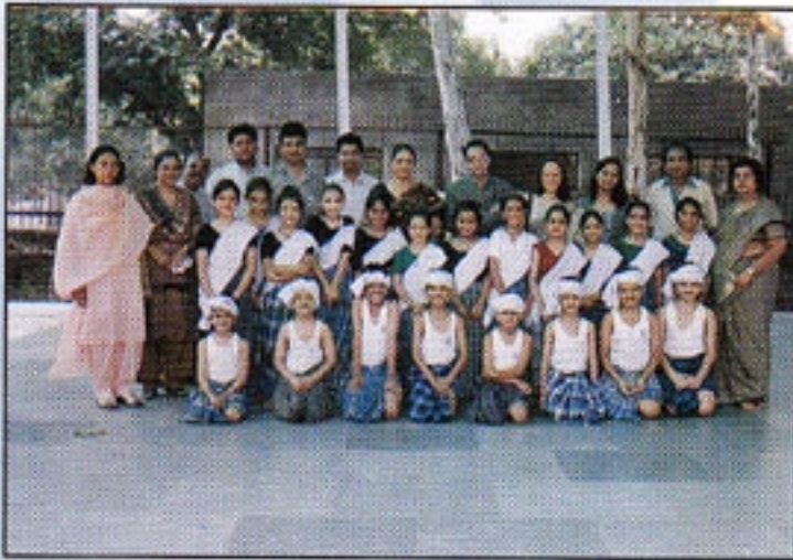
Patel House members who bagged the Best Dance Trophy in the second category (Class III & IV).