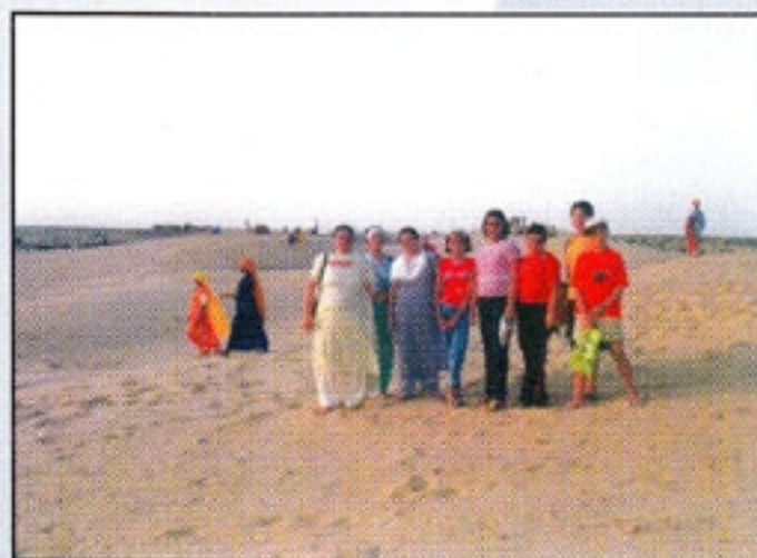
Walking over the sand dunes; students enjoying scenic beauty of Jaisalmer.