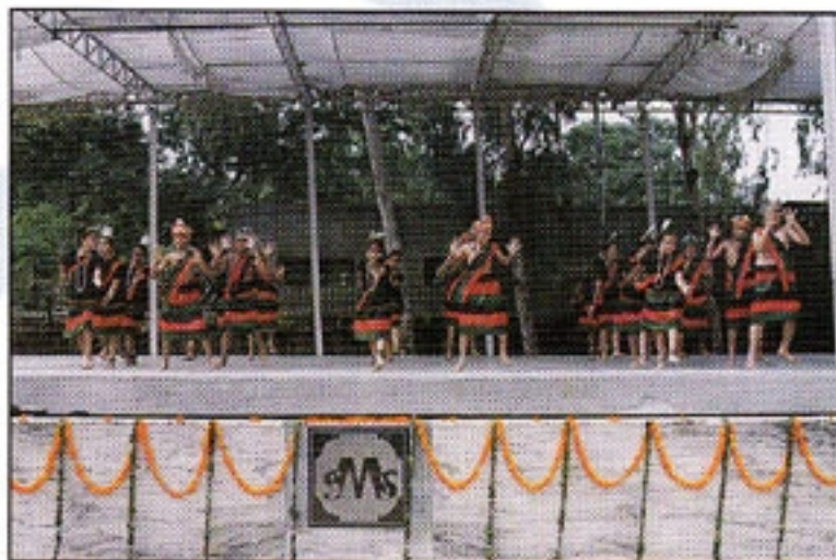
Winners of Inter House Folk dance (Sr.) Competition performing.

In Seniors — Gandhi House won the First Prize. Their dance was on the song – 'Gun Gun Tujhe Dil Pukare'. The programme was enjoyed by one & all.