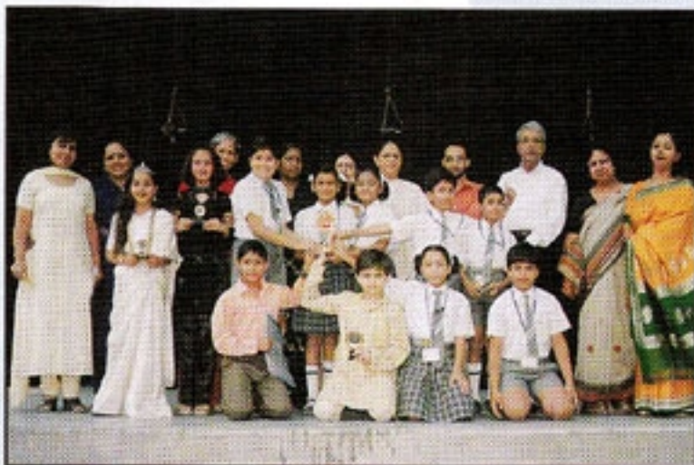
Winners of Drama Competition.