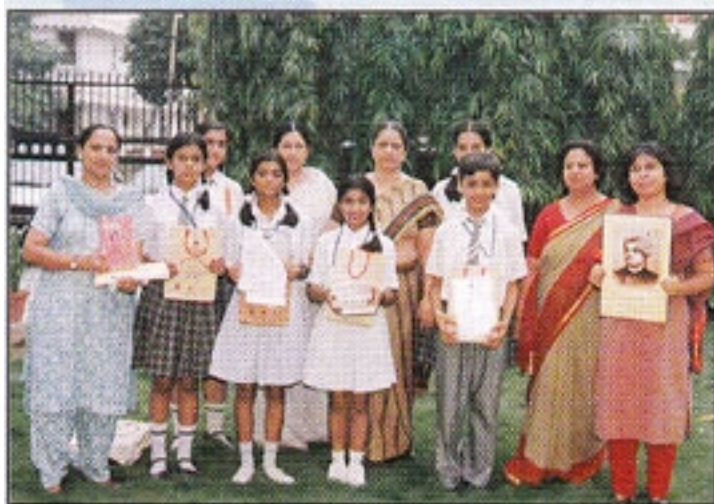
Participants of Value Education Programme organized by R.K. Mission under IQF.