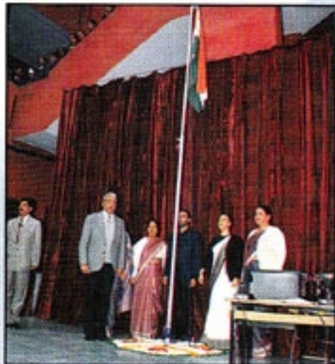
Singing National Anthem in unison on the occasion of Republic Day Celebration

26th Jan, Republic Day was celebrated with great Zeal and enthusiasm. Students presented wonderful cultural items to mark the occasion.