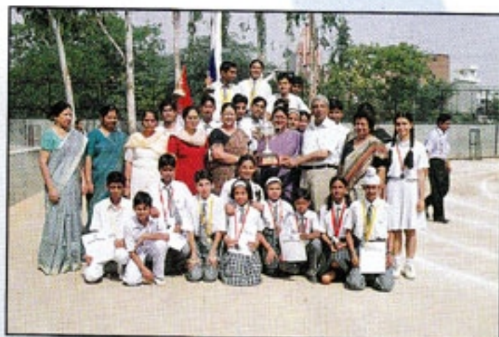
Members of Nehru House with their Shield