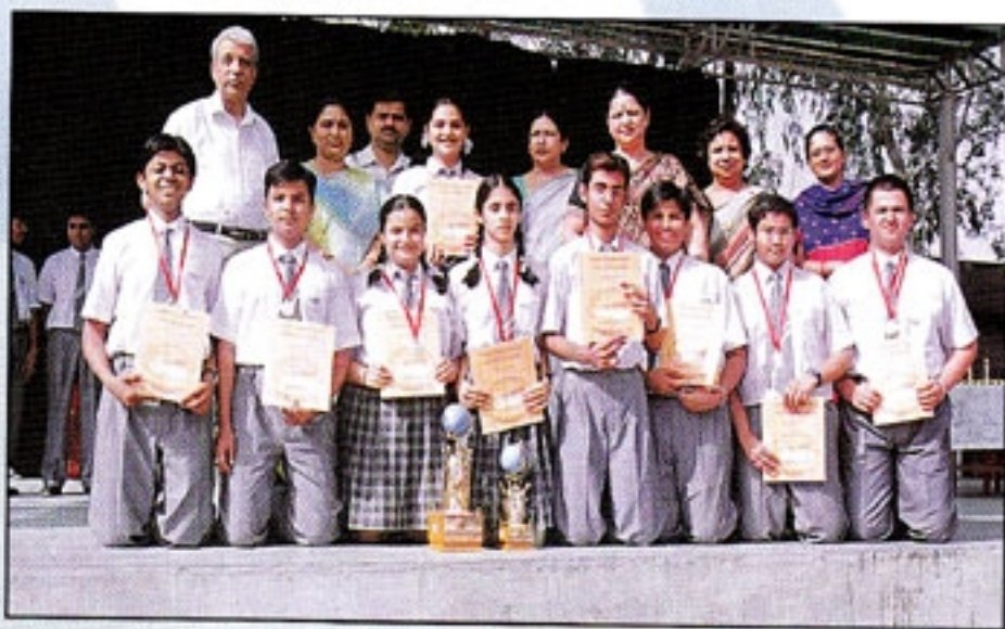
Back home with Prizes : Students who represented school in Geo Fest

A group of students along with two teachers went to Lucknow from 12th to 16th April, 2004. Our students participated in various competitions, such as Geo- Creation Voice & Vision, through the lens eye, Geo-Quiz. Students had a chance to interact with students from other countries. Our students got first prize in Geo creation and consolation prize in voice and vision. Theme of Geo-creation was India in making, voice and vision, the various Physical divisions, and the Eternal Ganga. The quest for knowledge in Geography as a discipline was satisfactory for students.