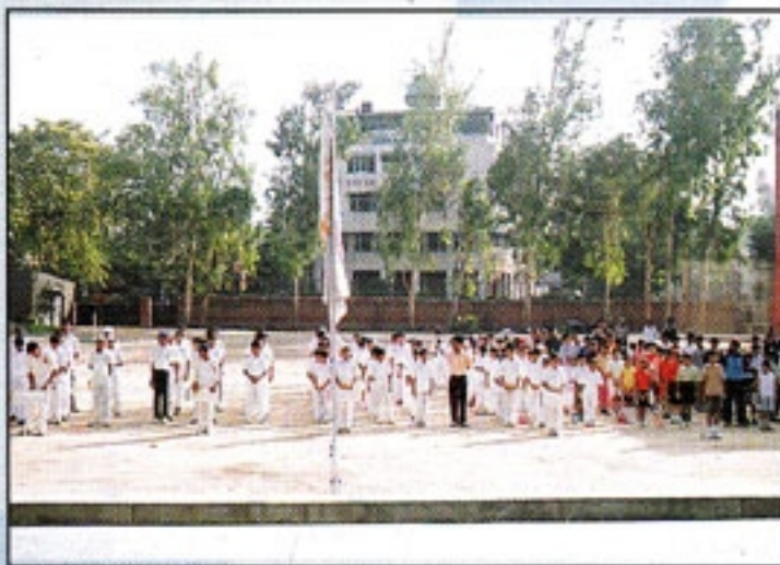
Ready for the day : Students listening to instructions.