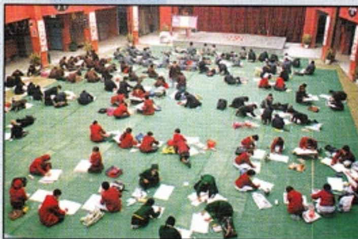
Students from various schools busy sketching and painting.