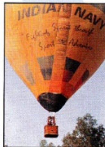
Let's have a bird's view : Students enjoying the hot air balloon ride

Students of St. Mark's Sr. Sec. Public School, Janakpuri from classes V to XI enjoyed the Hot Air Balloon Ride in the school premises on 26th February, 2004. It was both a learning & exciting experience for the students to watch the process of assembling the whole unit & making it floatable with use of gas flame. Riding in it in the air was an experience which the students said was unique & thrilling one.