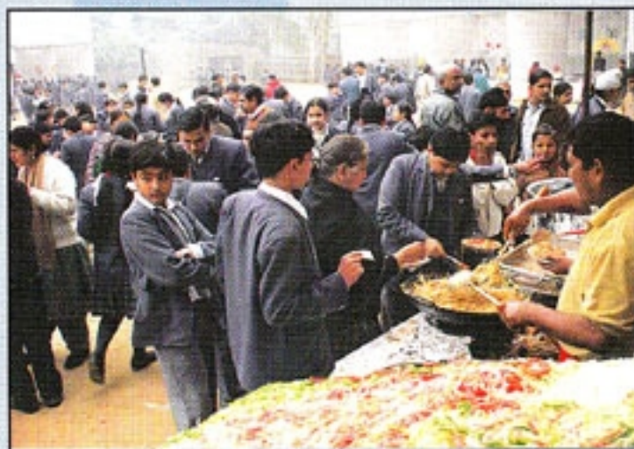
Hot 'n' spicy ! Senior Students Sampling the Food.