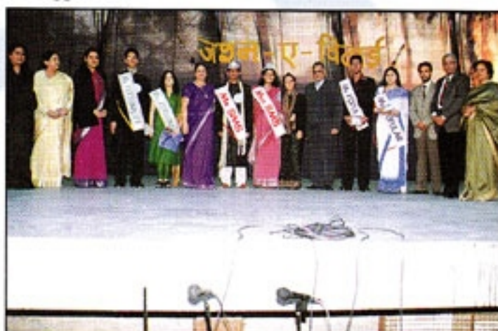
Proud winners of coveted titles