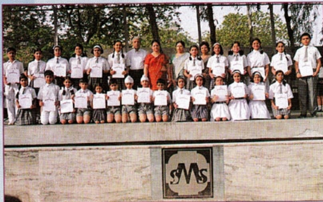
Rankholders (CL. I-XI) with their certificates