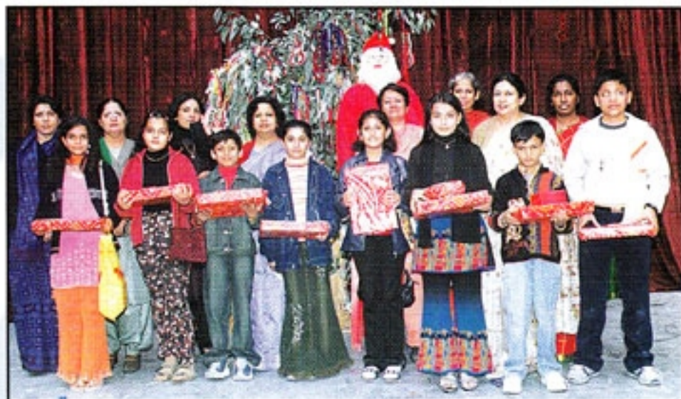
Merry Christmas : Juniors with their prizes.

Christmas was celebrated with great enthusiasm and excitement by classes I - IV. It was time to party and play fun games and win loads of prizes for the juniors. They had a date with Santa Clause who promised to fulfill all their wishes. Little ones had gala time.