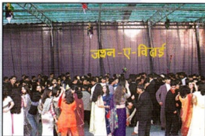
Having a blast : Students of CL - XII enjoying themselves