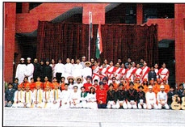
Participants of the much appreciated item : Bharat Jag Utha

Students of St. Mark's Sr. Sec. Public School, Janakpuri from classes V to XI enjoyed the Hot Air Balloon Ride in the school premises on 26th February, 2004. It was both a learning & exciting experience for the students to watch the process of assembling the whole unit & making it floatable with use of gas flame. Riding in it in the air was an experience which the students said was unique & thrilling one.