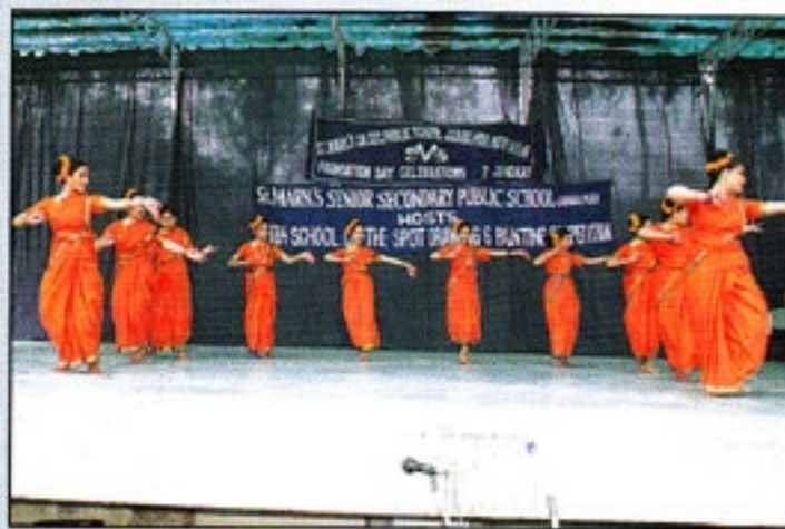
Students presenting a dance on the Foundation Day