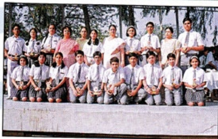
Winners of CL X