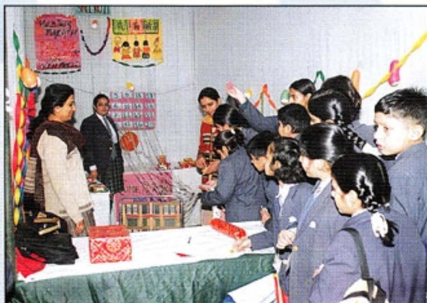
Pull the thread and win a prize ! Juniors enjoying the game

Later in the day mega prizes worth thousands of rupees were announced, through lottery system, for each class. Lucky ones took silver bowls, diamond ring, English Speaking Course and many more.