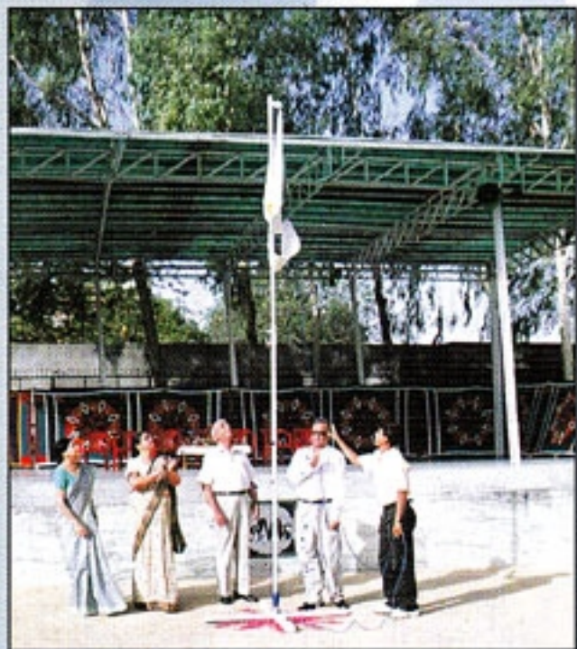
Summer Camp Commences

A large number of students were trained by recognised and renowned coaches for one month in Cricket, Basket Ball, Badminton, Music & Dance.