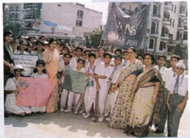
Eco Club members on cleanliness drive.

"VASUDHA", our Eco Club has taken upon itself to make people environmentally aware ecofriendly. They take up other projects also like tree plantation, air and water monitoring, paper recycling and encouraging eco-friendly ways of celebrating festivals like Holi and Diwali. In future too, we plan & hope to help make our environment ecologically stable and more conducive to healthy living.