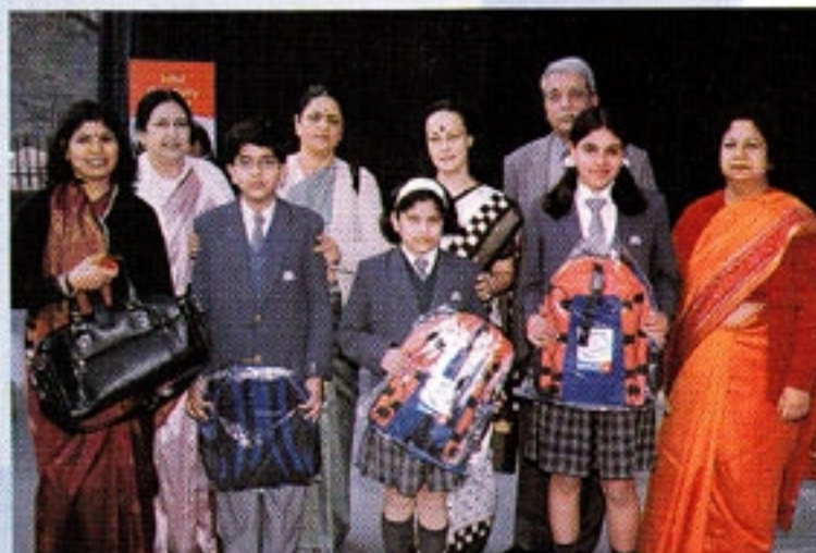
Members of INTEL PROGRAM with their prizes.