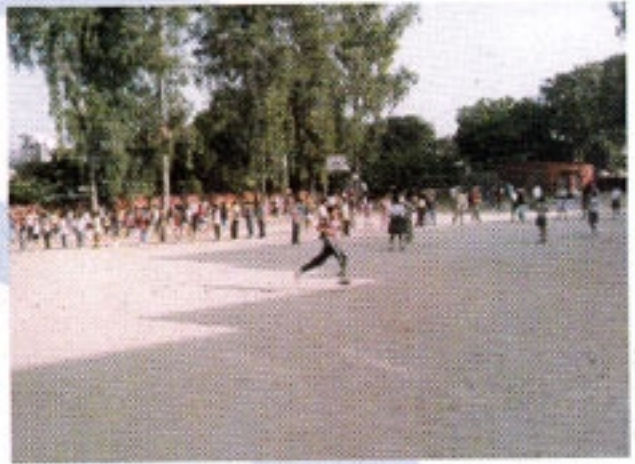
Students enjoying the special summer camp organised for them.