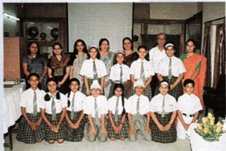
Winners of English Extempore.