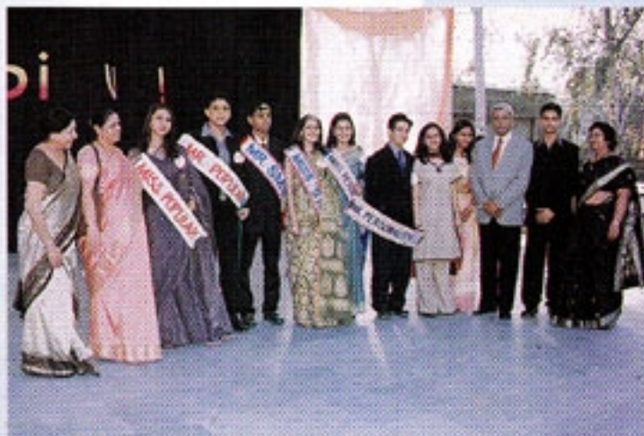
Proud winners of Mr. & Ms. SMS Contest.