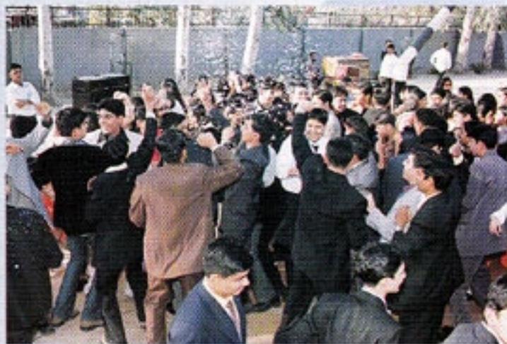
Students having a blast at farewell party.