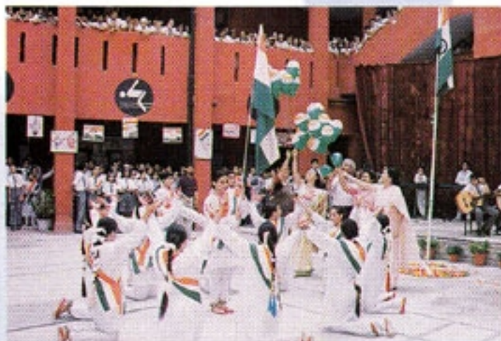
Independence Day Celebrations coming to grand finale.

The students were addressed by the Manager & the Principal of the School, reminding them of their duties & responsibilities as citizens of a free Nation.