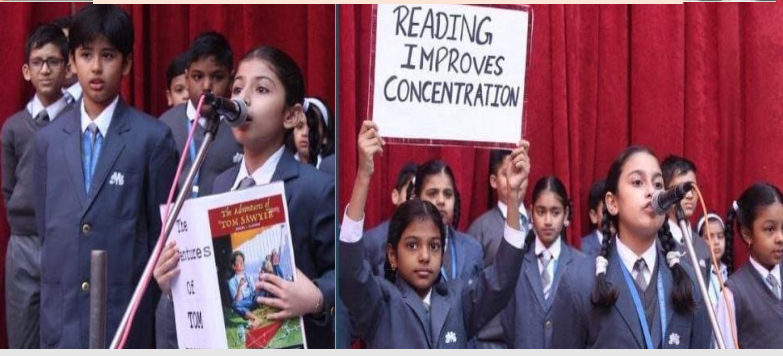
Power of Reading (IV A)