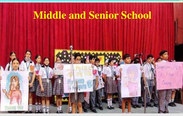
International Day of Sign Languages