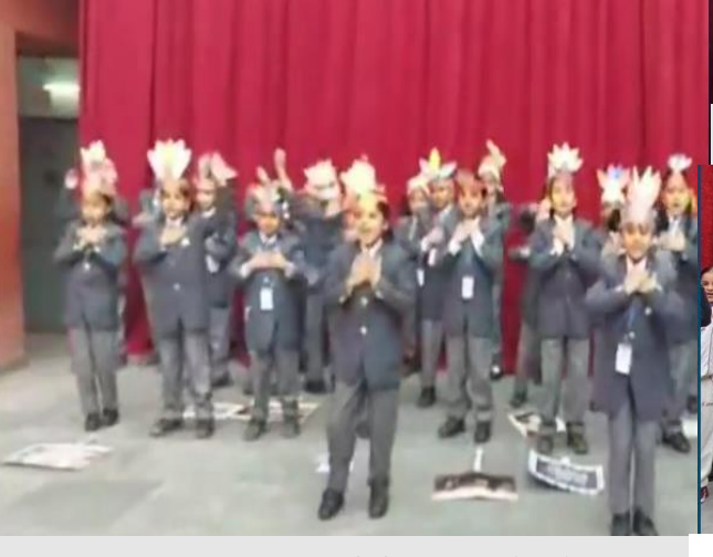
Thanksgiving Day (I D)