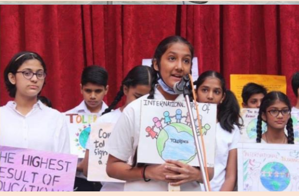
The International Day for Tolerance (VIII F)