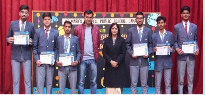
Third Position: Boys Senior Team (U-19)