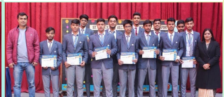
First Position: Boys Junior Team (U-17)