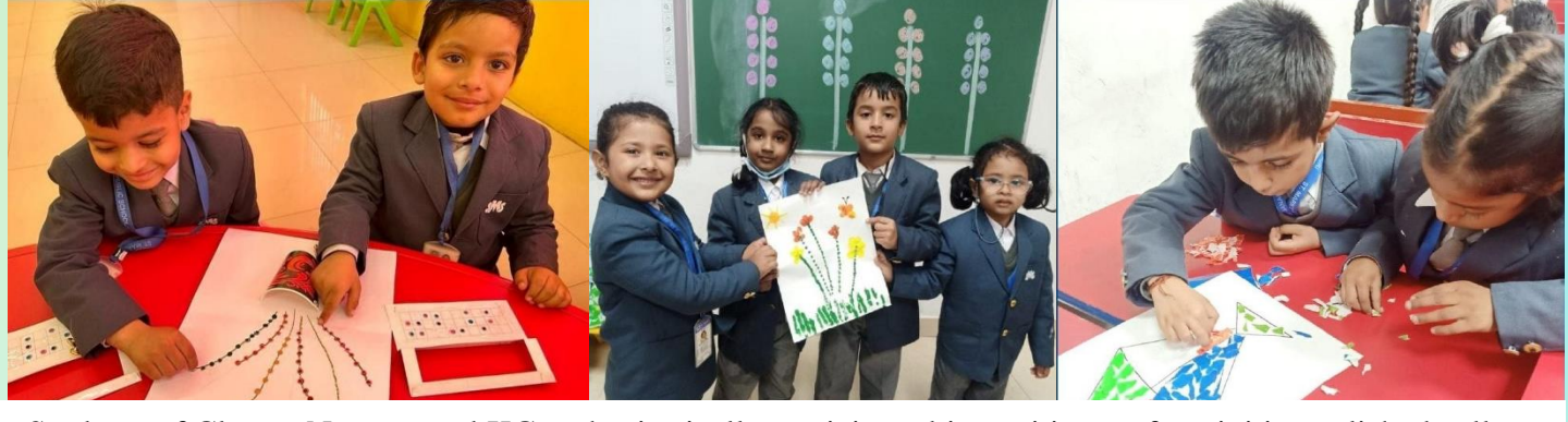
Students of Classes Nursery and KG enthusiastically participated in exciting craft activities, relished yellow coloured food items and learnt about the significance of this auspicious festival