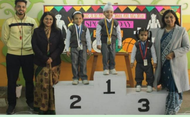
If there is one field of life that teaches us the most valuable lessons about perseverance, patience and infact what constitutes a perfect character, it is sports.