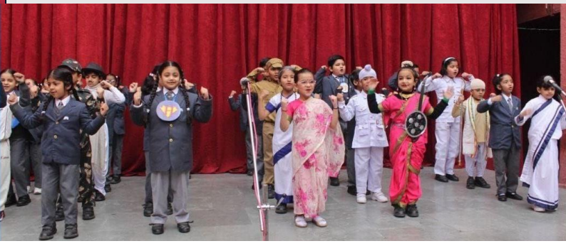
National Heroes (II C)