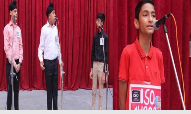
World Standards Day (IX F)