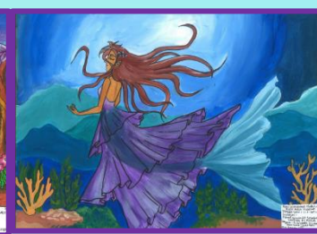
Category: Middle & Senior: Theme: Sustainable Development Goals