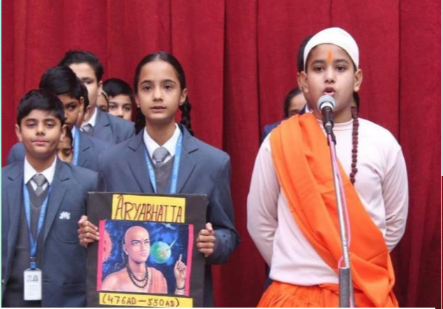
National Mathematics Day (VII F)