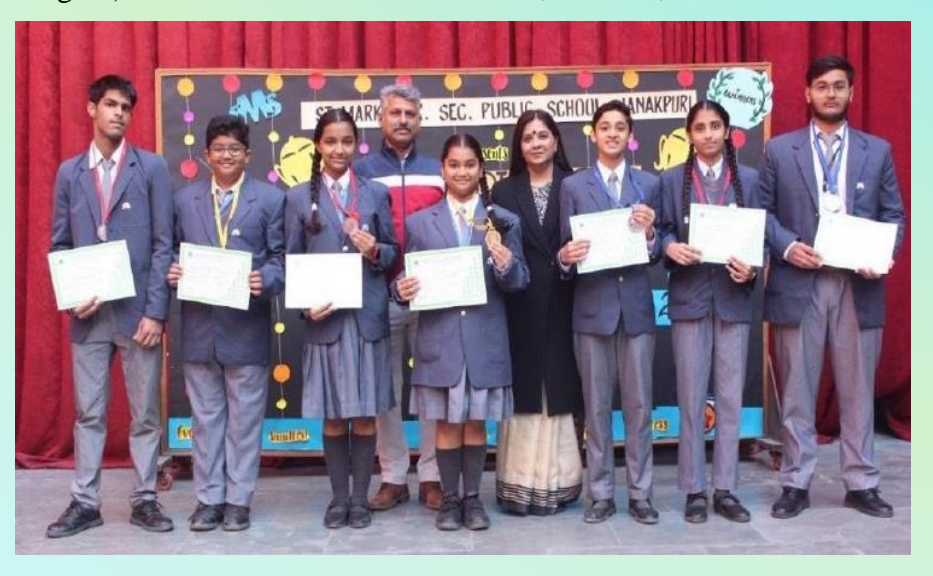
The Gold and Silver medalists have been selected to participate in CBSE National Championship.

Our school Judokas won 2 Gold, 2 Silver and 3 Bronze in CBSE Inter-School Judo Competition (Delhi Region) held at LK International School, Bawana, from 28 November to 30 November 2022.