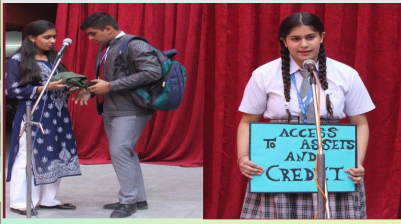
Every morning brings us new thoughts, new words, new strength, and endless possibilities; so to enlighten us and brighten our morning here comes our class assembly...