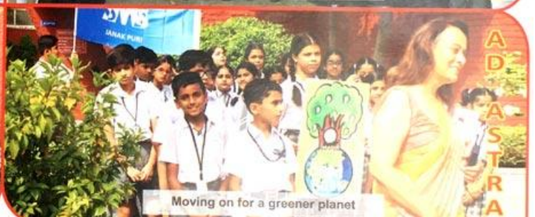
Moving on for a greener planet