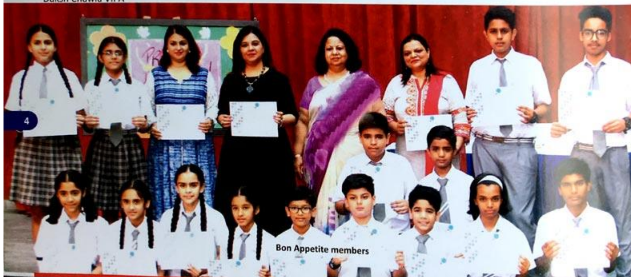
Bon Appetite members