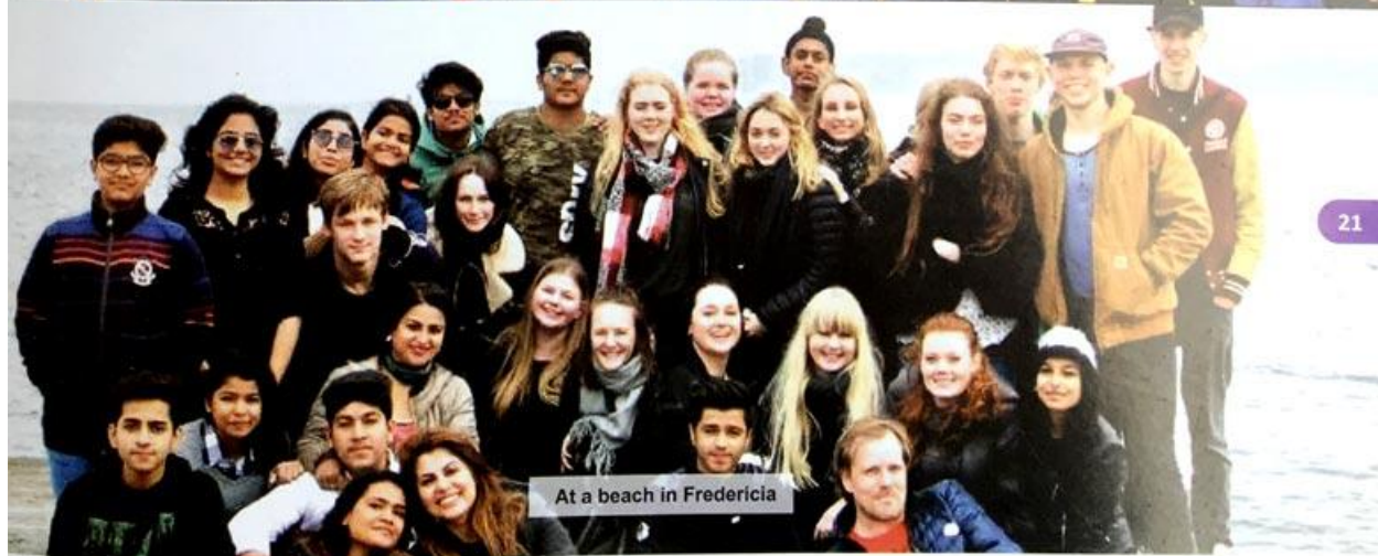
At a beach in Fredericia