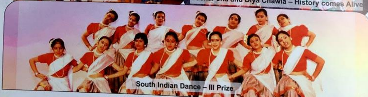
South Indian Dance - III Prize