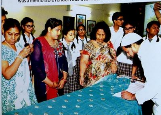
Artisans At Work