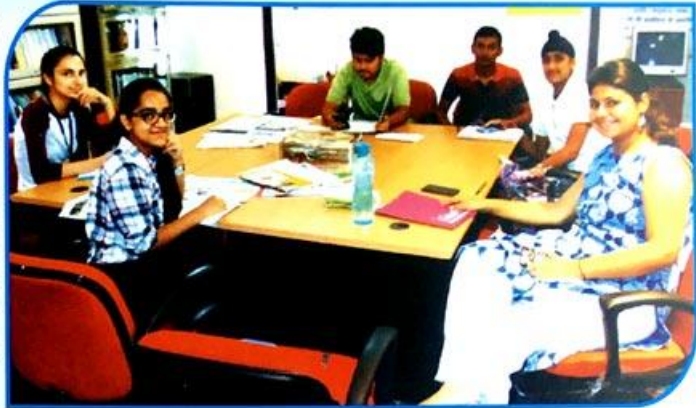
Conference on Itihaas