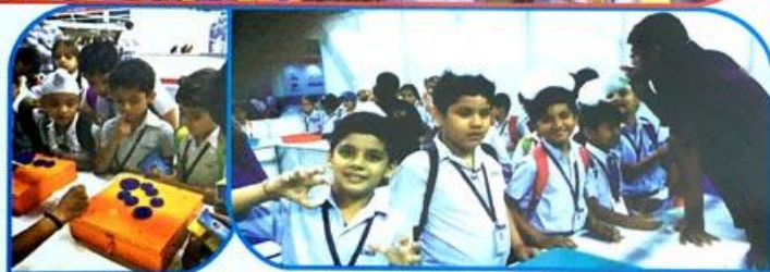
Hands on Experience at Thyagraj stadium for our little scientists.

A group of 92 students from Classes III to V accompanied by their teachers visited the Indian Science Festival at Thyagraj Stadium on 10 August. Students enjoyed the array of science exhibits, experiments and got hands-on experience on various live exhibits. The main aim was to familiarise the students with various new scientific technologies through joyful learning.