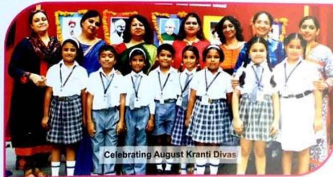
Celebrating August Kranti Divas

On the eve of 75 th anniversary of the Quit India Movement, the students of Classes IV and V presented a program on '9 August -August Kranti Diwas'. The August Kranti of 1942 was a swan song of British rule in India in the history of Independence struggle. To mark the occasion, students remembered the heroics of the freedom fighters who sacrificed their life for the country. The Principal, Headmistress and educational supervisor along with teachers and students garlanded the portraits of our great freedom fighters like Mahatma Gandhi, Subhash Chandra Bose, Sardar Patel, Bhagat Singh etc.