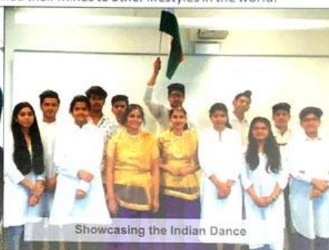
Showcasing the Indian Dance