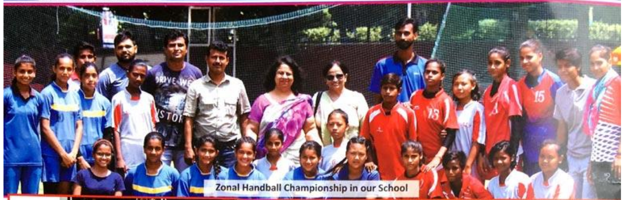
Zonal Handball Championship in our School