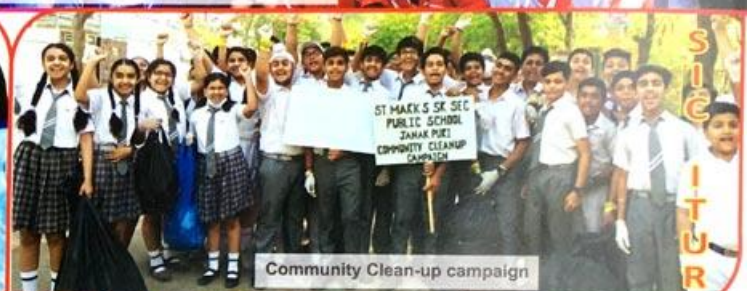
Community Clean-up campaign