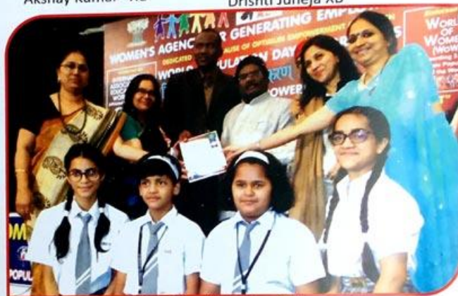
National Population Award Winners.