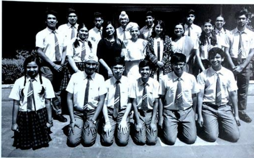
Team of Grandma's Kitchen