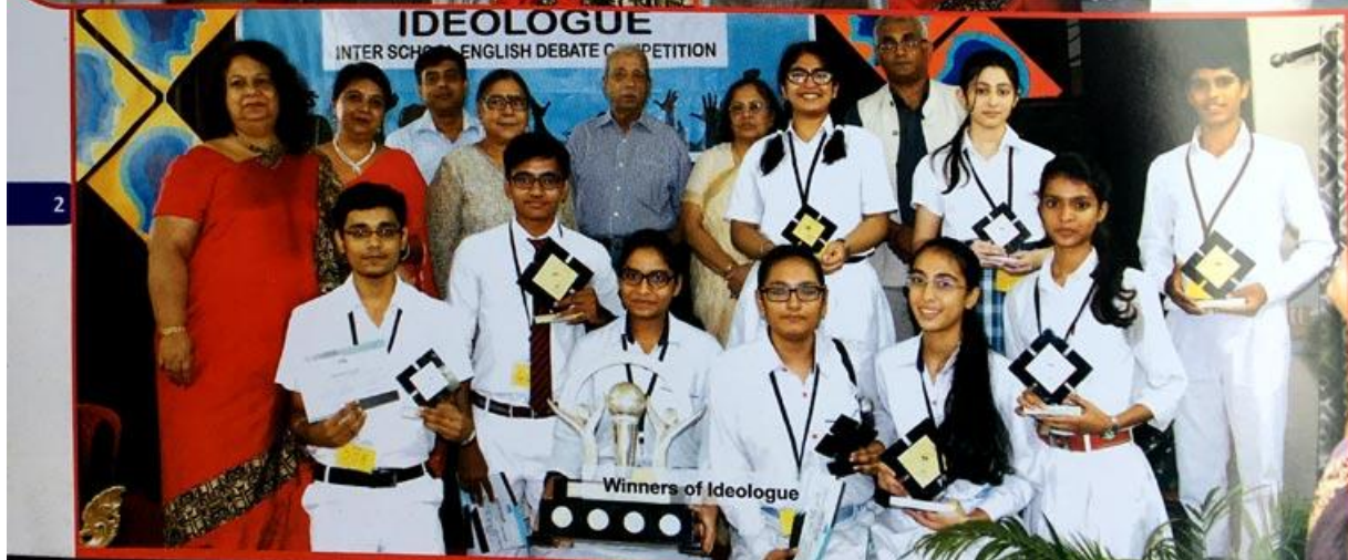
Winners of Ideologue