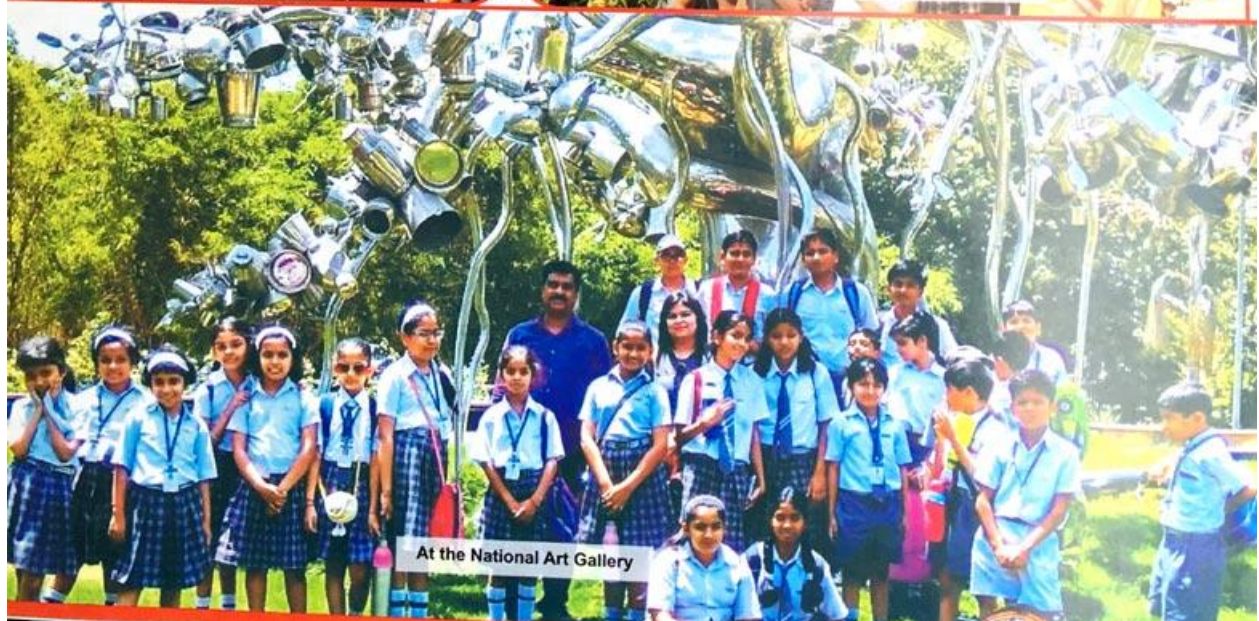
At the National Art Gallery