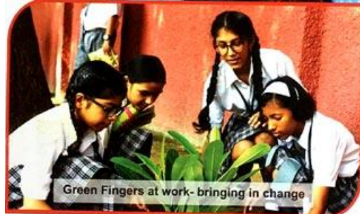
Green Fingers at work- bringing in change