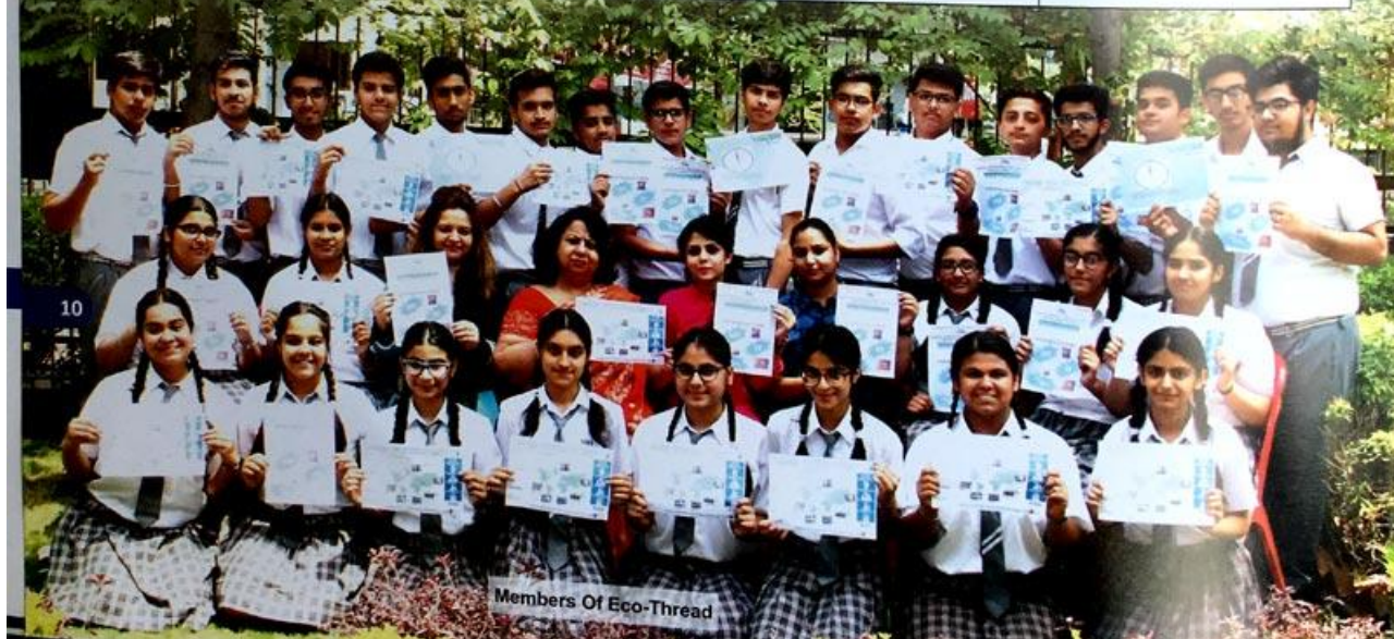
Members Of Eco-Thread