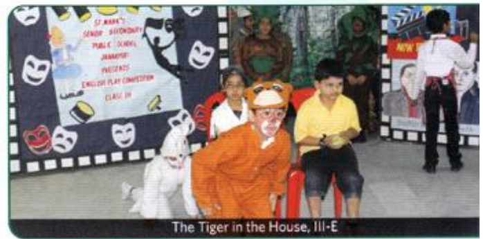
The Tiger in the House, III-E