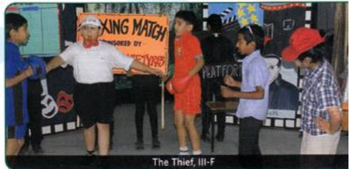
The Thief, III-F