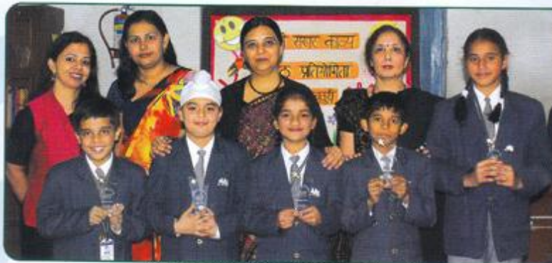
Winners of Hindi Poetry Recitation, Class IV

The spontaneous overflow of subconscious feelings is 'Poetry'. Poetry is the essence of literary work. Memorizing and reciting poetry inspires and builds confidence in the students. It teaches to string words rhythmically so as to capture emotions and ideas in lyrical phrases. In order to encourage students to read and love poetry, Poetry Recitation Competition is annual feature in our school. In this quarter, English and Hindi Poetry Recitation Competition was held for Classes I, II & IV respectively on 26 Sept, 12 Sept and 25 Nov.