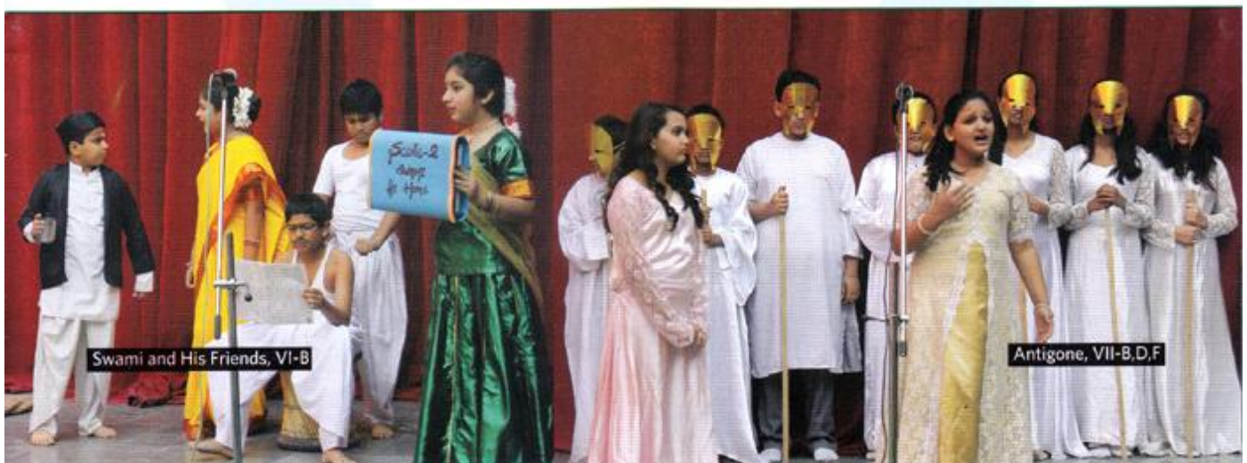
Swami and His Friends, VI-B