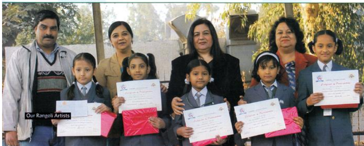
Our Rangoli Artists