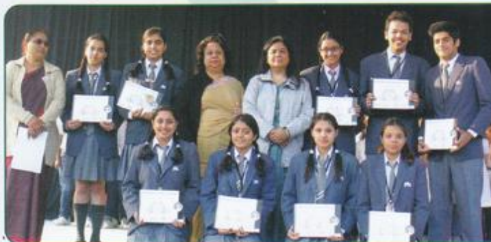
Our representatives at IHMUN