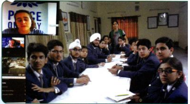
All ears to Face to Faith Video Conferencing