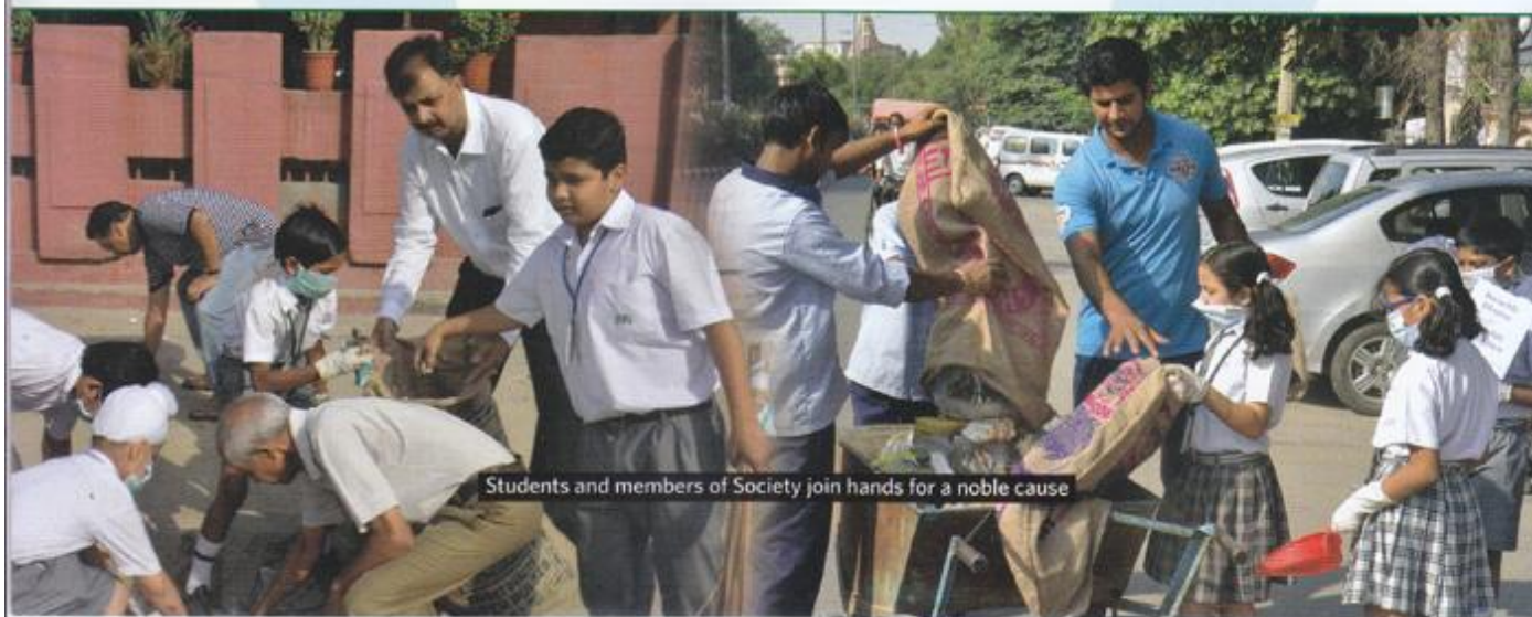
Students and members of Society join hands for a noble cause