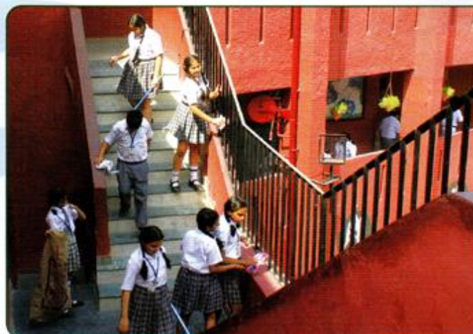
On the right track

Our students enthusiastically participated in various activities organised by CBSE on 17 October, the winners are mentioned below: