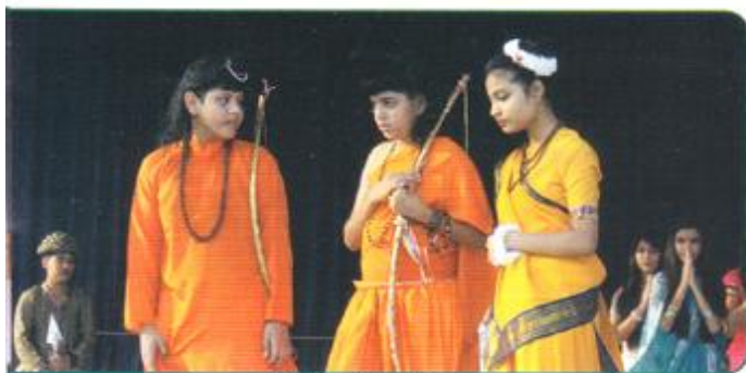
Return of Lord Rama