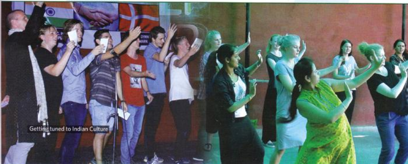
Getting tuned to Indian Culture