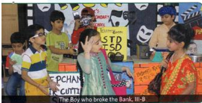
The Boy who broke the Bank, III-B