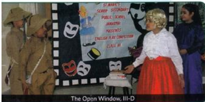
The Open Window, III-D

The Best Play trophy was bagged by Class III B for the play 'The Boy who broke the Bank'. Artists got under the skin of the characters and emulated it to perfection. The other plays performed were: The Blue Umbrella, The eyes have it, The Open Window, The tiger in the house and The thief. For Classes VI and VII , which was held on 15 November, various plays of different genre like, 'Swami and his Friends', 'Story of My Life' were showcased by budding actors. On the whole, it was a good platform for the students to learn all the nuances of acting.