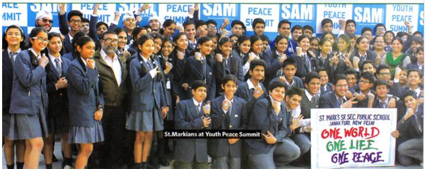
St.Markians at Youth Peace Summit