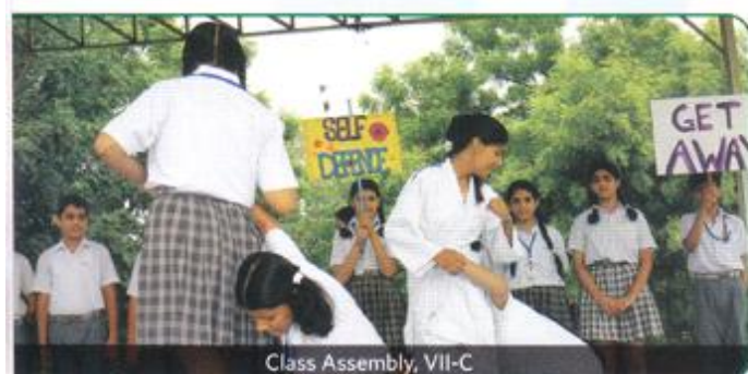
Class Assembly, VII-C