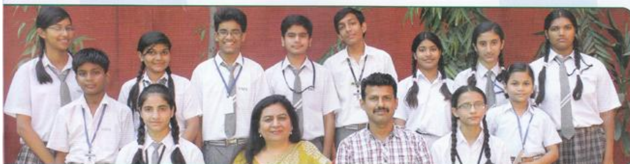
Our Judo Champs