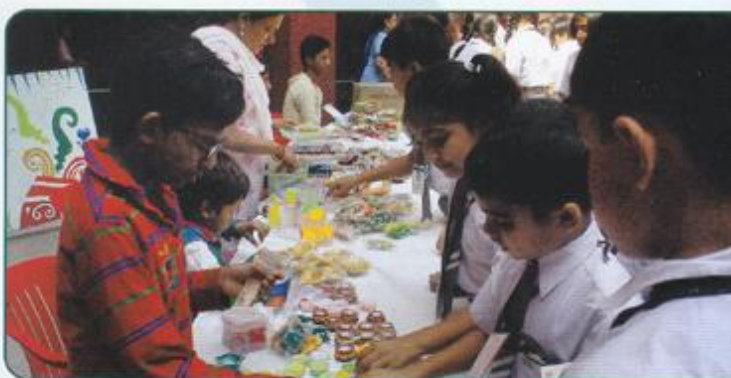
Shopping for a Cause