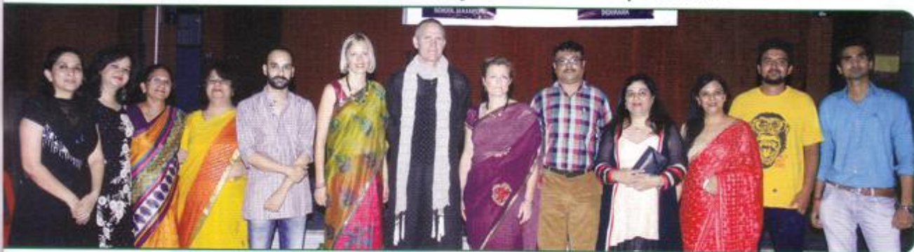
Host and Guest mentors at the farewell dinner