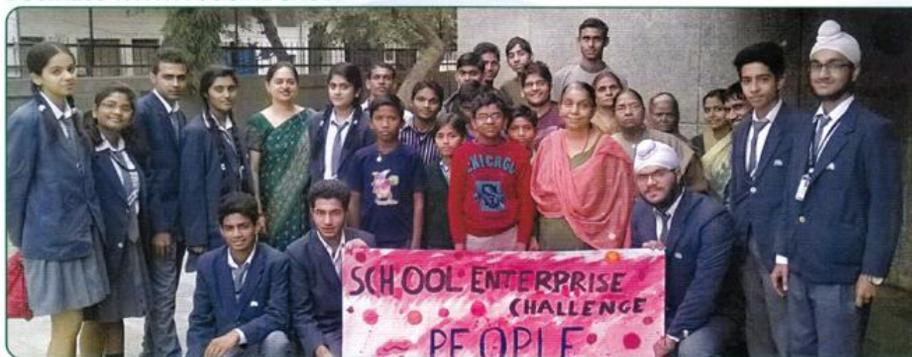
Young Business Minds initiation to Corporate Social Responsibility