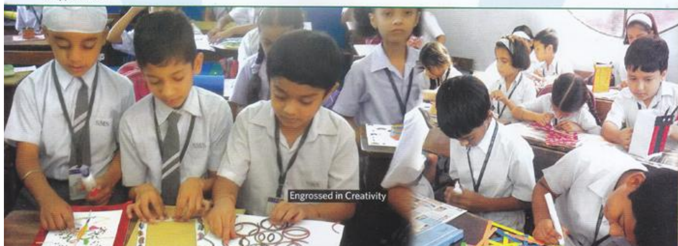
Engrossed in Creativity

To enhance the creative quotient among the students, Art and Craft Day was organized on 30 September for the students of Class IV and Class III . Students of Class IV enjoyed making colourful articles- Mask Making, Doll Making, Dot Painting using ear buds and decorating Mosaic Tiles, Pots and Candles, Bottles, etc. Class III students were encouraged to use recycled material to showcase their creative talent. Toilet roll holder, shuttle cock, nut shells etc. were turned into dainty fairies, pen holders and photo frames. Students used quilling technique to make beautiful greeting cards. Environmental awareness was a byproduct!