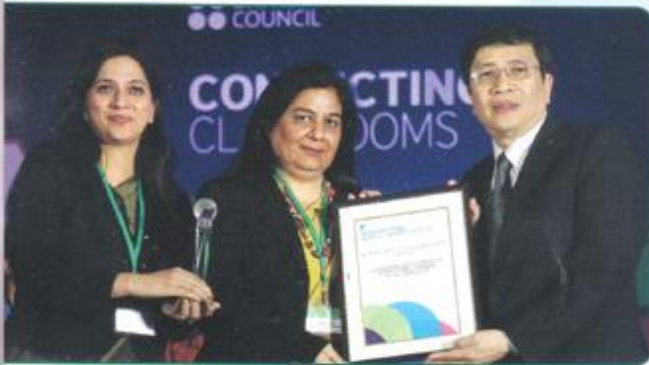
Receiving ISA Award