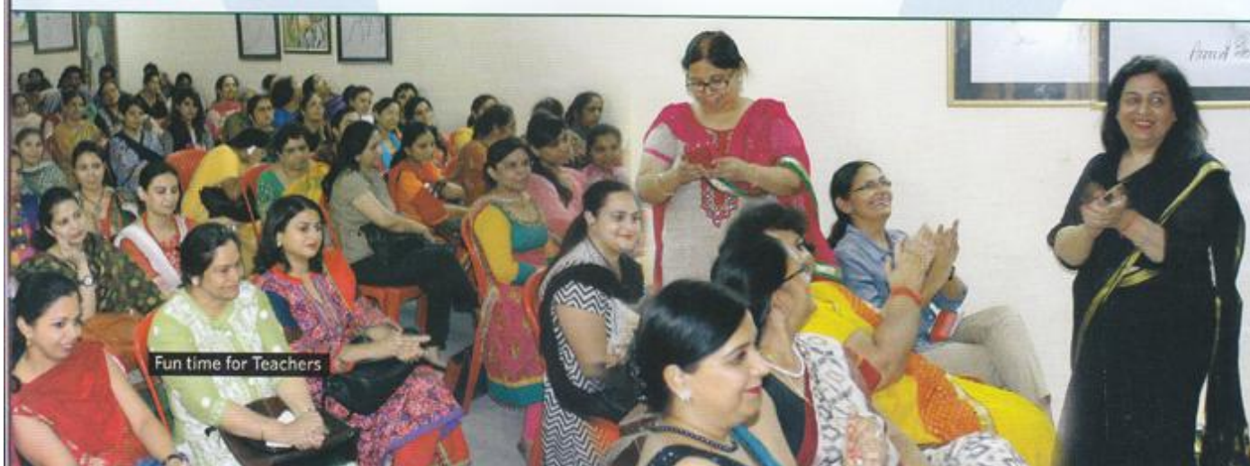
Fun time for Teachers