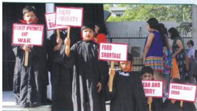
No Compassion, No Peace

To nurture the spirit of Ahimsa-Non Violence (core of India's Spiritual Philosophy) the primary wing of our school organized "Peace Day Activities" from 22 Sep.-20 Oct. The entire month had a plethora of activities based on central theme of "Peace".