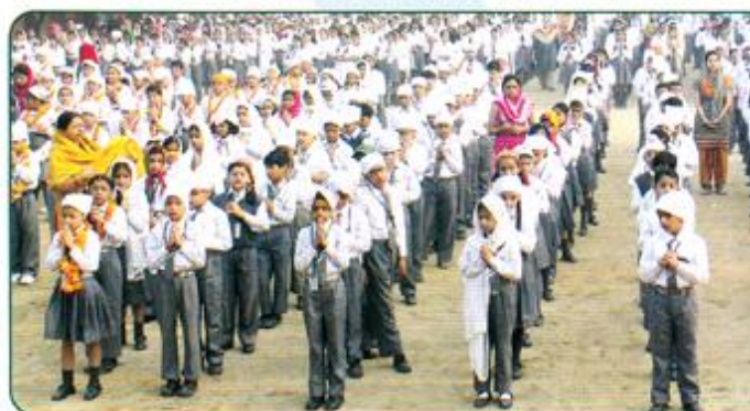
Glimpses of GuruPurab Celebration