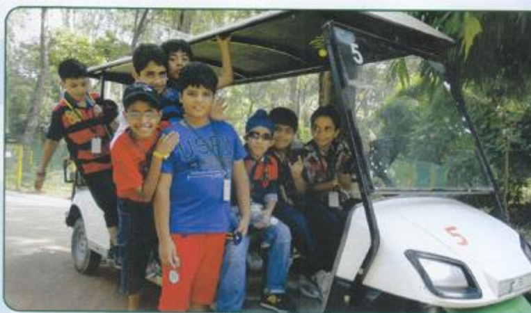
Markians day out

Students found Chandigarh to be a green and well-planned city; different from other Indian cities in terms of architecture and urbanized living standards. Students' first stop was the famous Rock Garden, created by Nek Chand. They were awed at the creativity and innovation of the sculptures from waste and recycled materials. The evening was spent enjoying water sport activities like paddle boating in the beautiful Sukhna Lake. Next morning, students visited the Chhatbir Zoo wherein the Lion Safari was the most fun-filled itinerary for them. A visit to the Government Museum and Art Gallery enriched the students' knowledge of not only their environment but also provided information of historical significance and its evolution through the years.