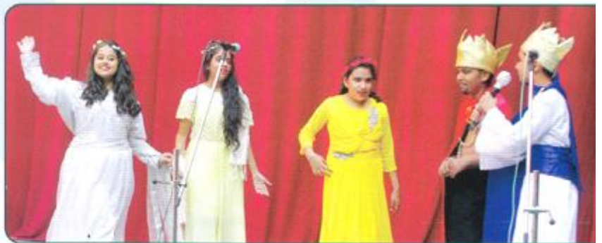
Heaven, Earth and a Horse of Wood, VII-A, C, E