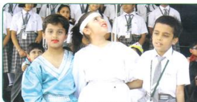
Peace Day Celebration, IV-G