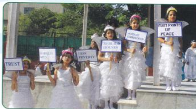
Know Compassion, Know Peace

On 22 Sept a Special Assembly on Peace Day was conducted by the students of Class IV-G, during which they took the pledge to promote world peace. Balloons carrying messages on World Peace were released. The students meditated near the Peace Pillar installed in the school. The students showcased their creative potential by making paintings and writing articles on the topics such as War is expensive, Peace lies within; and also by displaying on the bulletin boards their creations during the entire period. The parents who visited the school during the Parent Teachers Meeting immensely appreciated the efforts put in by our students.