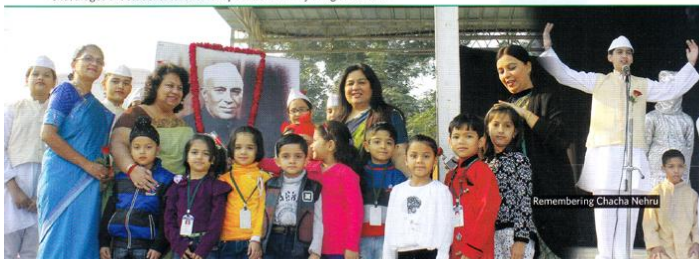
Remembering Chacha Nehru