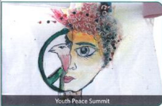
Youth Peace Summit