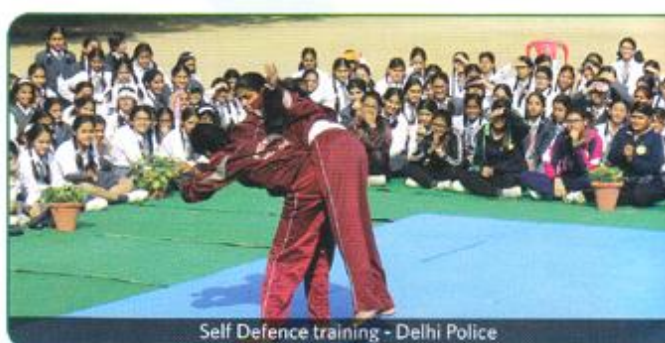
Self Defence training - Delhi Police

The more we sweat in peace - The less we bleed in war