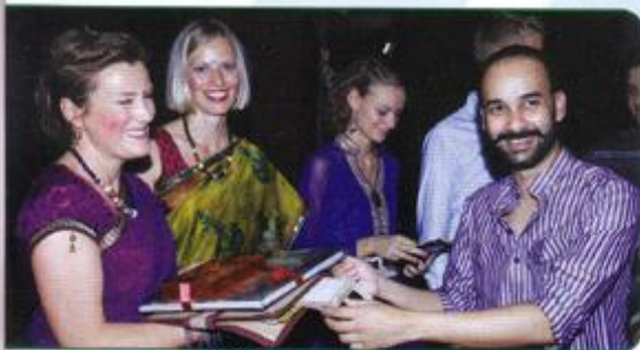
Felicitating guest mentors