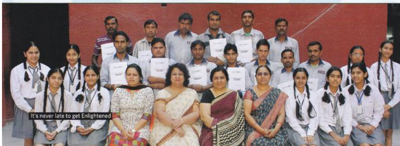
It's never late to get Enlightened