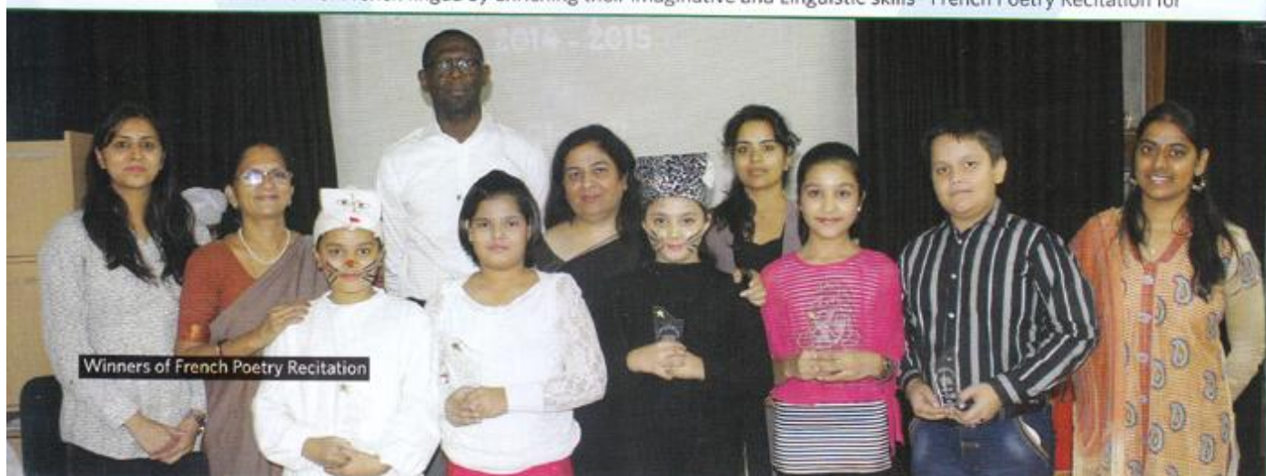
Winners of French Poetry Recitation

To enhance students' flair of French lingua by enriching their imaginative and Linguistic skills- French Poetry Recitation for