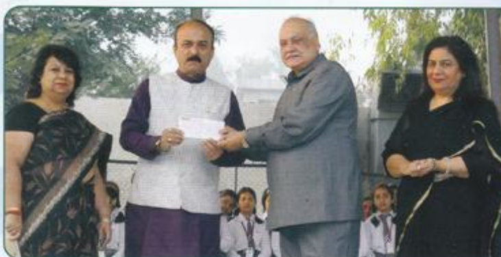
Extending our Support