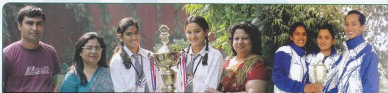
43rd Sr. Women National Handball Championship Winners