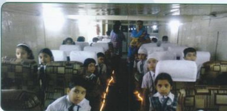
Getting a feel of flying

Students of Classes I to III had their share of fun and adventure when they visited Aero-Planet on 20 October. Picnic and celebration in Airbus A-300 and CRJ-200 Aircrafts with sports recreational activities like trampoline jumping, escape slide, crossing and trolley ride added to the fun quotient. Students had an experience of smoke and fire drill in the aircraft along with flight demonstrations of usage of oxygen mask and emergency ditching in water.