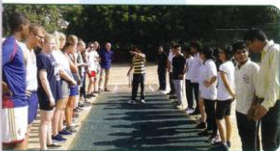
All set for a friendly match