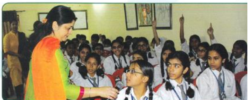
Saving Energy for future - Energy and Resource Conservation Workshop