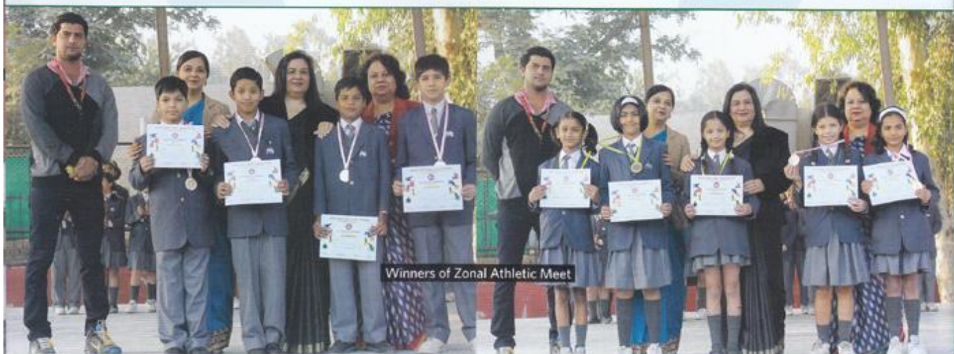
Winners of Zonal Athletic Meet