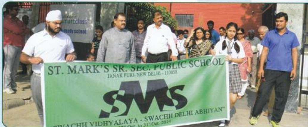
Rally with a message

A3 Block Janakpuri was adopted as the 'Karmabhoomi'. Members of Residents Welfare Association enthusiastically joined hands with our student volunteers and teachers to achieve the motive.