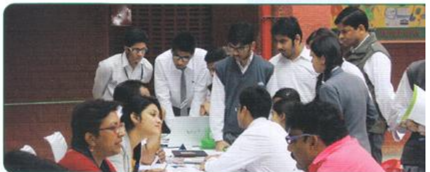
Planning for future-Career Counselling Workshop