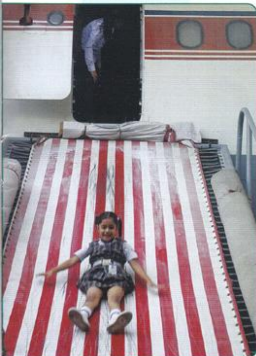
Vroom I Go! Emergency Evacuation at Aeroplanet