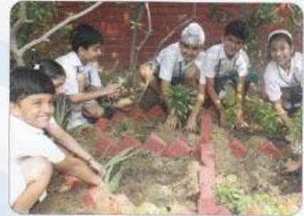
Herb wheel - Spice up your kitchen