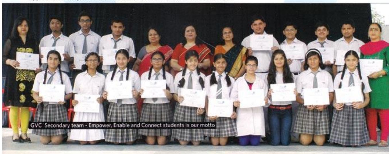
GVC Secondary team - Empower, Enable and Connect students is our motto