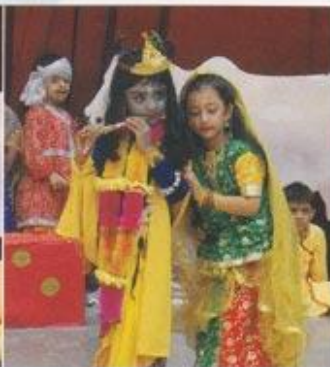
Radha Krishna Amour A Legend For All Times