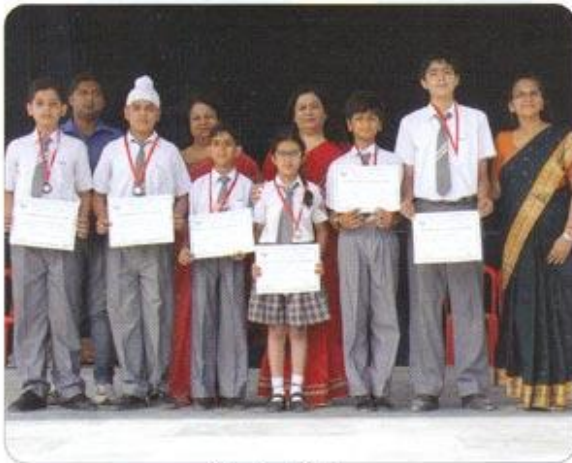
Our Proud Skaters