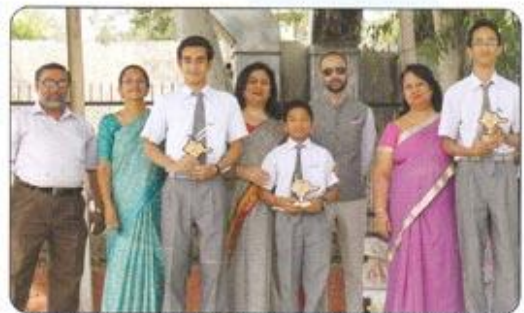
Our consciousness for Mother Earth made us the winners