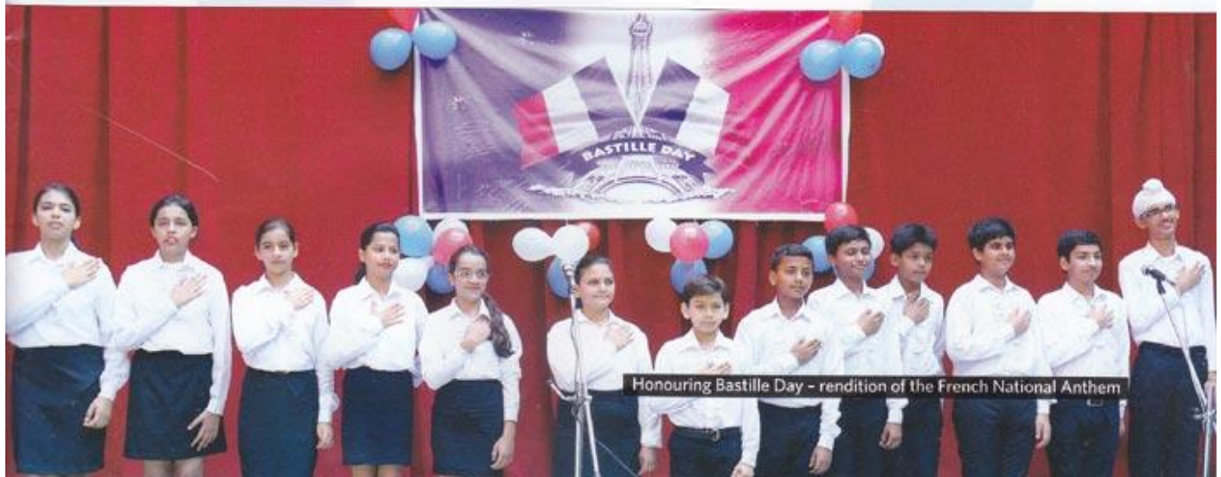
Honouring Bastille Day - rendition of the French National Anthem