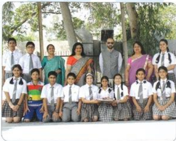
International English Olympiad (SOF) - School Toppers