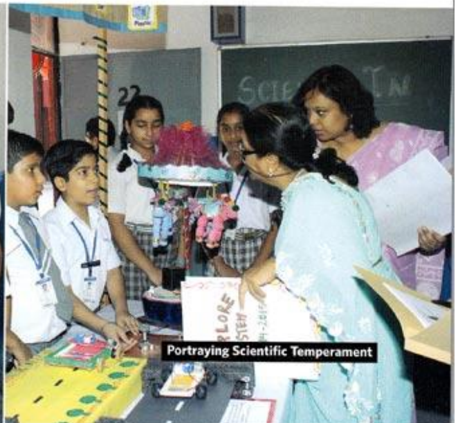
Portraying Scientific Temperament