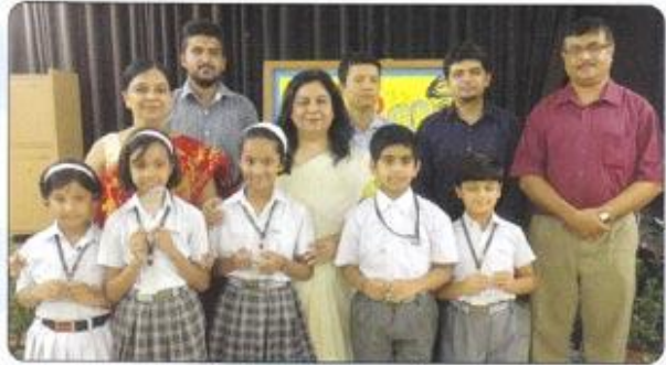
Solo Singing Winners - Class III

Music is the universal language. A good melody is something that everyone can enjoy and understand. Music is a great form of expression, especially in children. It can boost their brain's capability, build confidence and inculcate discipline. Towards this endeavour, Solo Singing Competition was organized for Classes III, IV on 1st August and Class V on 16th May 2014. Students presented melodious numbers from different genre and rendered songs of famous singers & rock bands like the Beatles, ABBA, John Denver, Cliff Richards etc. The audience enjoyed the foot tapping music and clapped along to cheer up the competitors.