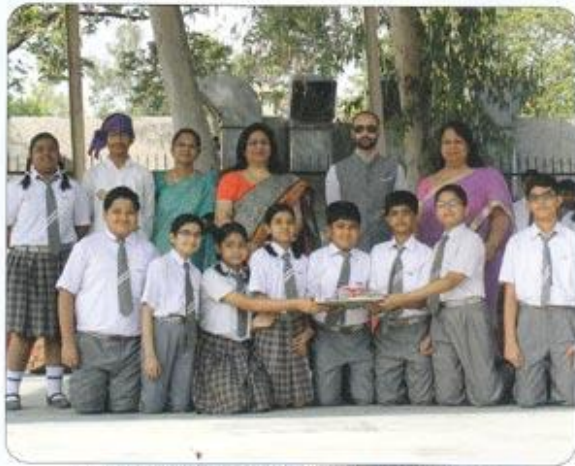
National Science Olympiad (SOF) - School Toppers