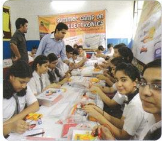
Learning Electronics -The Fun Way