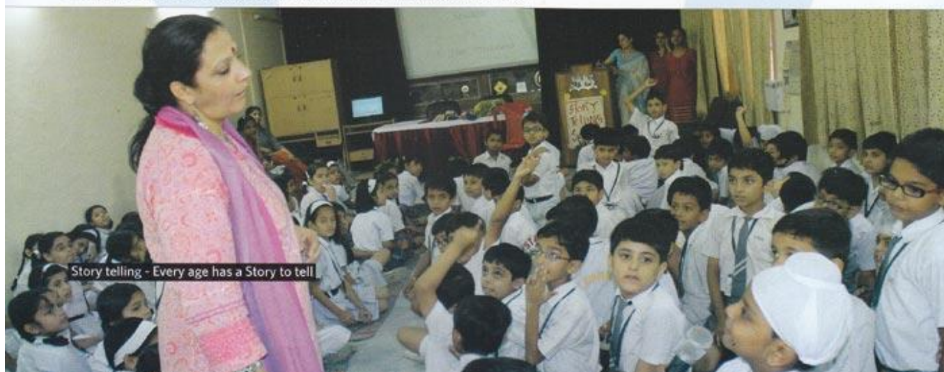
Story telling - Every age has a Story to tell

Altogether the Book week was a great reading event for everyone to enjoy !