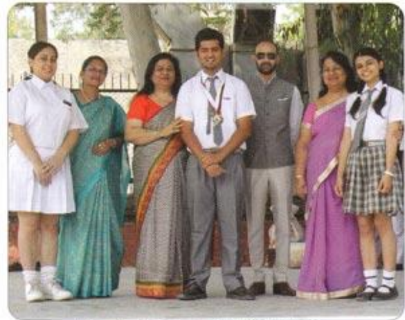
Versatile Performers - World Scholar's Cup