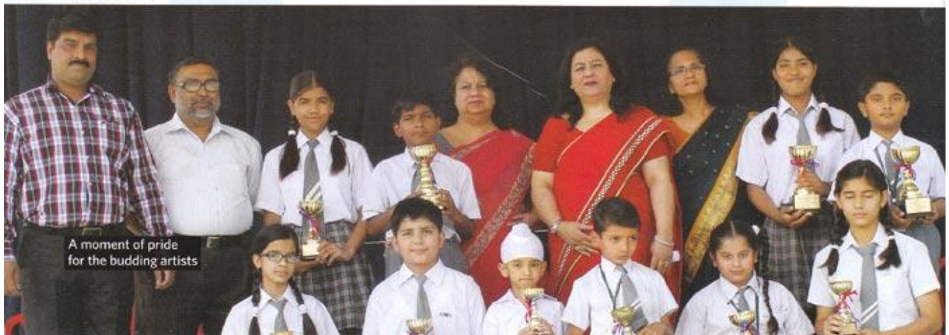
A moment of pride for the budding artists

As a part of Earth Day celebration, MAA Foundation organised an Inter School Drawing Competition on 24th April on the Topic "Save Earth".