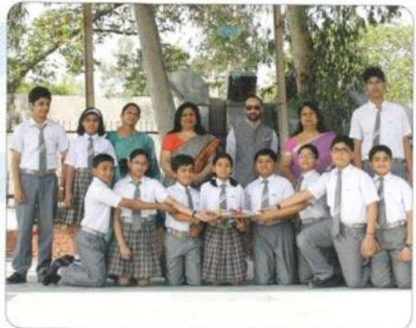
International Mathematics Olympiad (SOF) - School Toppers