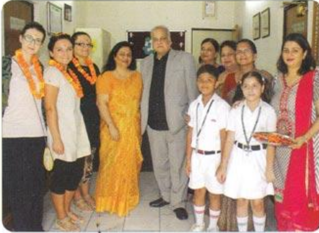
Welcoming AEC members from Poland