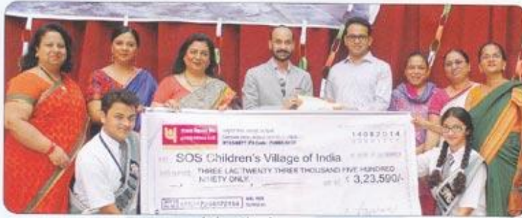
A donation for a cause