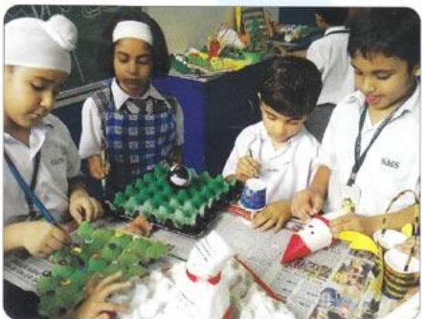
Creativity at its best - Art & Craft Day