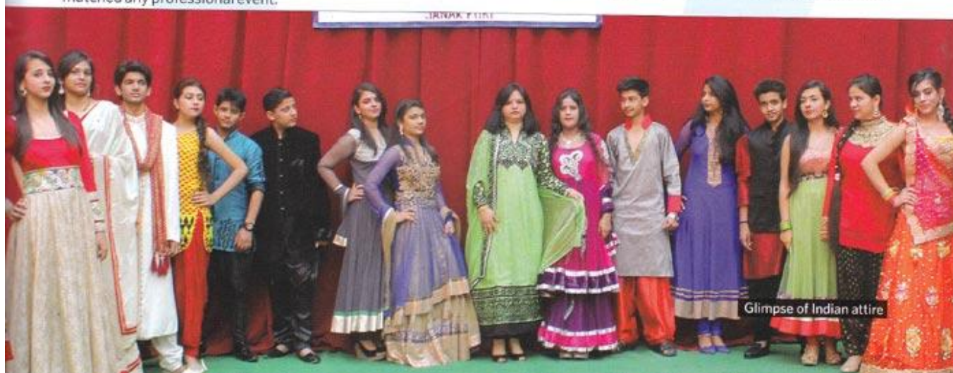
Glimpse of Indian attire

A Fashion Show was organized on 10th May 2014 in our school, wherein our students got a chance to walk on the ramp, while presenting the vibrant traditional Indian attire for AEC Project 'Wear It Out!' . They put up a splendid show that could have matched any professional event.