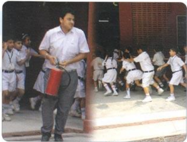
Mock Fire Drill