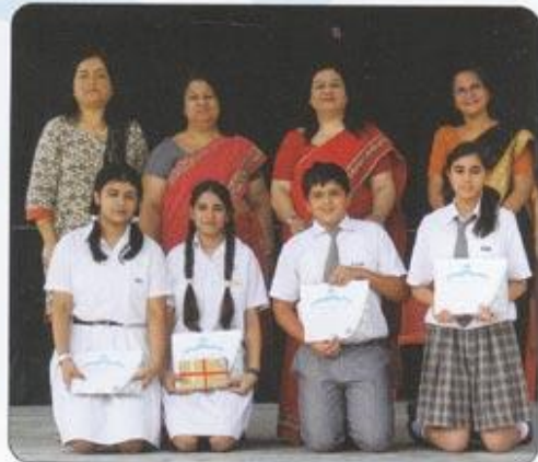
The Henry V team