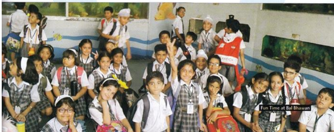
Fun Time at Bal Bhawan

St. Markians, of Class I acquired new vistas of knowledge during their visit to National Bal Bhawan on 30th July. They got familiarised with the Indian history by having a glimpse of Chacha Nehru's life history, reading the lives of various freedom fighters while having Bharat Darshan, thus gaining tremendous insight of our Indian culture and history. They also visited Science Museum and gained few scientific tips. New aquatic facts were revealed to them during the aquarium visit. The students also enjoyed the toy train ride.