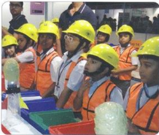
Our Rocket Makers