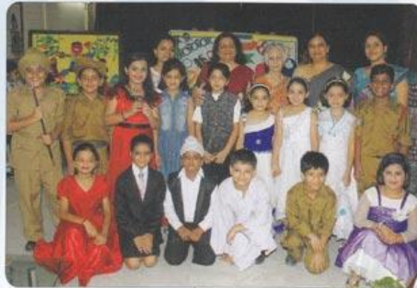
All the World's a stage - Cast of The Best Play