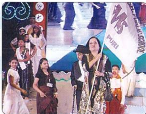
St. Markians at Odyssey LitFest