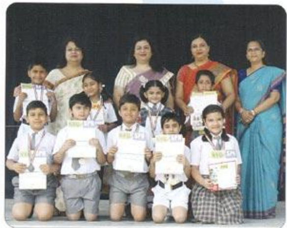
Our Junior Olympiad Winners