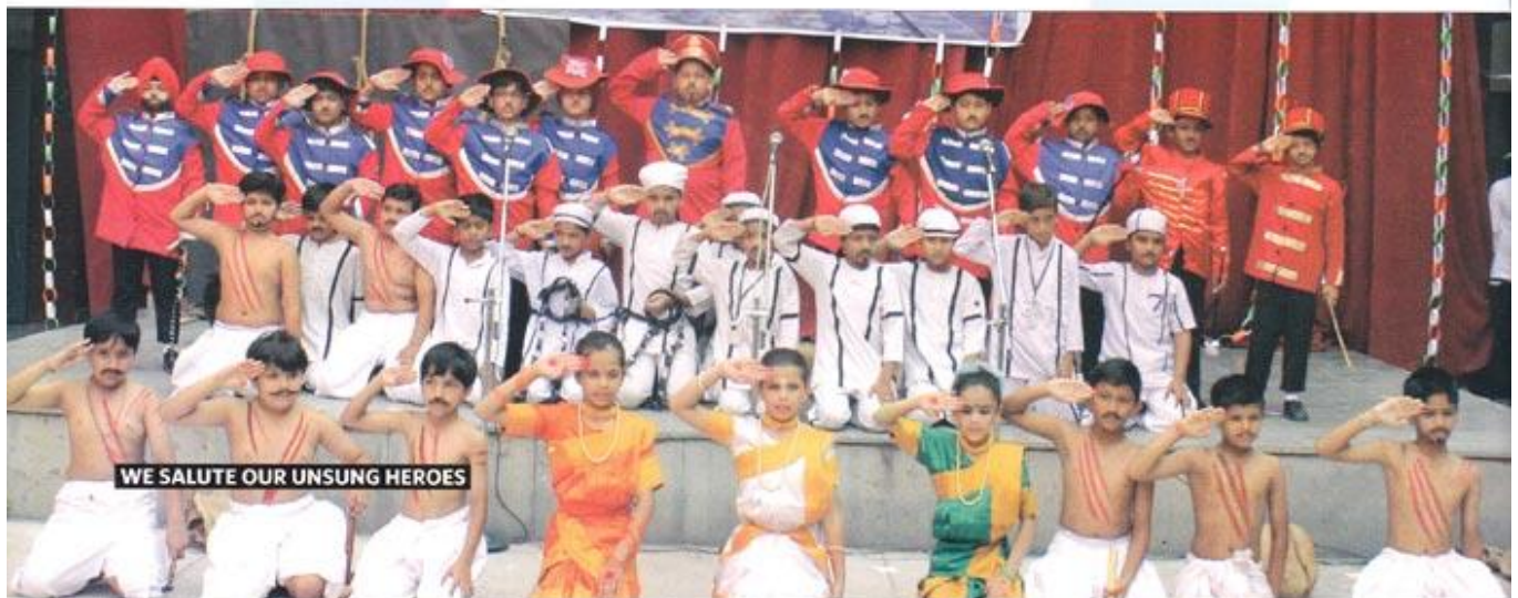
WE SALUTE OUR UNSUNG HEROES