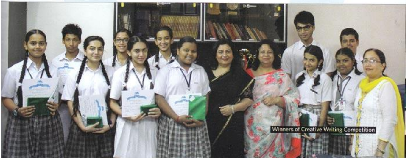
Winners of Creative Writing Competition