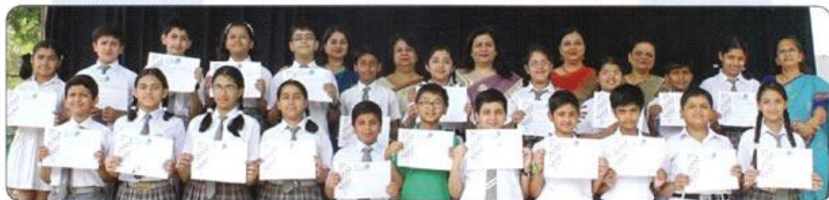
GVC Primary team - Learning the new trends of 21st Century

GVC - An online collaboration learning project that fosters creativity, cross cultural understanding, helping others and teaches Information Technology and Website Designing skills amongst students, required for 21st century, working together from around the world. Contest participants virtually collaborated with students in other countries to build and submit website designed around a provocative theme. The primary team of our school along with our partner schools - Edgewood Elementary School, USA and Voznesenskaya School, Russia won the Special Merit Award for Exceptional Creativity. Our topic was 'Holidays Around the World'.