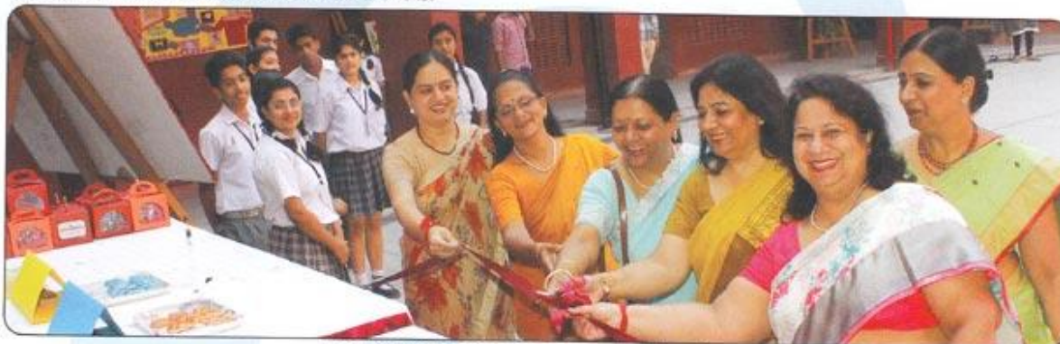
Inaugurating Choco Reindeer- The carrier of happiness...