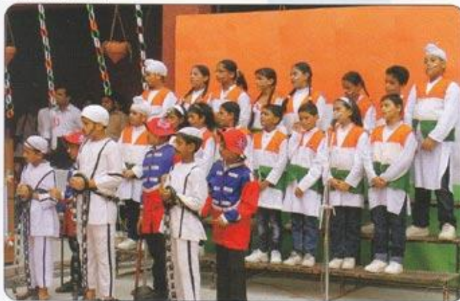
Eulogizing our Martyrs

On the eve of our 68th Independence Day, students of Class V saluted the unsung heroes of our freedom struggle, taking everyone on a nostalgic journey of the Cellular Jail in Port Blair – which is inalienably linked to the long and glorious struggle of our revolutionary freedom movement. They presented a wonderful medley of song, dance and drama enacting the plight of the patriots, who raised their voice against the British Raj and were sent to Kaala Pani – where they eventually perished. The students also stressed upon the fact that it is our responsibility to safeguard our hard – fought freedom and take India to newer and greater heights. The event culminated with a high – spirited rally taken out by the participants in the school and neighbourhood areas.