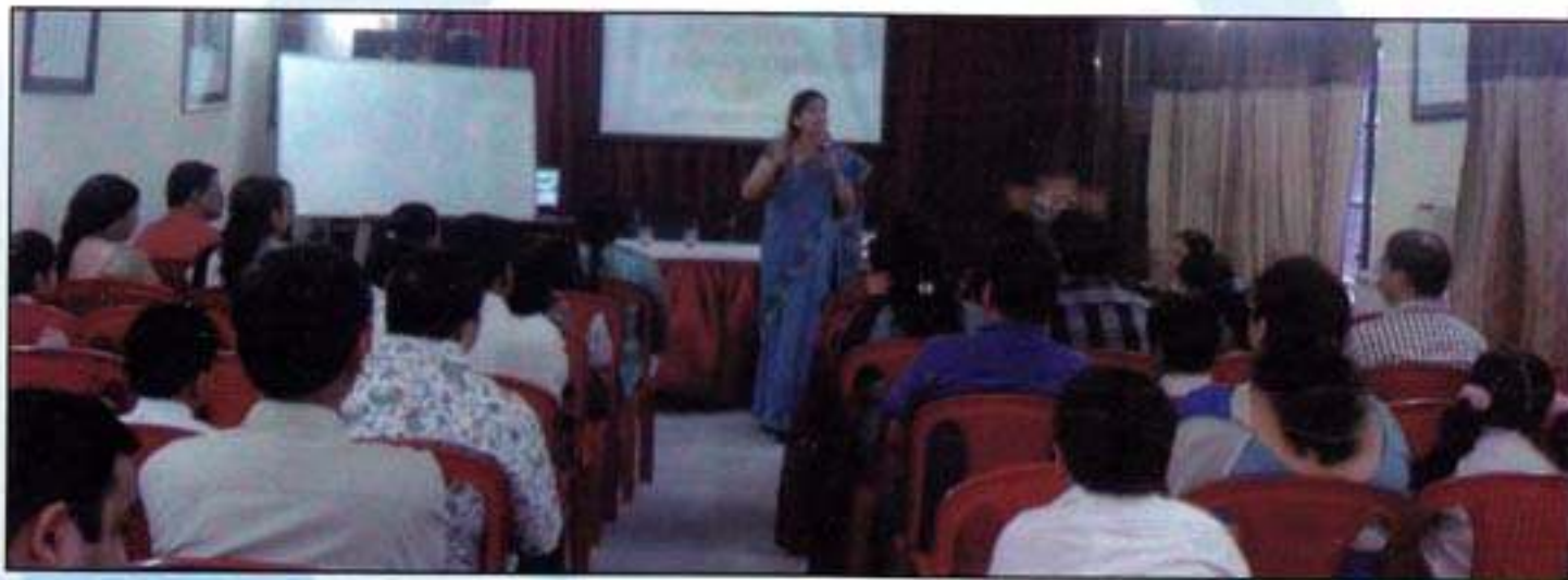
Parents attending the workshop

A workshop for the parents was conducted on "Positive Parenting" by The Times of India in the school on 21 April. The main focus of the workshop was on building up the child's self-esteem which enables him/her to be a confident decision maker of future. The workshop ended with an interactive session in which the parents put forward their queries.