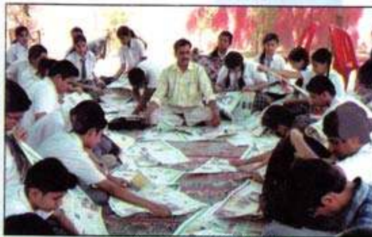
Newspaper Craft Workshop

Camelin Art and Craft Workshop , for classes IV – VII was held from 16-18 May in the school premises where fifty students participated and performed creative work like Tie&Dye, Bread Craft and Texture & Sand Painting