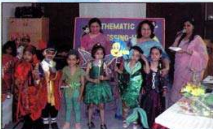
Prize winners of Class I