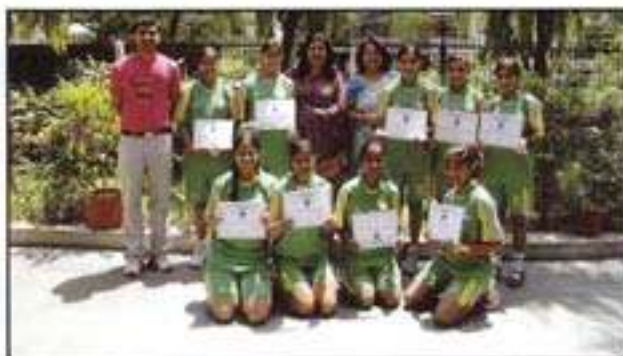
Handball Team (Girls)

The tournament was held in Bilaspur, H.P. from 22 May to 28 May. A prize money of Rs. 7000/- was given to each of the team member.