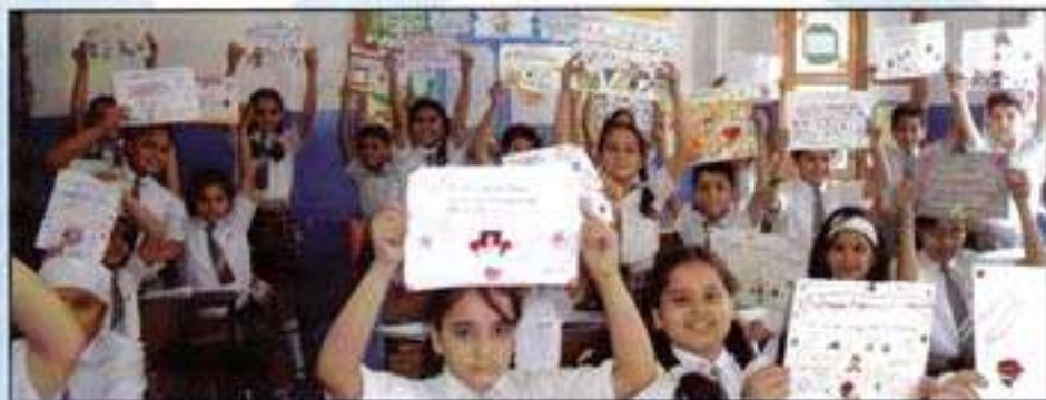
The students of the primary section expressing their love in their own special way