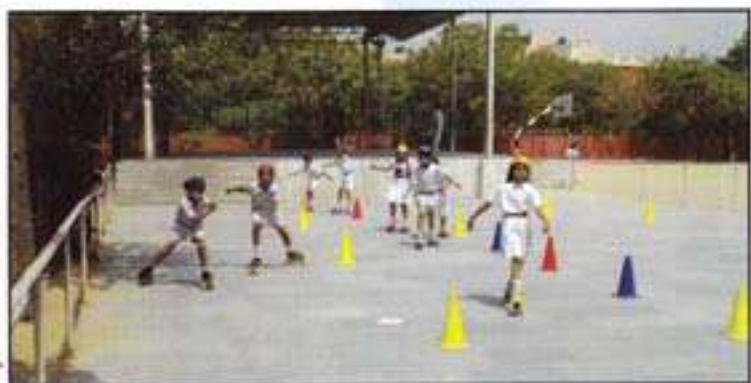
Skating is fun