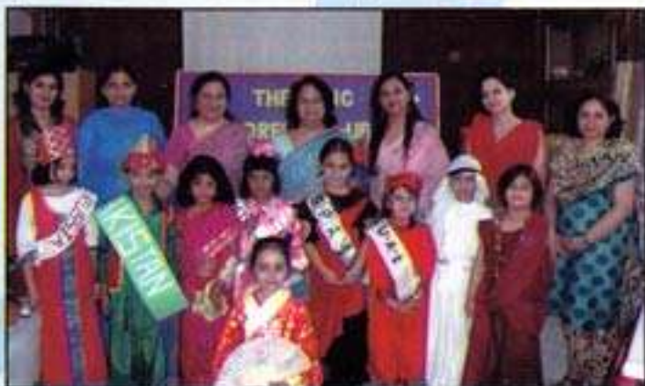
Prize winners of Class II