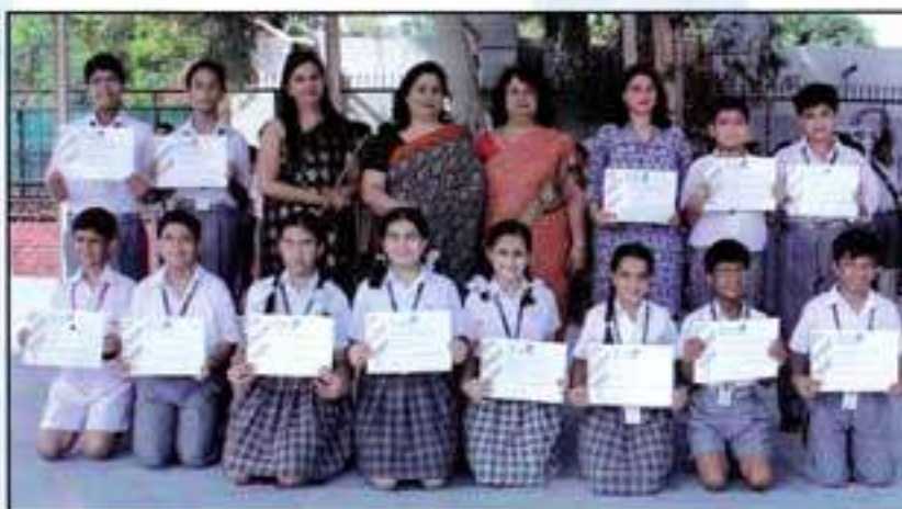
GVC Junior Team