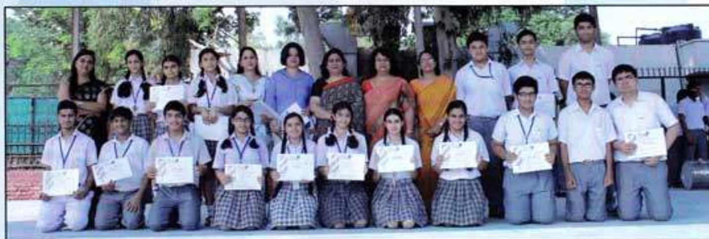
GVC Senior Team