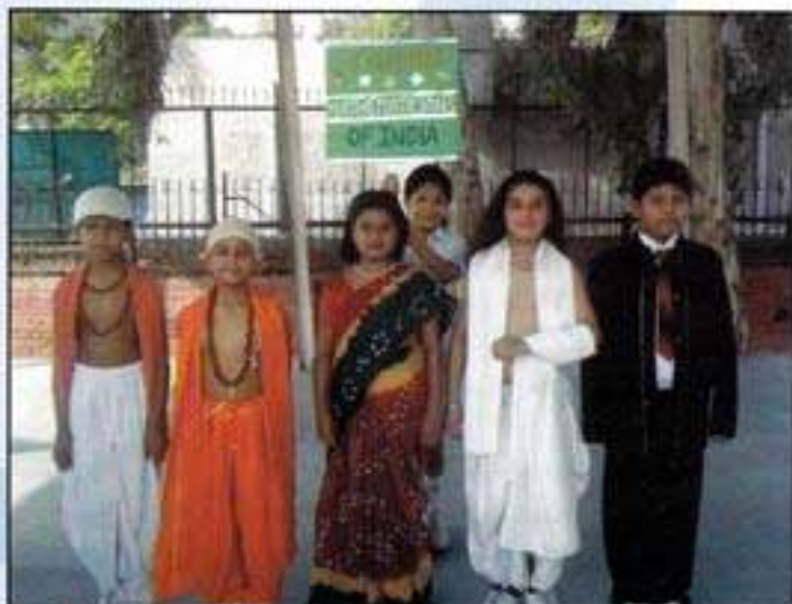
Students emulating our renowned mathematicians