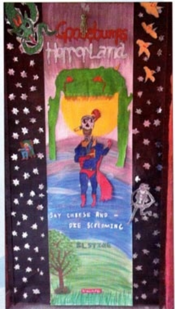
Book cover design on class doors