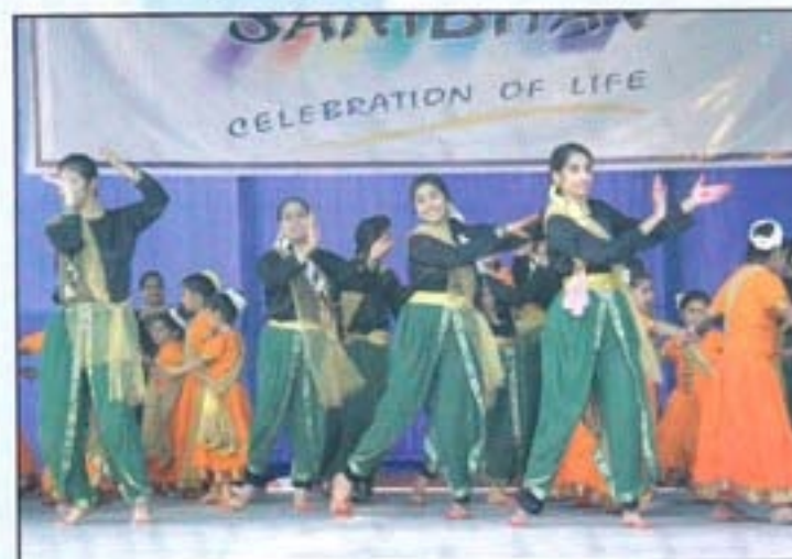
Dance depicting the joy of life