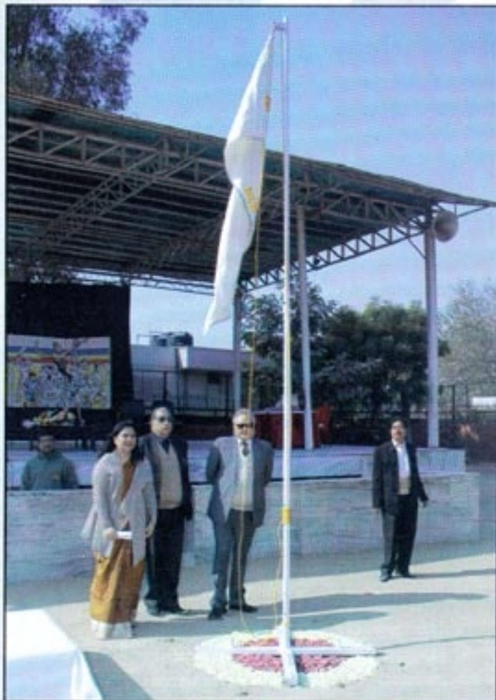
Flag hoisting by Chairman