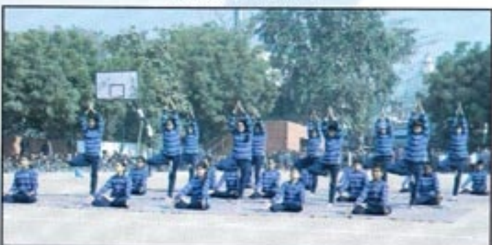
Yoga for Holistic Development