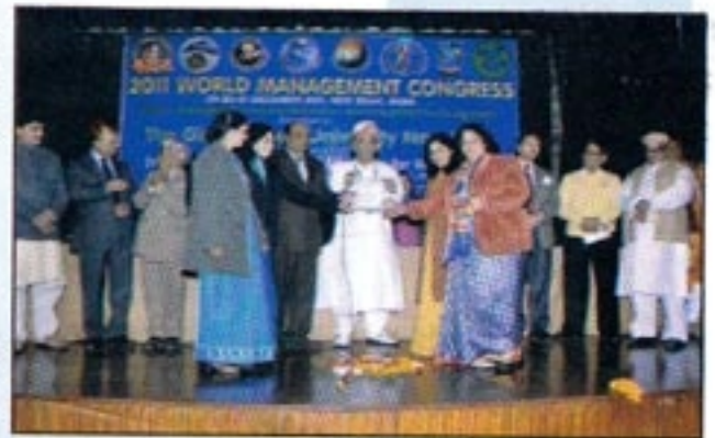
Receiving the award

SMS Janak Puri was awarded "Green and Clean school Campus Award" 2011 by the Global Open University Nagaland for the outstanding contribution in the areas of environmental education planning, cleaning and greening of school campus.