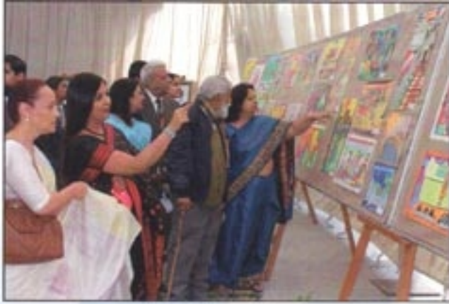
From the archive