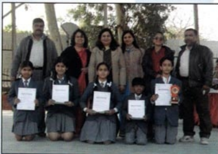
Ramjas Inter School Competition