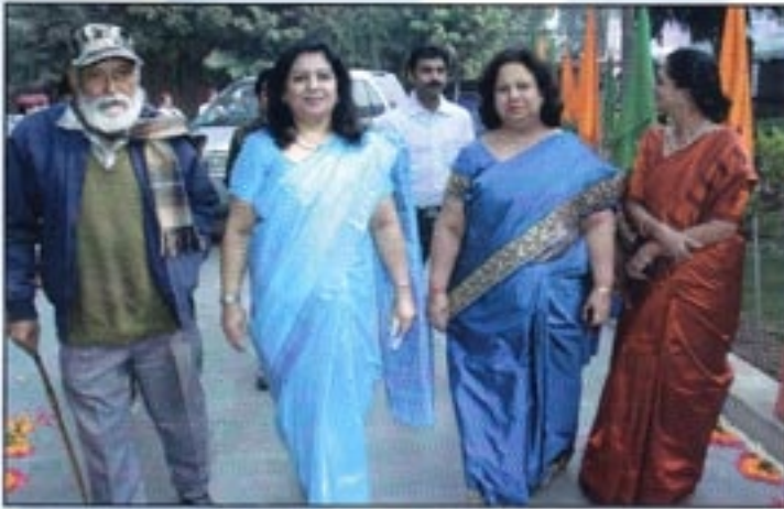
With the Chief Guest