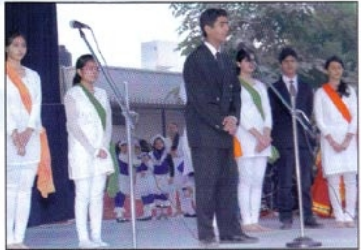
Skit by X A students