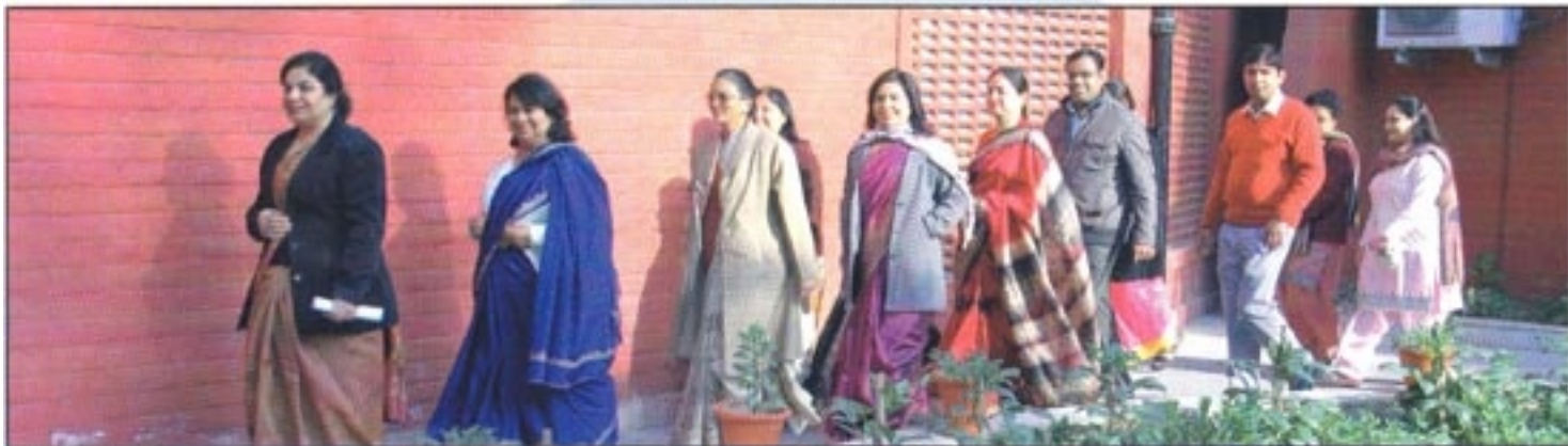
Principal leads the faculty