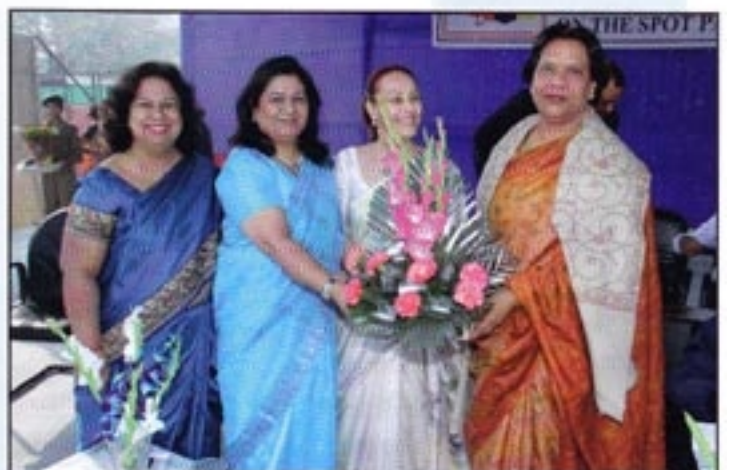
Welcoming the Education Officer