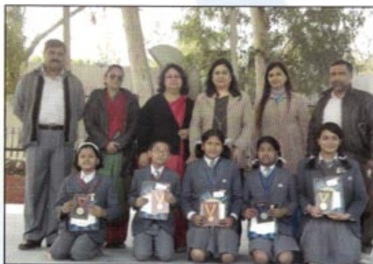
Regional Level (North Zone) Competition