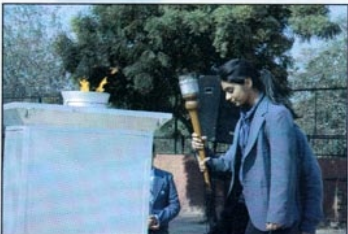
Lighting the Torch