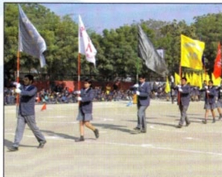
Marching with the house flags