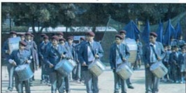
Band in Rhythm