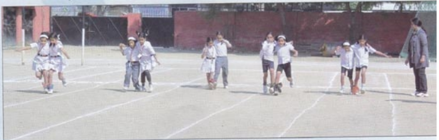
Three Legged Race