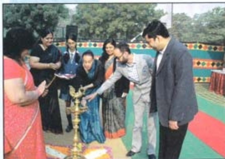
Lighting the ceremonial Lamp