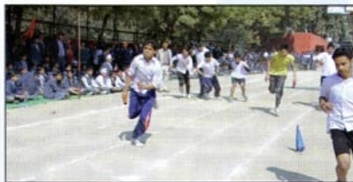
400m race seniors