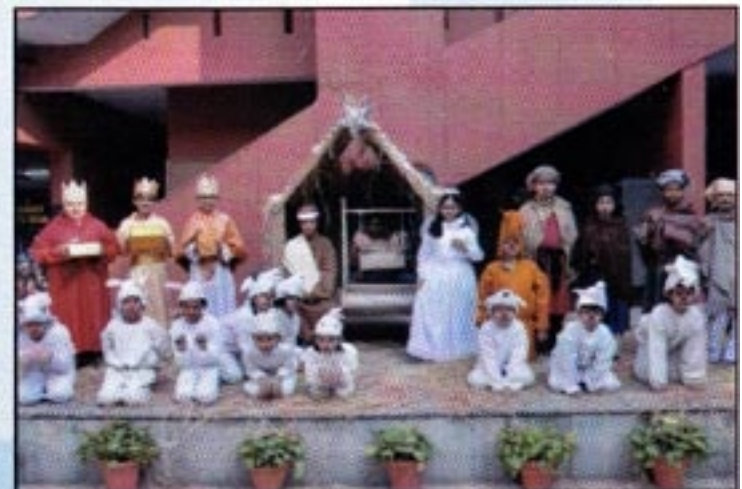
Jesus in Crib