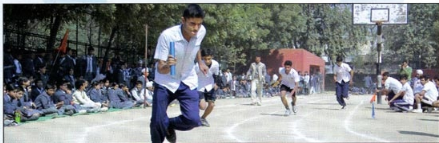
200m race seniors