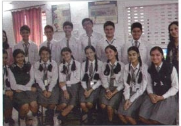
Senior team of GVC