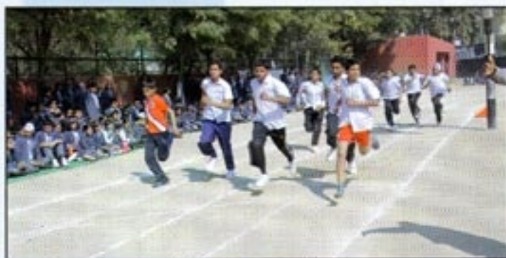
100m race seniors