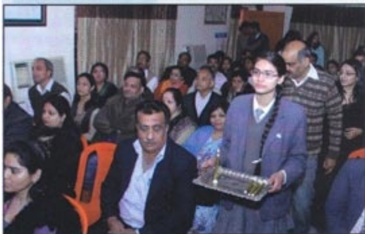
Parents witnessing the ceremony