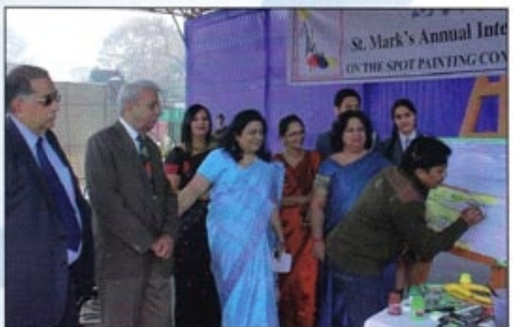
Creating a masterpiece