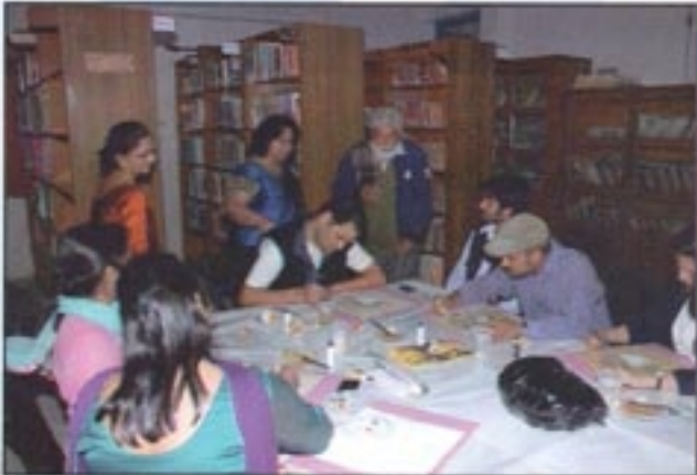
Coffee Painting workshop