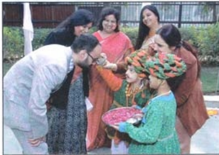
Welcoming the Manager