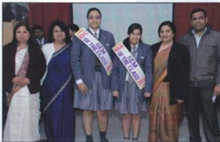
Gems of the class