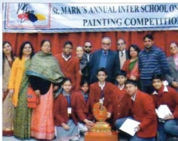
Raisina Bengali School with trophy (Senior Level)

This beautiful journey of colourful treat came to an end with the message that efforts in consonance collectively will once again weave the magic to evolve creativity next time again.