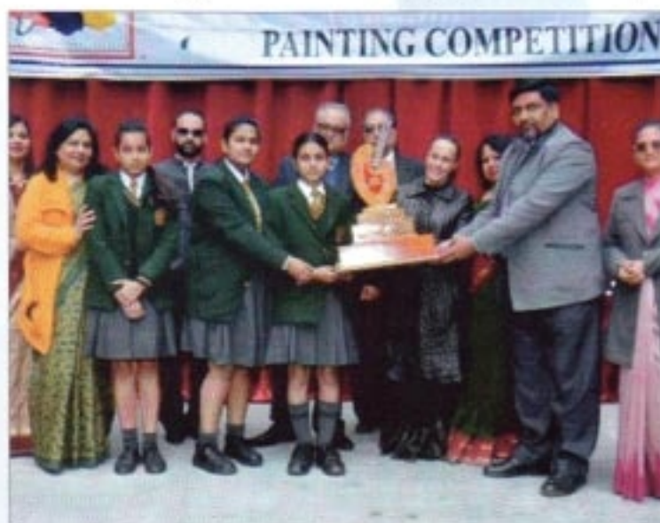
Delhi Police Public School with trophy for collage making