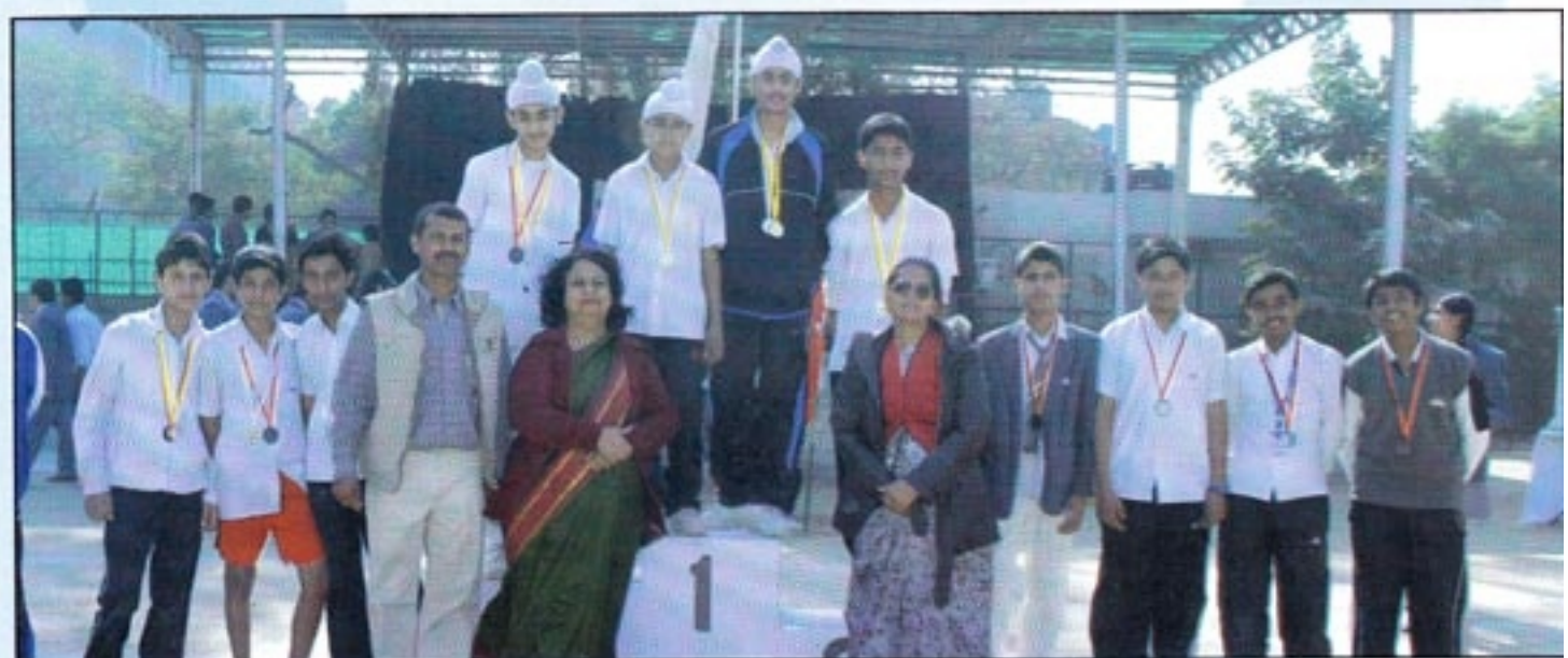
Winner Junior Boys