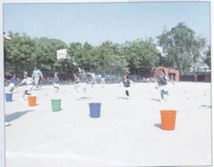
Filling the Basket