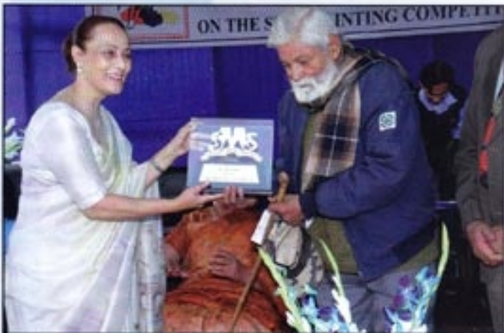
Director presenting a memento to Chief Guest