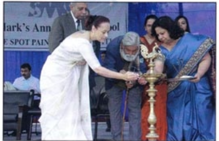
Lighting the ceremonial lamp