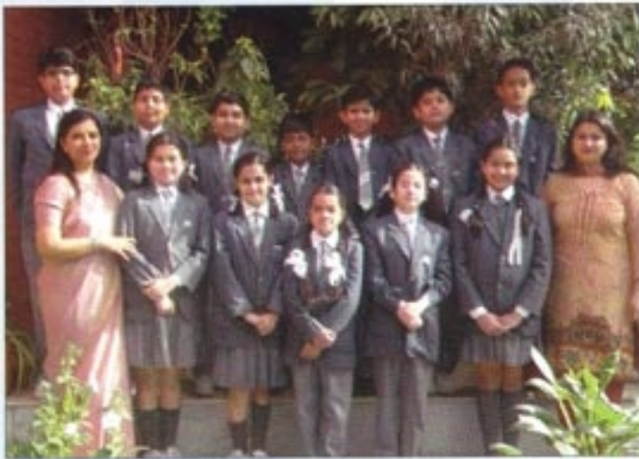
Primary Team of GVC

The link to reach our website is : gvc1116.gvc11.virtualclassroom.org