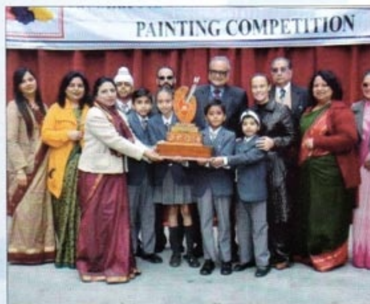
SMS Meera Bagh with the Junior Level Trophy