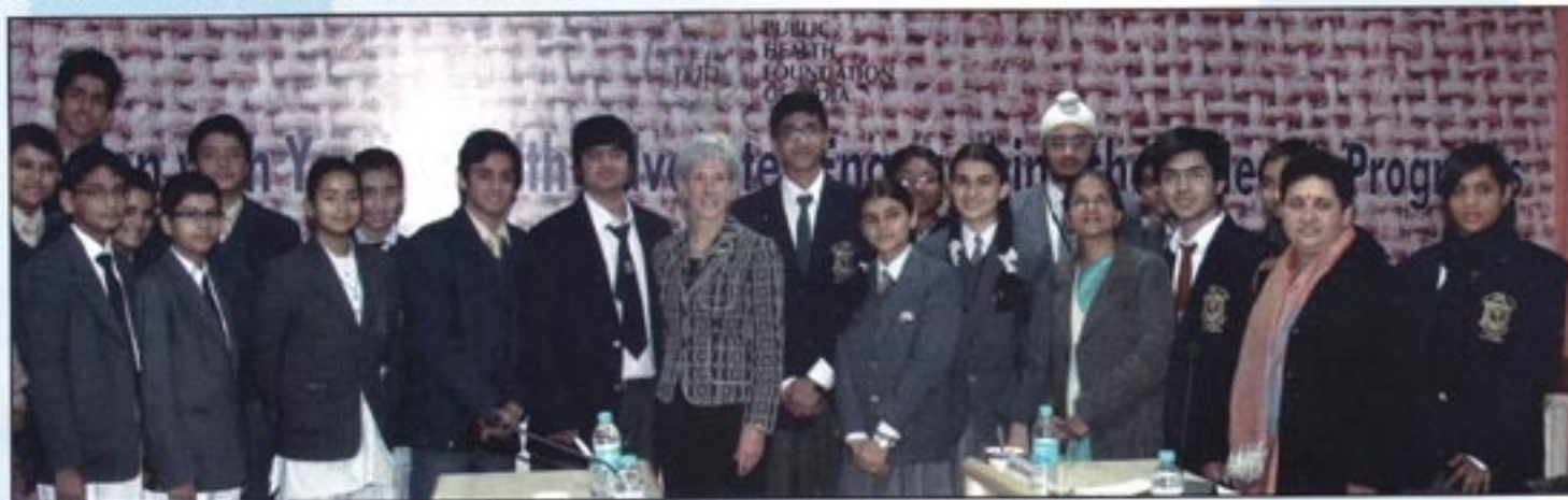
With Ms. Kathleen Sebelius (U.S. Secretary, Health Services)

Ms. Sebelius gave an empowering speech giving the example of President Obama who quit smoking and has led various ambitious efforts to discourage and prevent smoking among the youth.