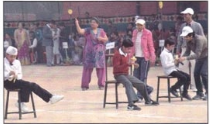
Banana Eating Competition