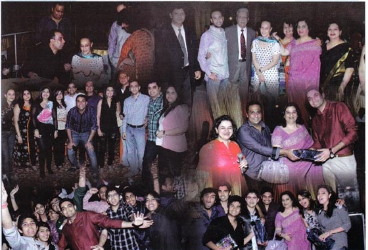
Party time - In school after school

The evening ended with On the spot dance competition & prize distribution for best dressed couple, best dancing couple etc. Sponsors were acknowledged for their support and lastly there was a thanks giving speech by the Vice Principal of 'Connections'. The evening came to an end with the promises of meeting again with all the more fun & enjoyment from team 'Connections'.