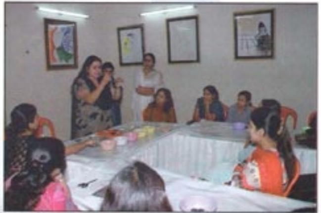
Jewellery Designing Workshop