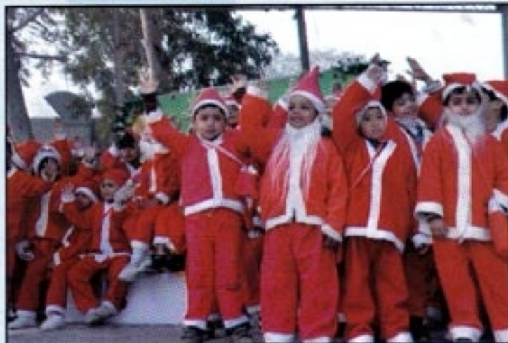
I am Santa

Christmas was celebrated in the school premises on 22 Dec.'11 for classes I-III and on 23 Dec. for classes IV -VI. Students of class IV staged a live crib depicting the birth of Jesus Christ. The choir group of class V sang Christmas carols. Games, music and a magic show were organized for the students. They were also given sweets and gifts by Santa. Children enjoyed the Christmas celebrations thoroughly.