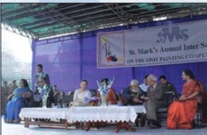
On the dias