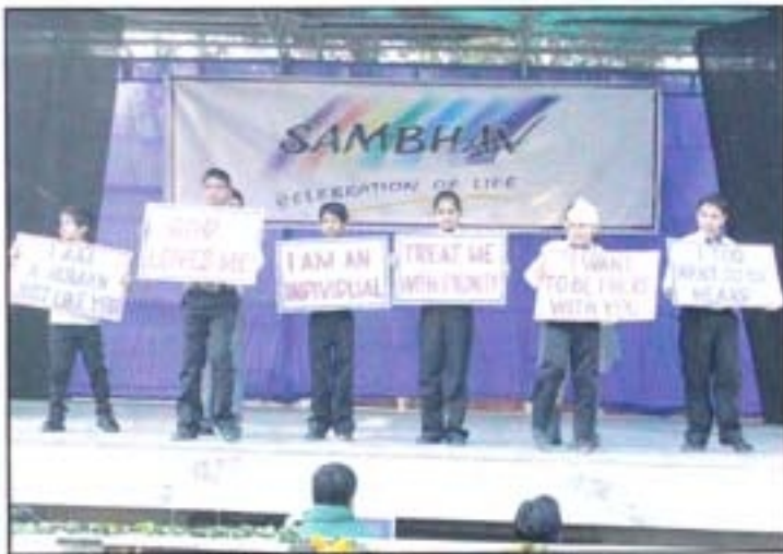
We are Special