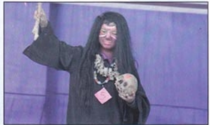
Fancy Dress competition