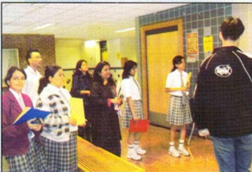
First day in Newton School