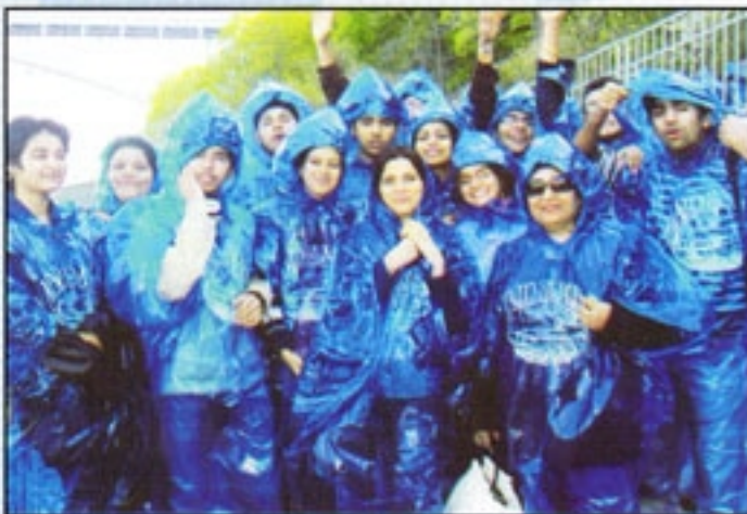
At the Niagra falls