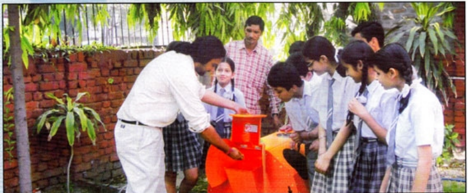
Rolly poly is being generously fed