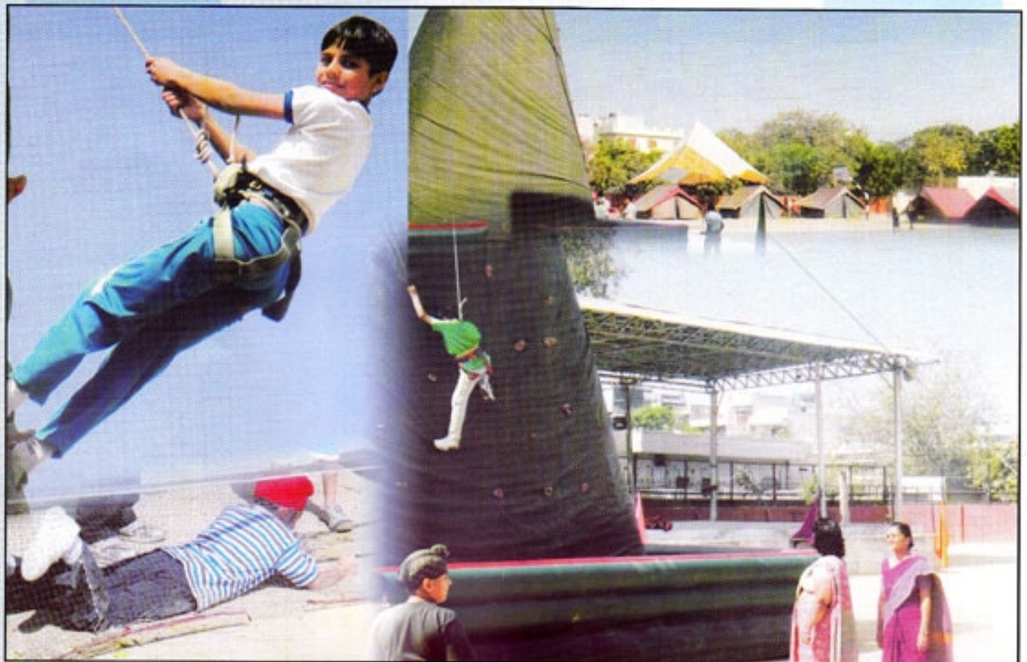
Scat camp – School gets transformed

Activities like puppet show, telegemo, etc. proved to be a stress-buster for all present.