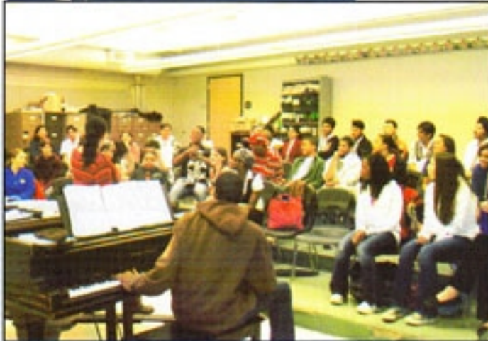
Reaching across to new friends and rhythms

The students got a great opportunity to meet the Mayor of Westport city and the Mayor of Boston where they got a chance to ask the congressmen, questions on American education, culture, political and economic situation and about the future plans of Student Exchange Programmes with India.