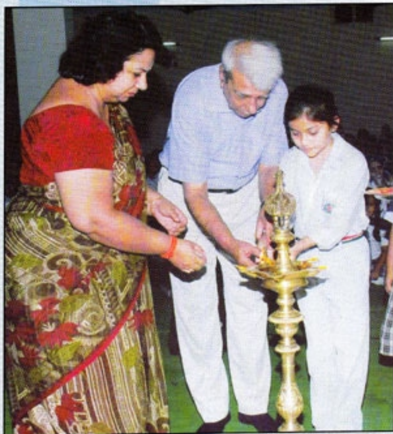
Lighting the ceremonial Lamp