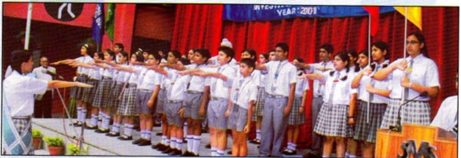
Taking a pledge

Effort and hard work constructs the bridge that connects your dreams to reality