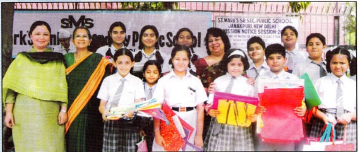
Young students proudly holding their self made paper bags.

The aim to organize such an event was to contribute our bit to society and make everyone conscious that Earth is a special planet and we all must save it. Rolly Poly a decomposting machine was also installed