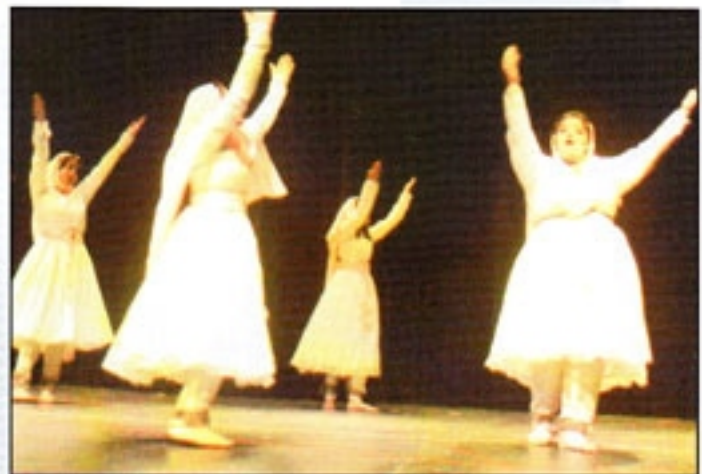
Indian show case - Sufi Dance Recital