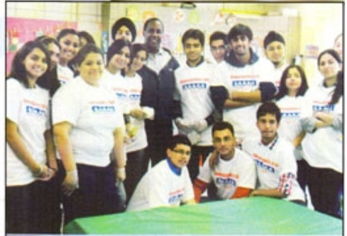
Community Service Day in Boston.