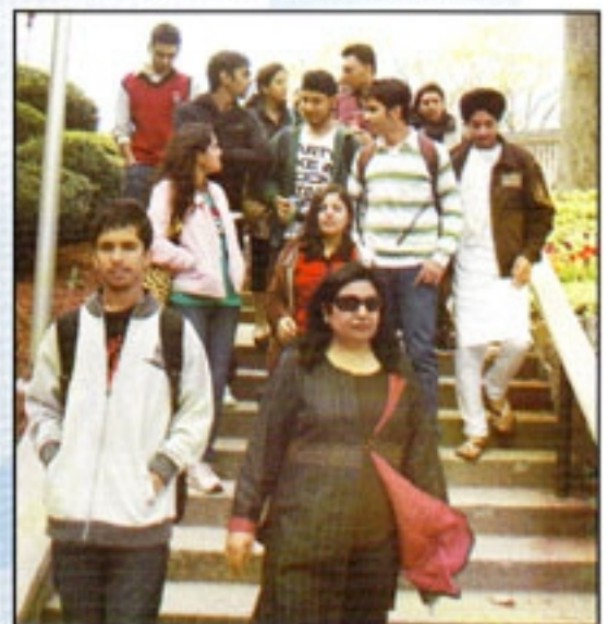
Leading the way