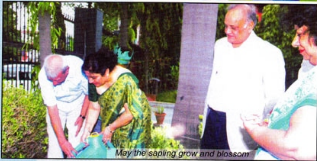
May the sapling grow and blossom

"Meri Dilli, Meri Yamuna" an initiative of the Art of Living Foundation and the Times NIE , to create an awareness to clean Delhi before Commonwealth Games.