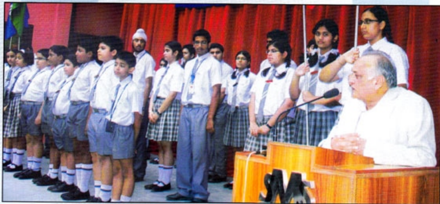
Word of encouragement by our chairman inspires the budding leaders