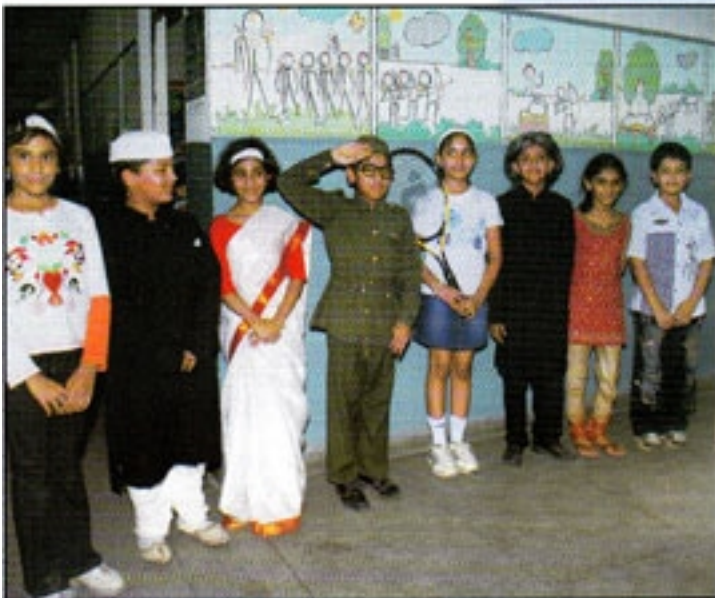
Std. V students dressed as Eminent Indian Personalities