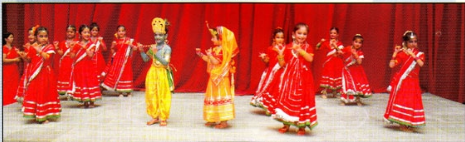
Primary students in Ras-Lila.

To Mark the 62nd Independence Day, various classroom activities were held which saw an enthusiastic participation from the primary wing.