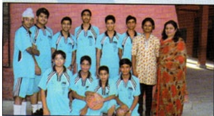
Boy's Sub Jr. Basket Ball Team