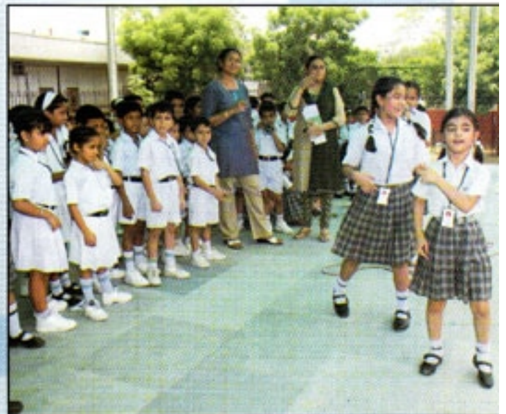
Learning the nuances of theater