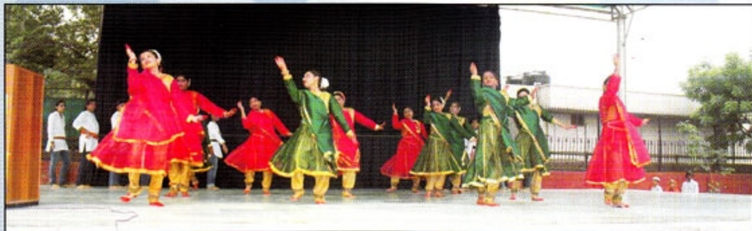
Kathak dance recital