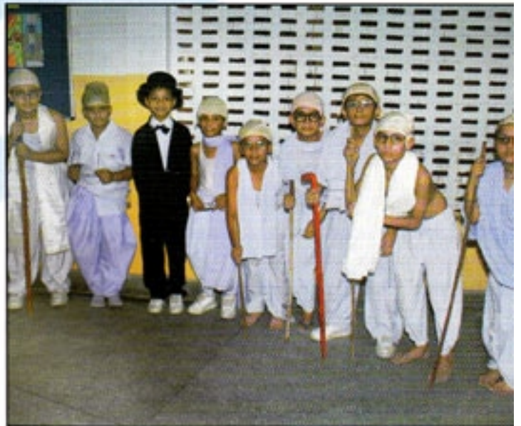
Gandhi- Std. IV students remembering Bapu