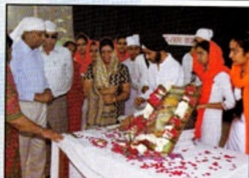
Offering 'Bhog' to Guru Nanak Dev Ji

The function ended with the distribution of 'Kadah Parshad' to all those present.