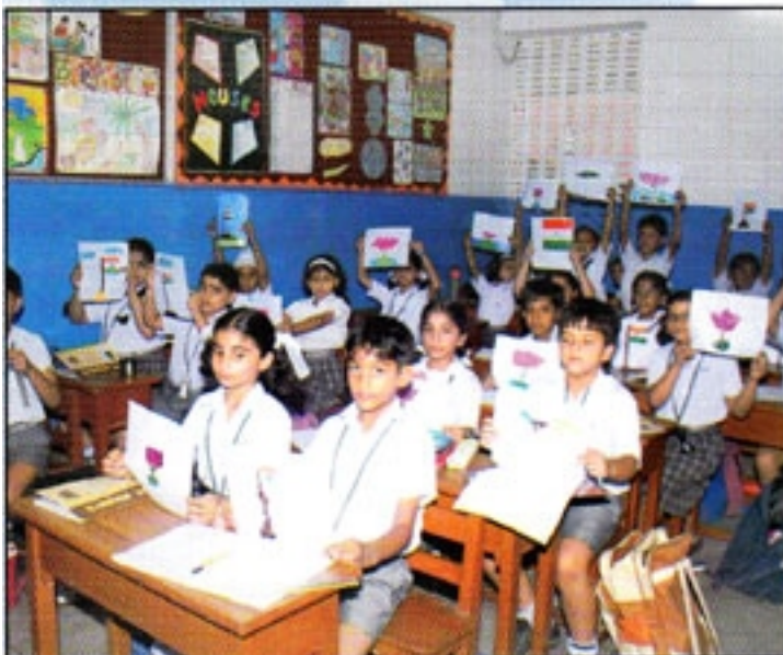
Painting our National Symbol