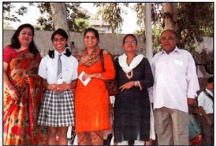
Winner of Ekal Shlokosangeet