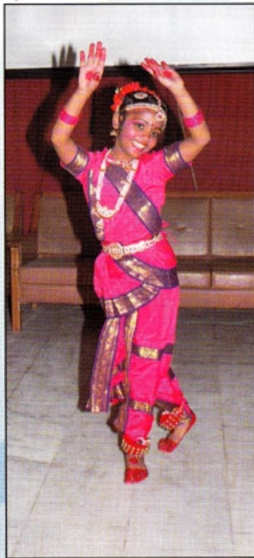
Primary children showing their talent