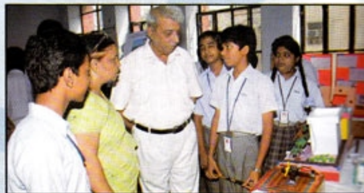
Students explaining their working model