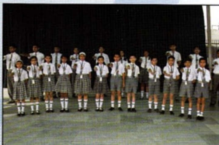
Office Bearers taking oath