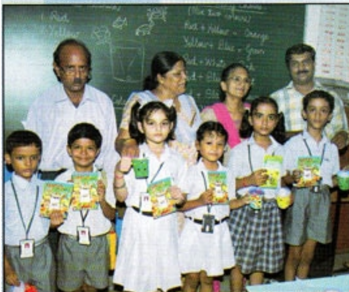
I am the winner ! (Young Artist Club)