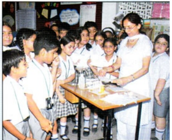
Science Activity in Experiment Club