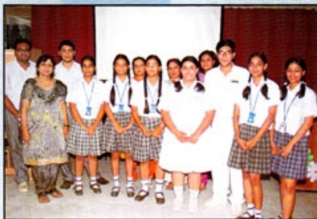
Winners of Recitation and Public Address