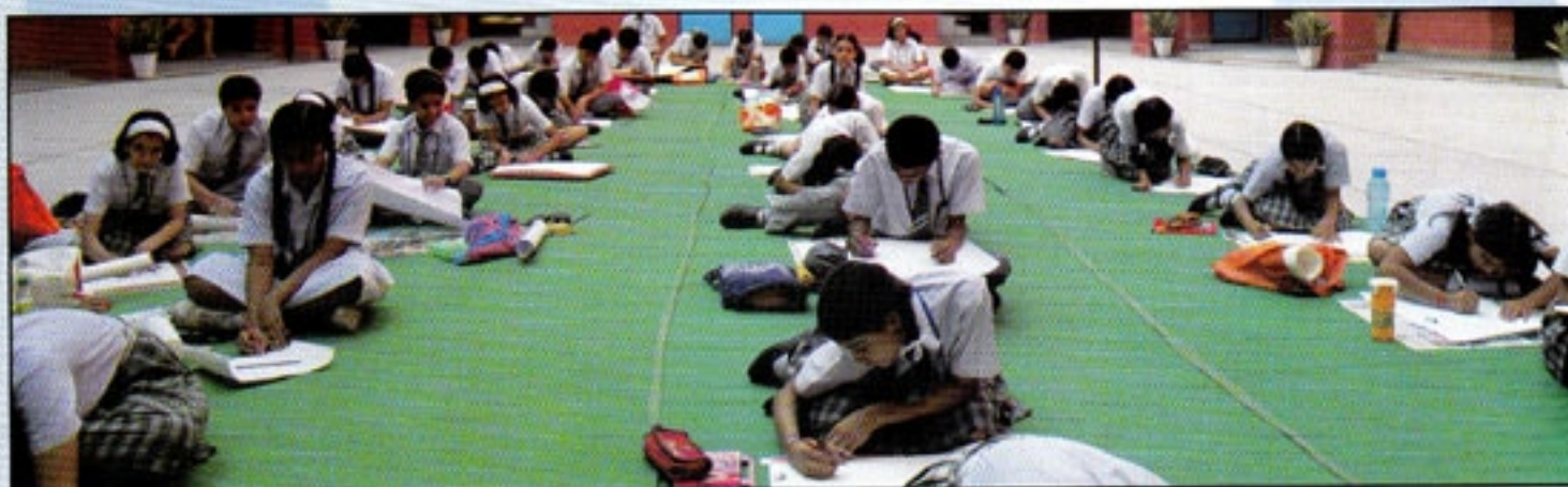
Students making posters

A vigilant peaceful march of students was organized in Janakpuri to enlighten the neighbourhood to make them aware about the ills which are present in our society such as air, noise and land pollution caused by the use of firecrackers made by young hands. This campaign was full of joy mixed with concrete solutions to the problems which supported the purpose. Students gave diyas & pamphlets to the residents to spread the message of "SAY NO TO CRACKERS". It helped both the students as well as the community to understand the cause. A poster & rangoli making competition was organized with the theme of "ECO FRIENDLY DIWALI" to show solidarity to save the environment.