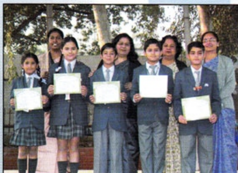
Crime Reporting II prize winner