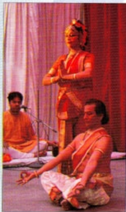
Maestros in 'Dhyan Mudra'