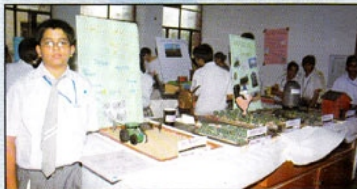
Presentation on Agricultural practices