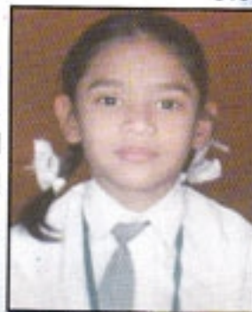
Kanika III A