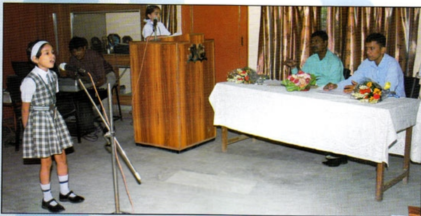
Music gives a new life