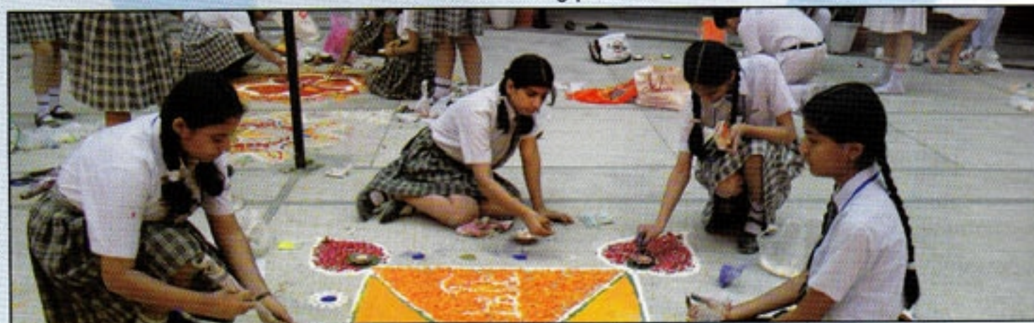
Ban crackers and bring art to your life