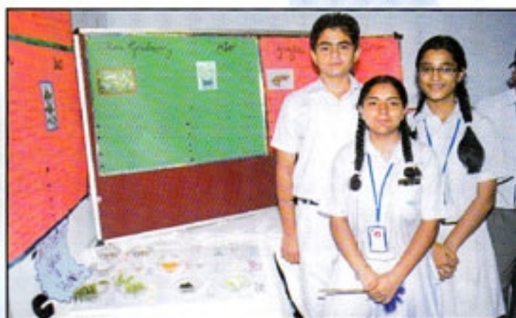
Class XI students with different spices