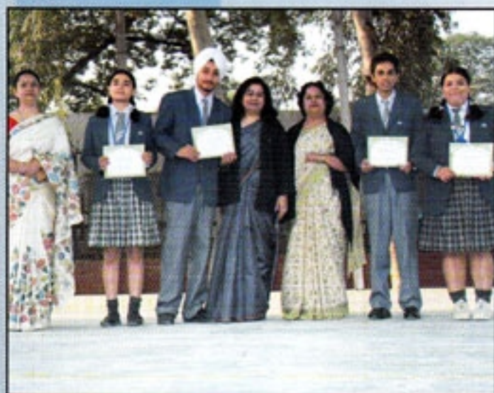
Reporting a sting Operation I Prize winner