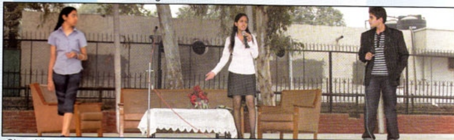
Class XI students enacting the play Mother's Day

To give a platform to budding artists, Ehsas- dramatic society of our school organized plays wherein classes from VI-XI put up plays based on lessons from text books. Prose was transformed into scripts and plays were staged for effective classroom learning. Popular plays like Mother's Day, Meera Bai, Chawal Ki Roti & Panch Parmeshwar were staged.