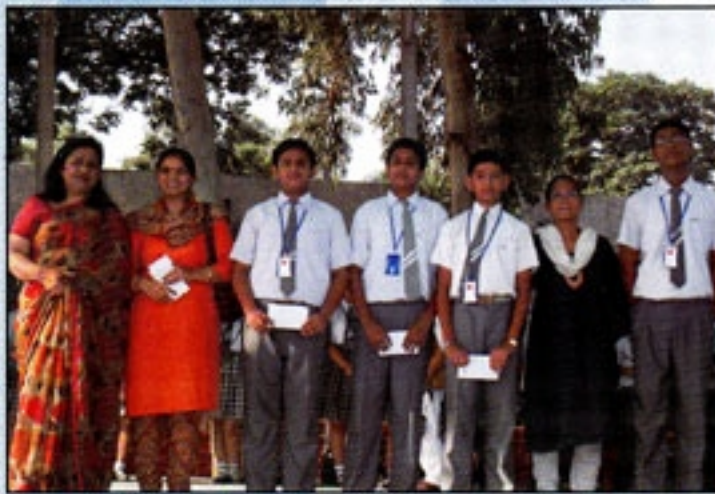
Winners of Sanskrit Shlokocharan