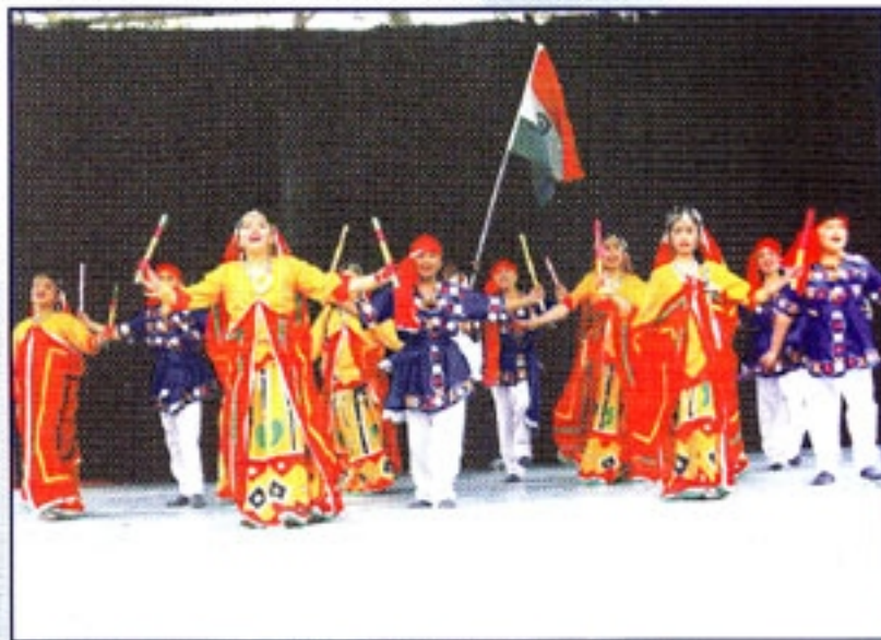
Students presenting dance.