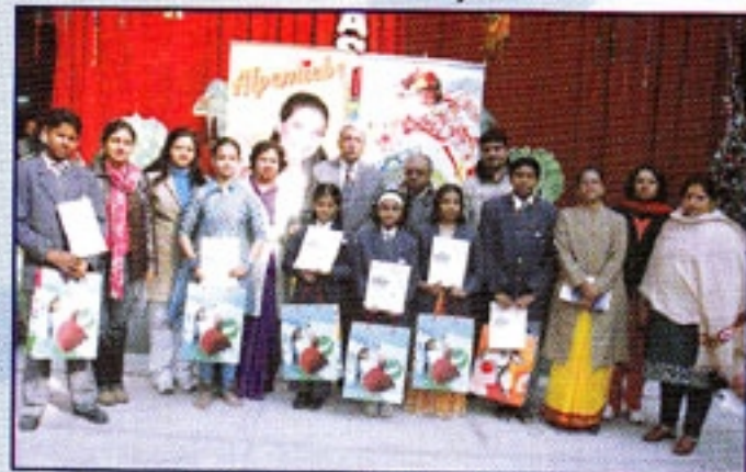
Winners of Pogo Talent Hunt.