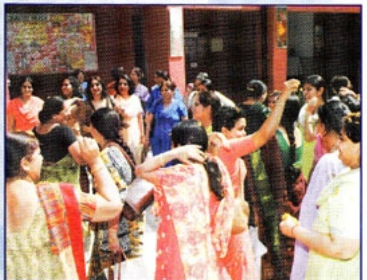
Staff members enjoying Holi festival.