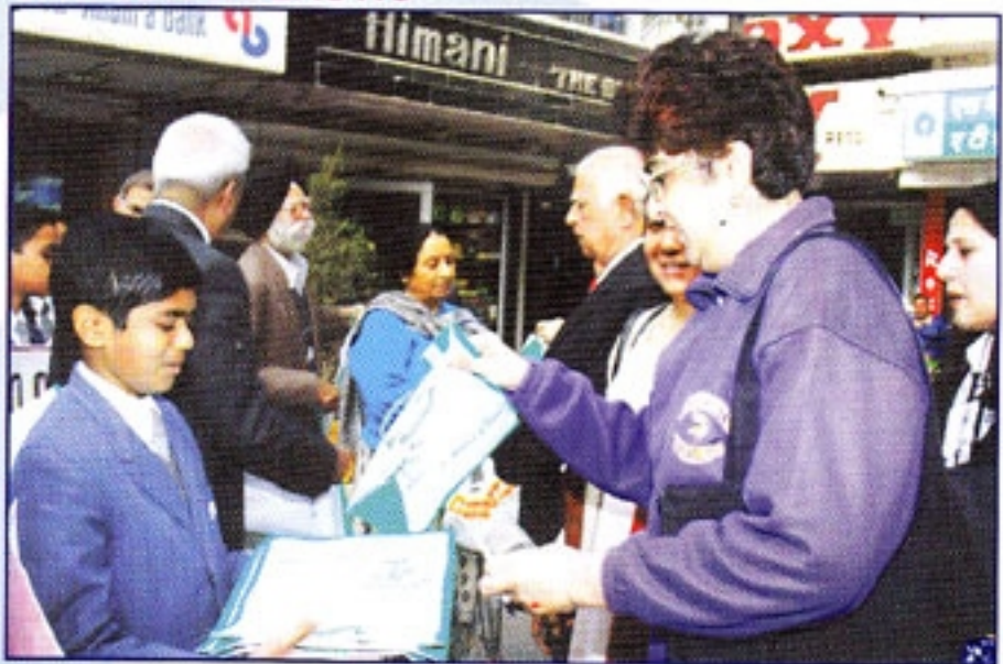
Making citizens aware of goodness of eco-friendly products.

At every juncture the members of the Eco-Club took pains to explain the harm being done by the regular and growing use of plastics.