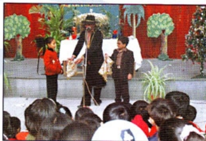
Learning new tricks ! Participating in magic show.

Christmas was celebrated with great enthusiasm and excitement as a testimony to the birth of Lord Jesus and the onset of Christian's charter where paradise restores the opening of Heaven & closure of the gates of Hell. It was party time for students of classes I - VI on 19th & 20 of Dec. 2007 in the school premises. Children had smiles on their faces and joy in their hearts irrespective of their religions and languages. They enjoyed singing Christmas carols, playing games and the Magic show which was organized at school. Santa Claus distributed gifts dressed in his red attire to mark the blessings with the advent of Christ the Saviour and Son of God. The festivity ended with Prize Distribution and sumptuous snack party.