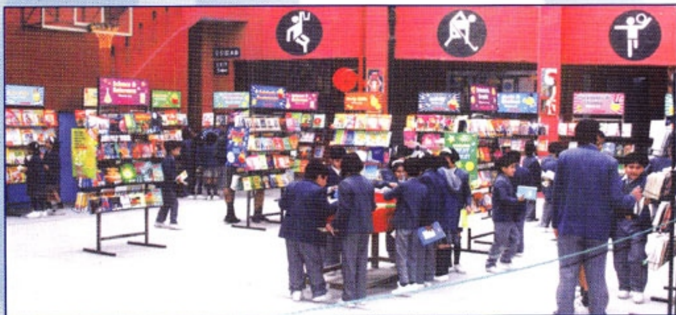
In the company of books - children browsing through books.

Work done by the students was displayed on the P.T.M.. It was a wonderful variety of aspirations and imaginations displayed on canvas. A cloth graffiti was put up for writing thoughts slogans or quotations on books. The three day fair provided a wonderful opportunity to the children to browse as well as buy from an apt choice of fables to modern theories of History & Science which help not only to gather information but also to apply them whenever necessary.