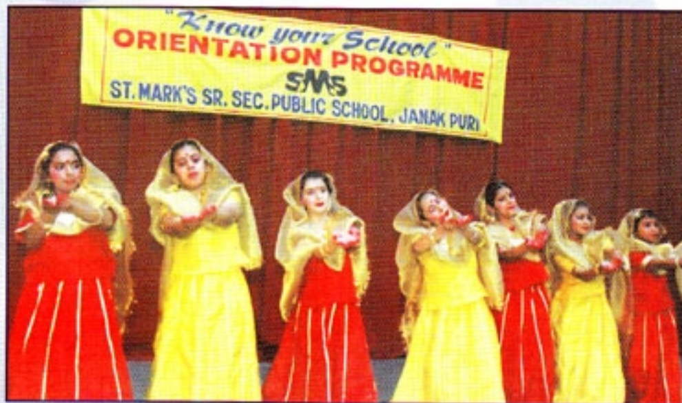
Invoking blessings of God - Children presenting a devotional song.