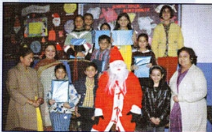
Santa Claus brings smile on faces.