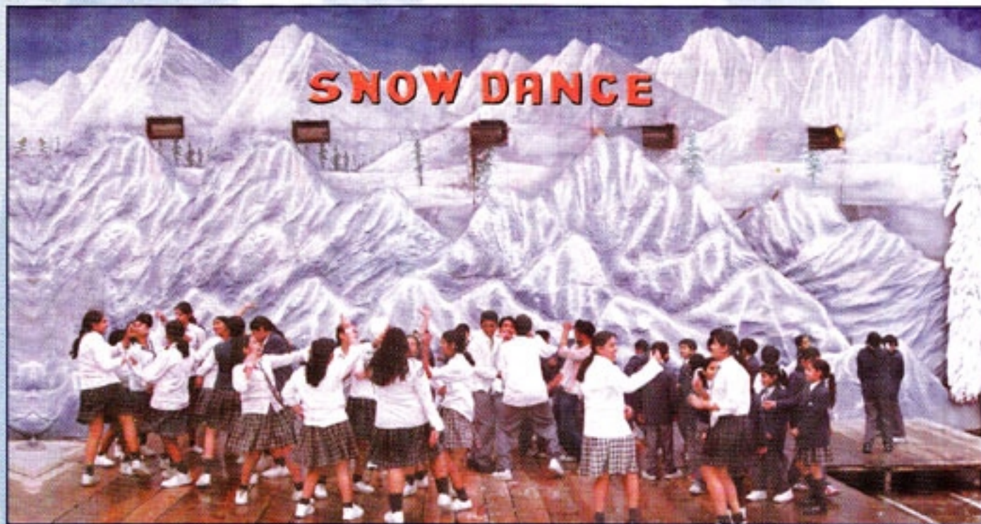
It's the time to disco - students dancing to latest tunes.

Our school organized the School Picnic for all from 5 th - 12 th Dec. Students of classes I to XII went to Appu Ghar alongwith their teachers to take a day off from studies. It was a perfect picnic spot for the students as they enjoyed a variety of rides, alongwith puppet show and snow dance thus letting down their hair giving vent to their joys and illusions.