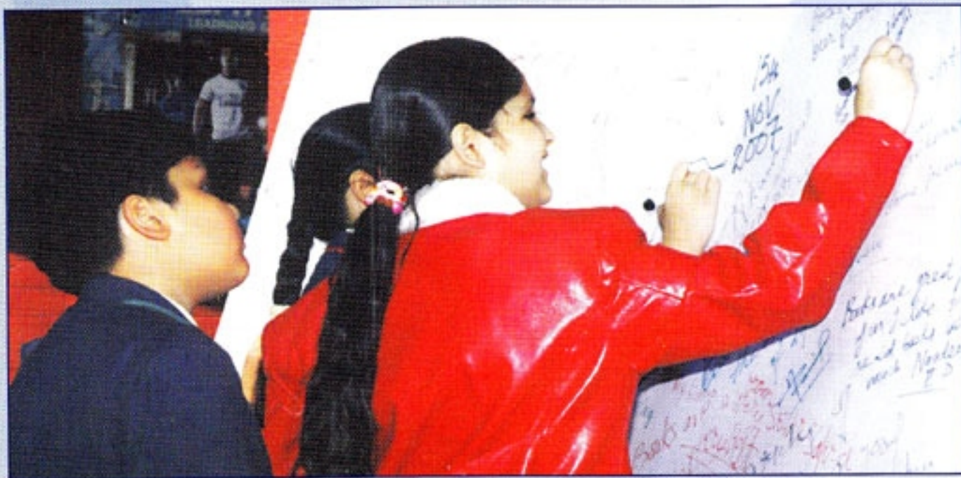
Students leaving their signature on graffiti.