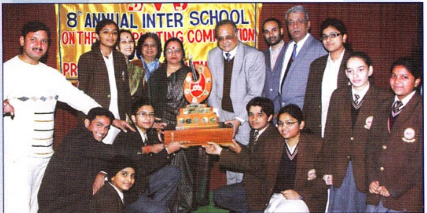
Maharaja Agrasain Team bagged the Rolling Trophy.