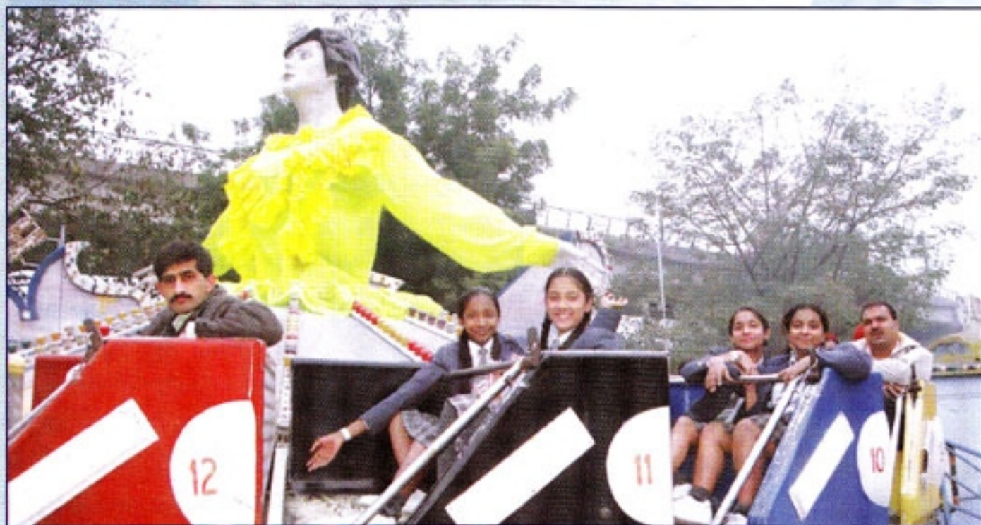
Students enjoying ride in Appu Ghar.