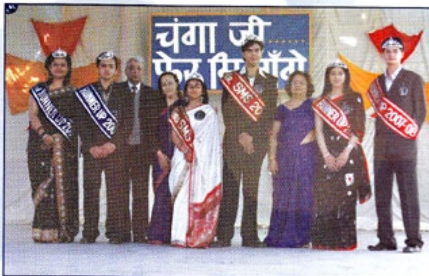
We are cut above the others - Winners of Mr. & Miss SMS titles.