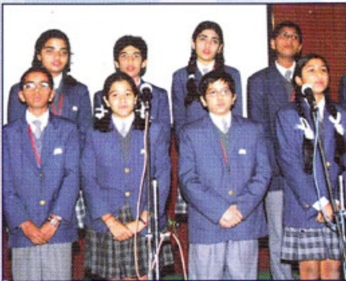
Students presenting a welcome song.