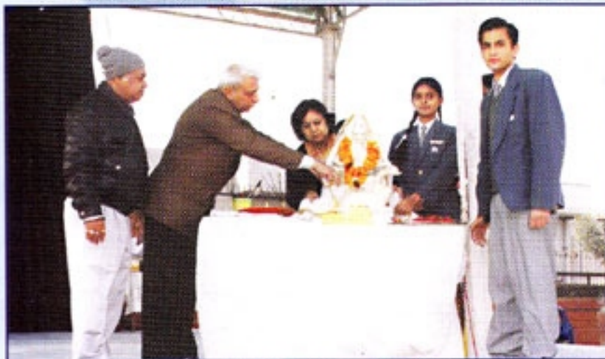
Floral tribute to Ma Saraswati on Basant Panchmi.

Basant Panchmi marks the end of harsh winter chill and arrival of spring; the blooming of flowers & chirping of birds brims the earth with sweetness of the spring season. This beautiful occasion was celebrated on 11 th Feb. at our school. The celebrations began with Saraswati Vandana followed by floral tribute to Ma Saraswati. A culture programme of song and dance by students of class V followed the floral tribute. yellow was the colour of the day, the entire school looked extremely pleasant and colourful with all the staff members dressed in different hues of the same colour.