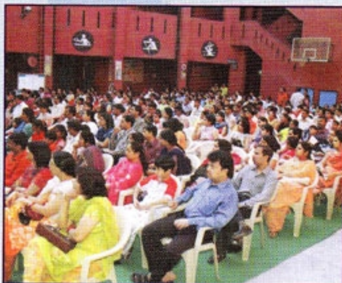
Attentive parents listening to the guidelines.