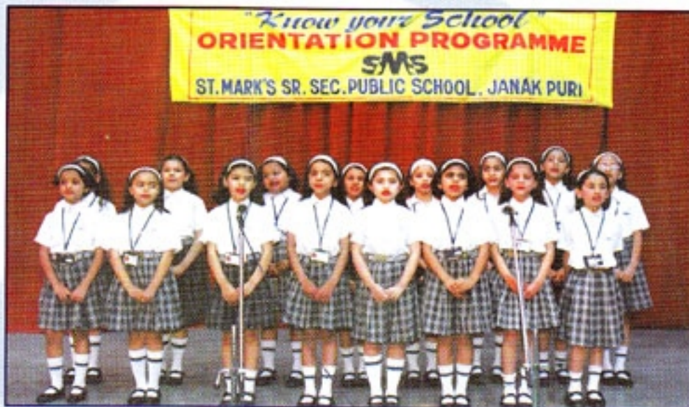
Students presenting a welcome song.