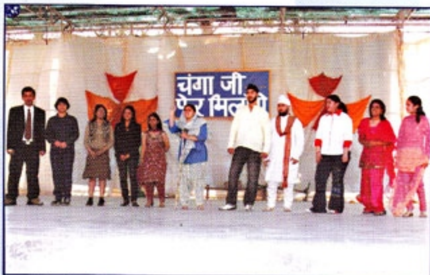
An interesting play with a message was put up by the students.