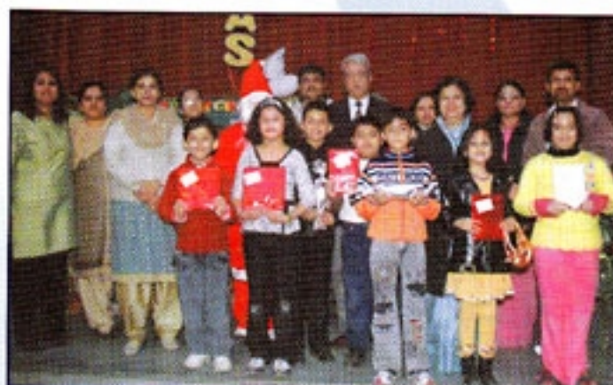
Children with their christmas gifts.