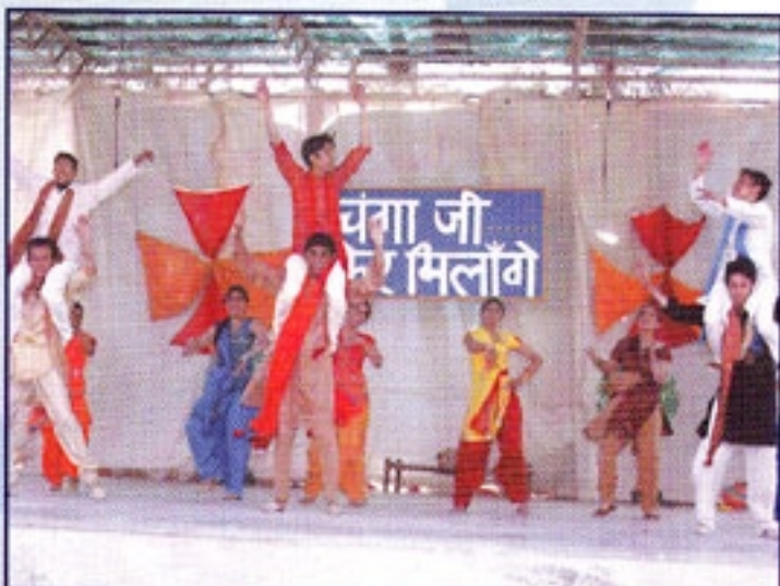
A vibrant and colourful Bhangra delighted the audience.