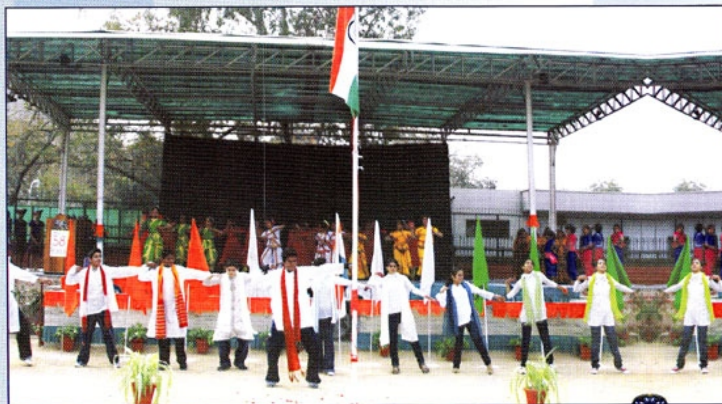
Students presenting a colourful dance on the occasion.