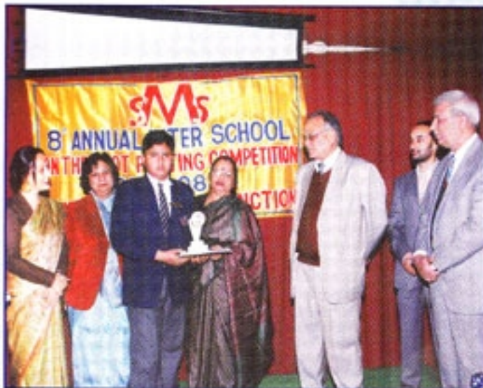
One of the winners of 8th on the spot painting competition.