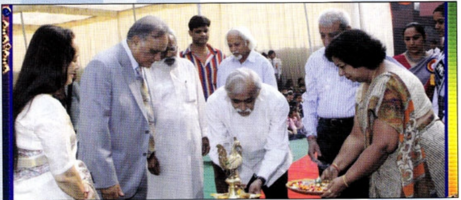
Chief guest along with the guest of honour lighting the lamp.