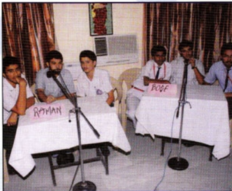
"Raman" and "Bose", the two teams all set to answer questions in the science quiz.