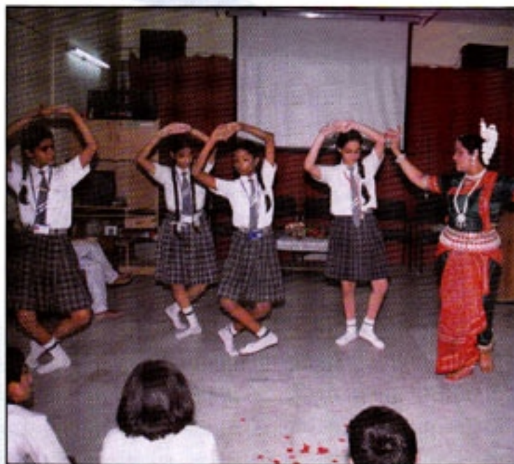
Keen learners : girls of Class XI learning the perfect posture.