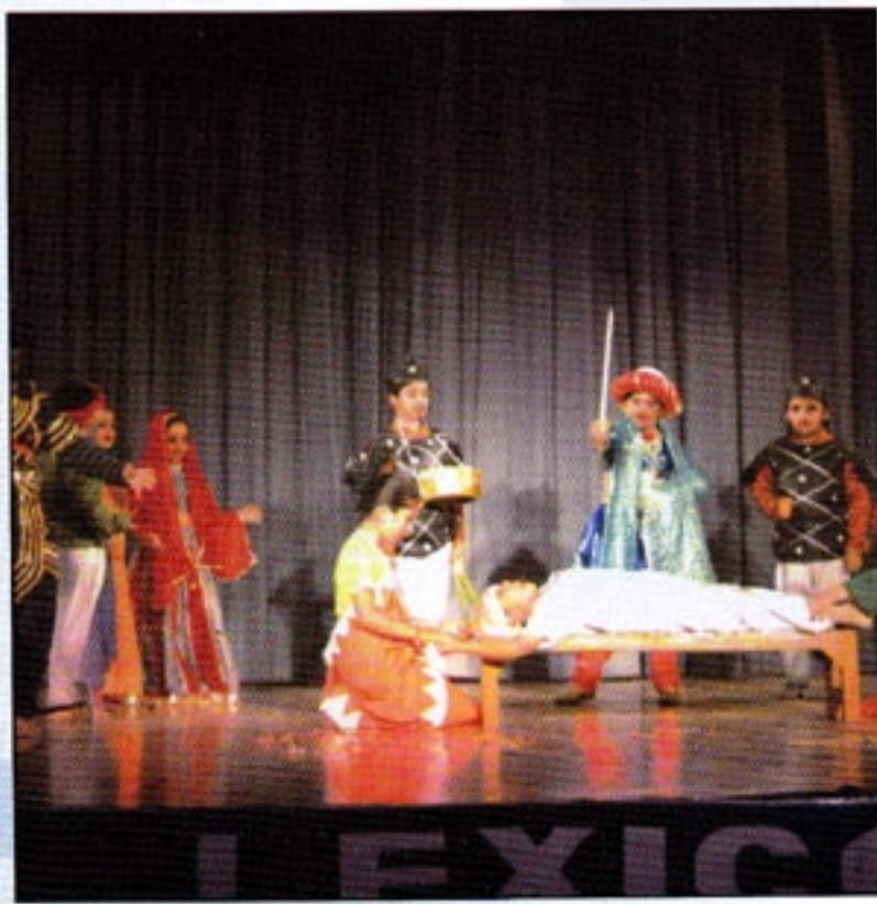
Students (primary section) presenting their play. They bagged 2nd prize