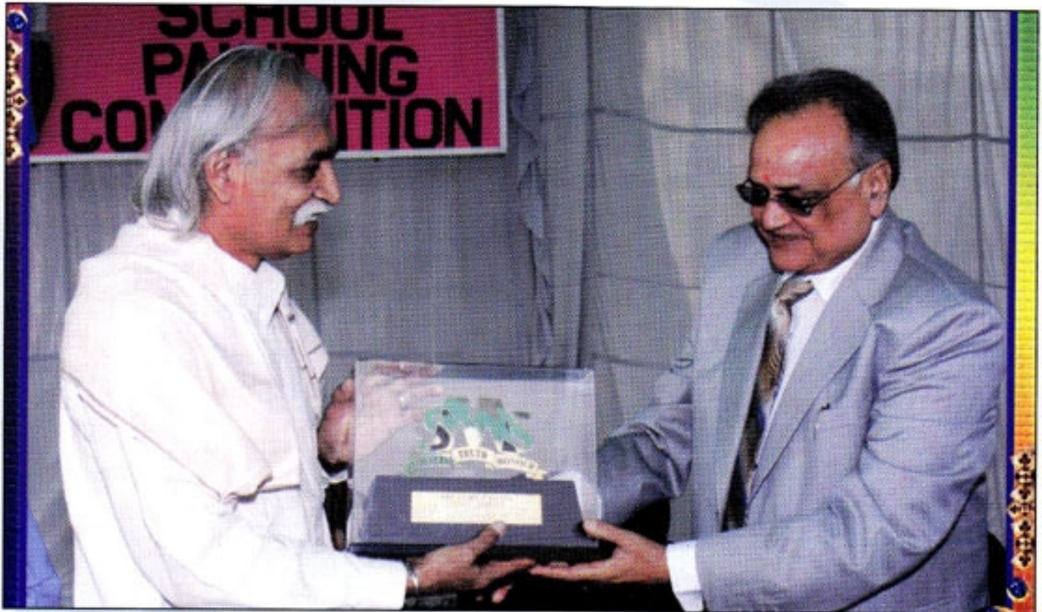
Our respected Chairman welcoming the chief guest on the occasion of school painting competition.