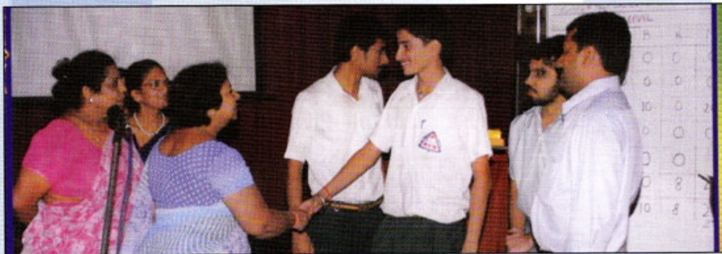
Our vice principal shaking hands with winners (SFS, Janakpuri) of science quiz.