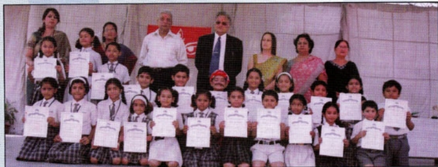
Winners of Inter Class Hindi Recitation Competition.