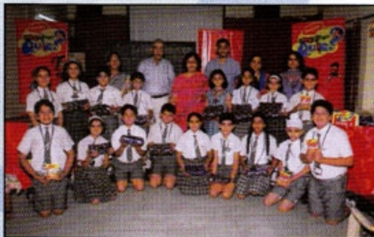
Winners of Maggi Quiz