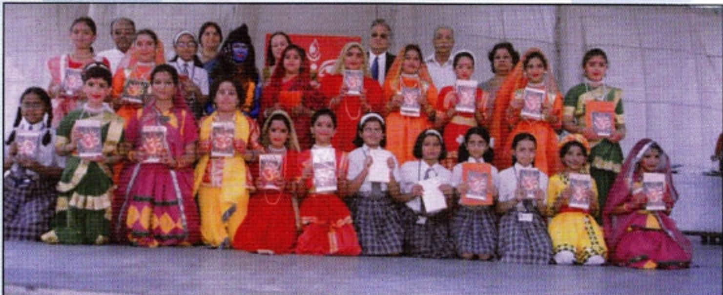
Prize winners of folk dance competition.