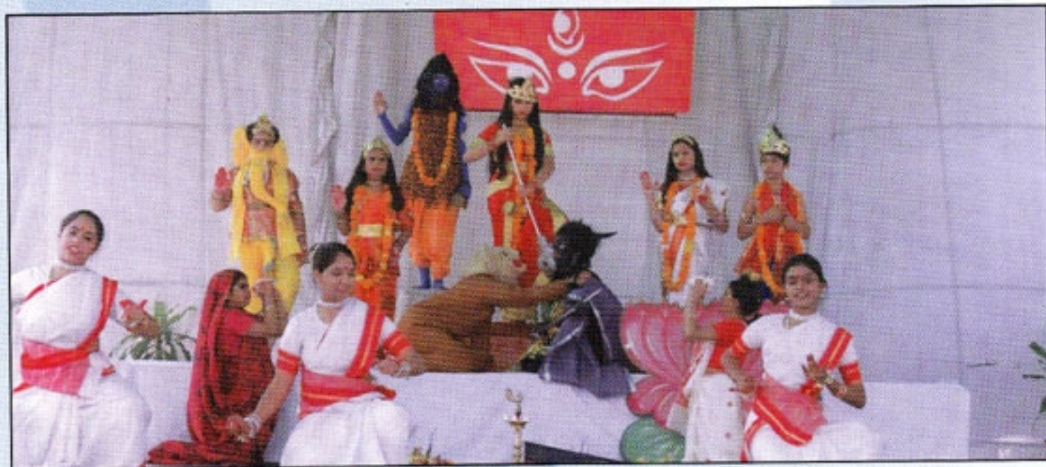
Celebration of Durgapuja

The Management, staff and students of our school came together to celebrate Durga Puja in all its traditional fervour on 12th Oct. 2007. Students of std. V were dressed up as Maa Durga and her four children alongwith Lord Shiva and the evil Mahisasura. Her home-coming, after defeating the demon Mahisasura, was celebrated with dances and aarti by the students of VIII and IX std, on the Mahalaya Chants of 'Jaago Ma' and 'Baaj lo Maa Tomar'. The mesmerizing Dandiya Raas set the mood upbeat.