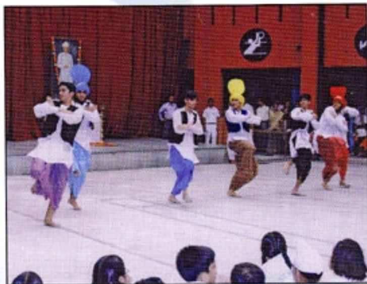
It is time to entertain teachers : students presenting "Bhangra" on Teacher's Day