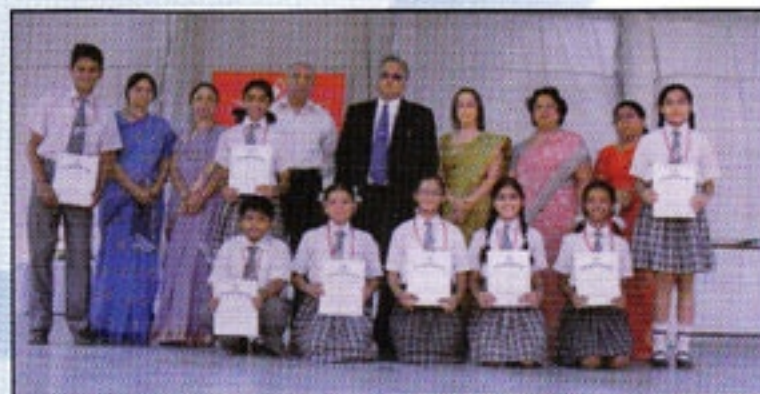
Winners of Inter Class Sanskrit Recitation Competition