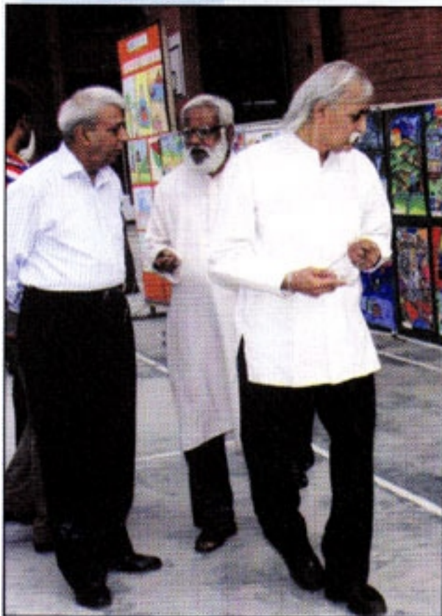
Chief Guest going through the picture gallery.