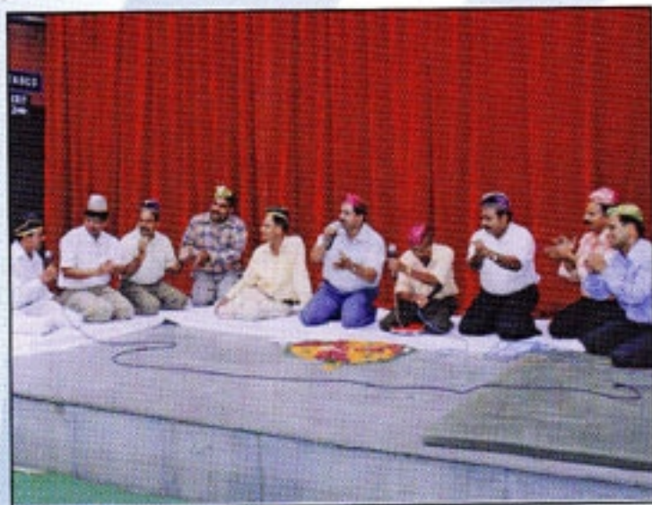
Teachers presenting an item on Teacher's Day.

It was followed by a cultural programme presented by students. In the latter part of the day, the teachers had a gala time enjoying their programme in which a few of them presented various cultural items. The sumptuous lunch was hosted on this day by the Management of the school for the staff.