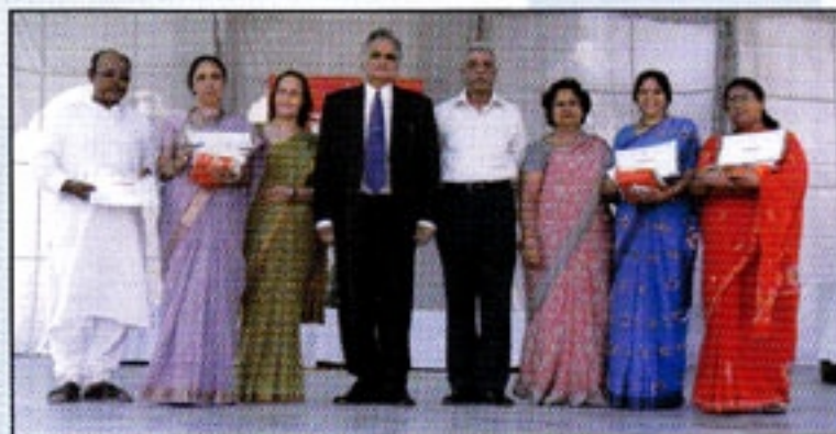
Teachers incharge of activities in Sanskrit.