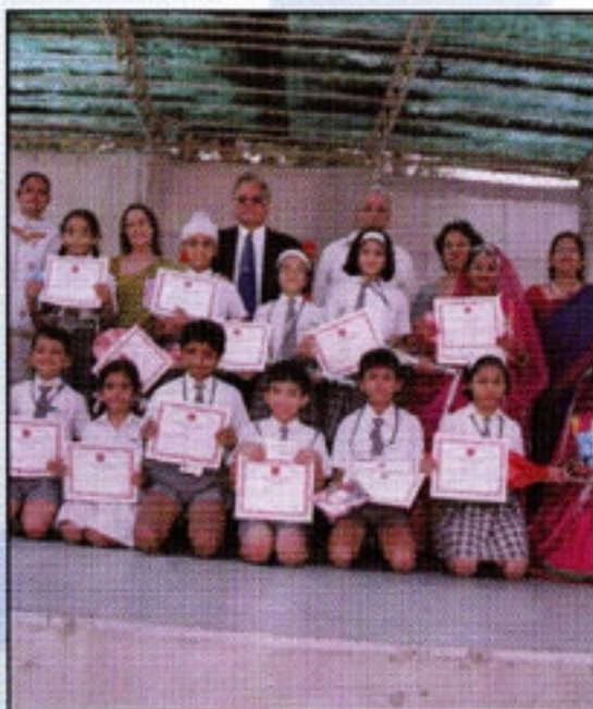
Winners of Primary Athletic Meet