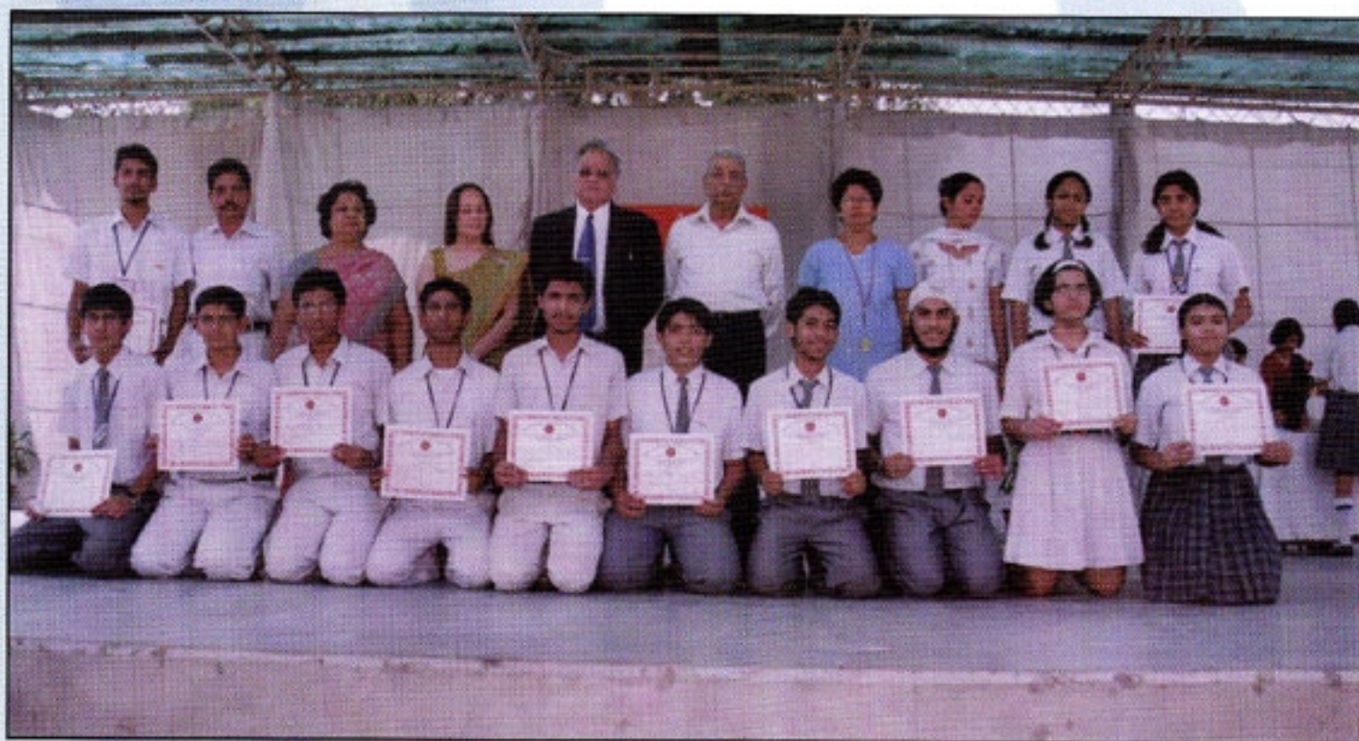
Winners of Games & sports (Zonal)