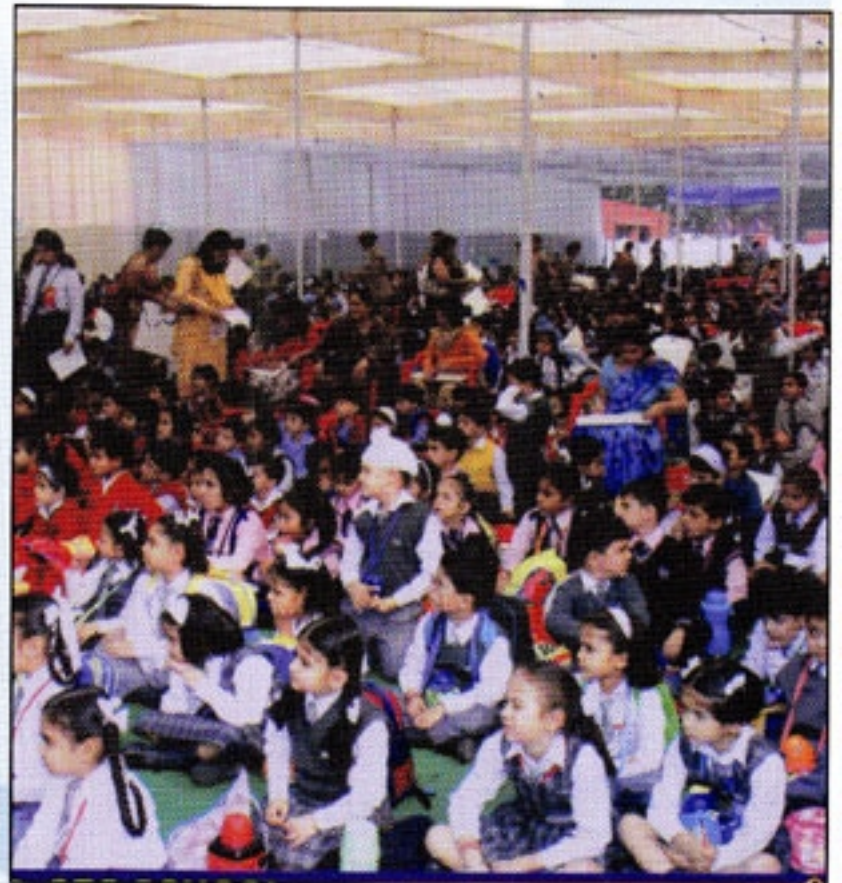
"All set to put their strokes on canvas" little ones waiting anxiously to draw and paint.