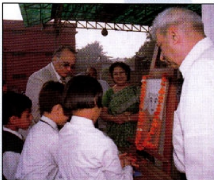
A tribute to Chacha Nehru