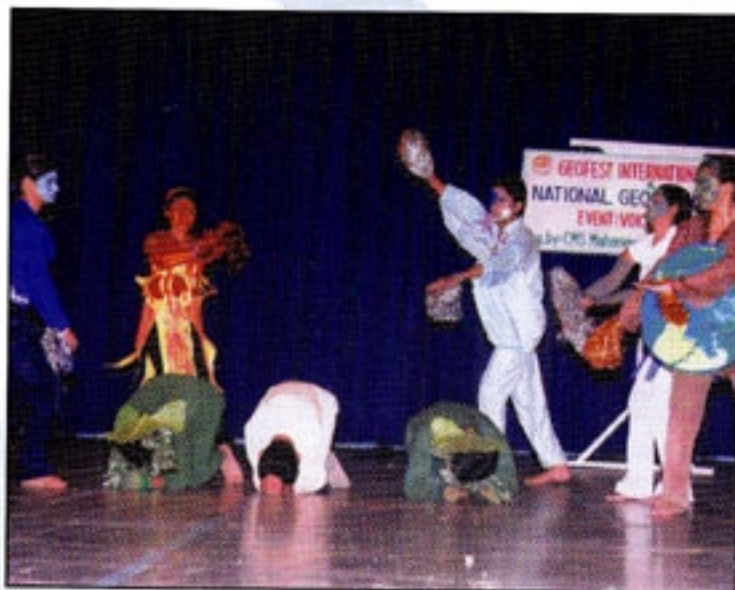
Participants of voice & vision presenting their concept.