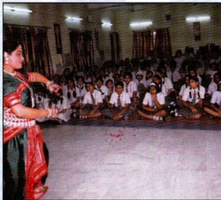
Workshop on dance in progress

"Revolt of 1857" week was organised by the Indian Express, daily newspaper subscribed by the students of XI class in the month of Sept. Three workshops namely, Journalism (18 Sept.) theatre and Dance were conducted in the school. It was an enlightening and lively experience for both the students as well as the teachers.