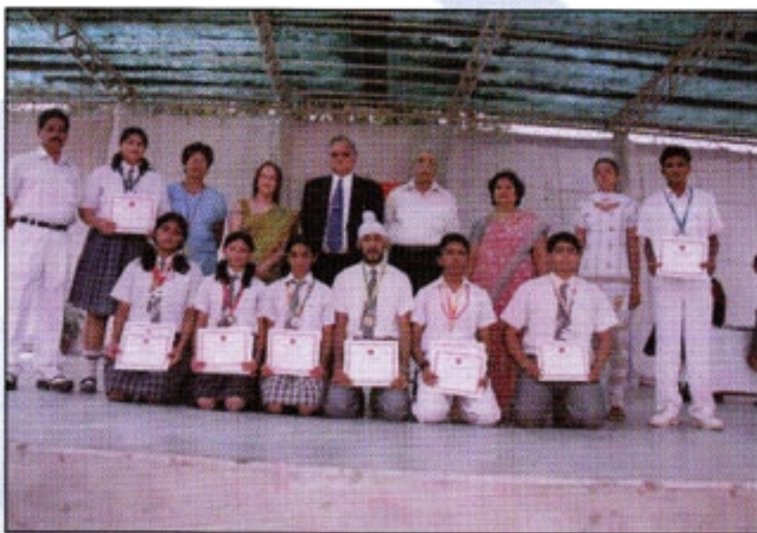
Winners of Zonal Athletic Meet