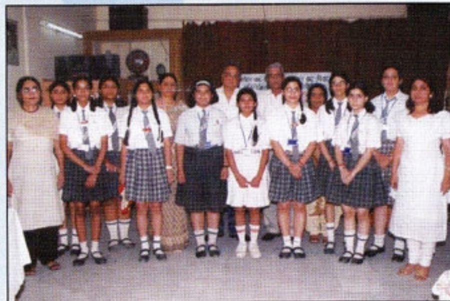
Winners of Inter House Hindi Debate competition

Inter School Hindi Debate, under the Debating Club of the school, was organised for the Senior Students of classes XI & XII of September in the month.