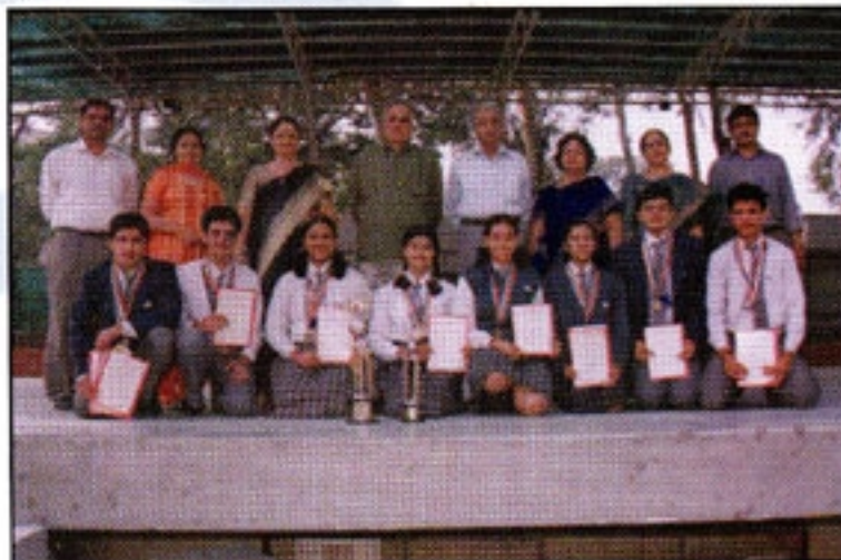
Winners of Geofest Event (Voice & Vision)

Students learnt a lot through the interaction with students of other schools and after experiencing a healthy educative competition they are matured into confident ones.