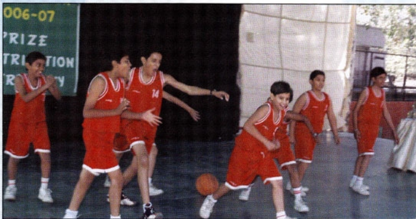
'Let's win' students presenting an exuberant performance

Our school students from VI-VIII classes presented a wonderful choreography on the theme "Ek Hi Aim" in My School Rocks competition at the Air Force Auditorium on 16th Nov.' 06. The event was organized by the Walt Disney T.V. International (India). A large No. of schools participated in it.