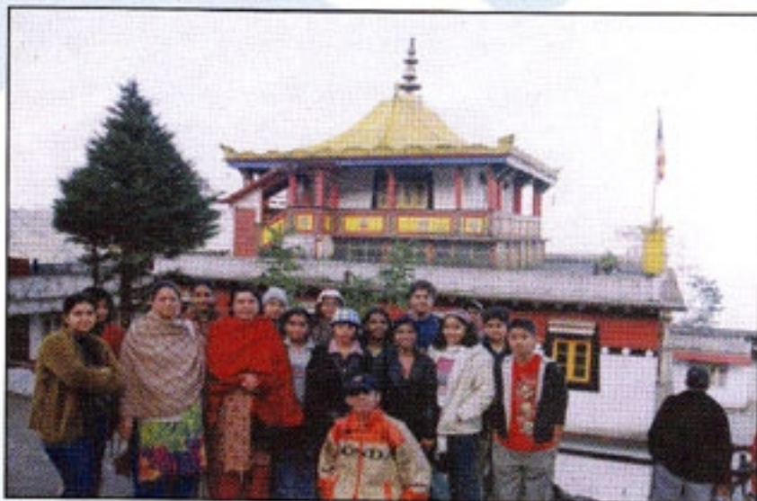
In the lap of nature

Sunset at Sunset View Point enchanted the students. The students gained a great deal of knowledge of the history and rich cultural heritage of Rajasthan.