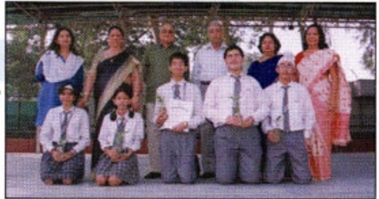
Members of 'Vasudha' Eco Club