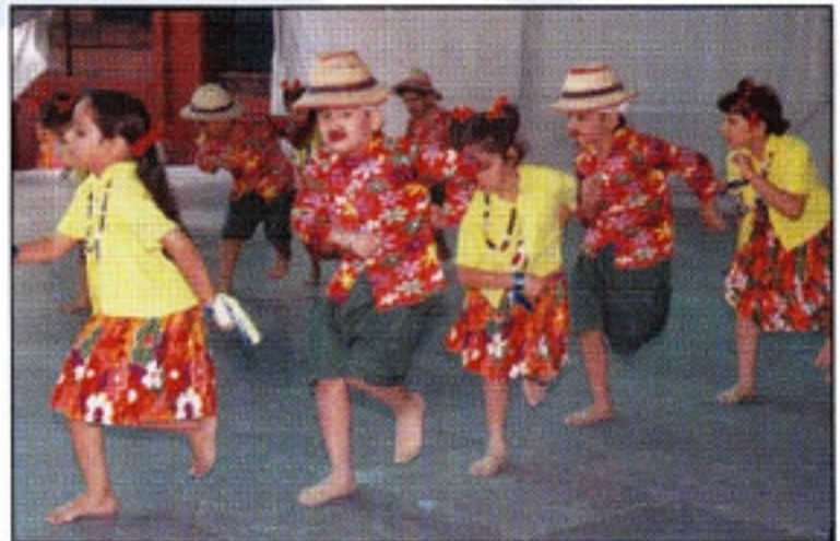
Winners of Folk Dance Competition (Group I)