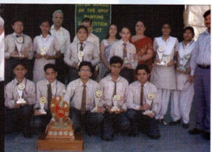
Team members of Maharaja Agrasaein School with their trophy.