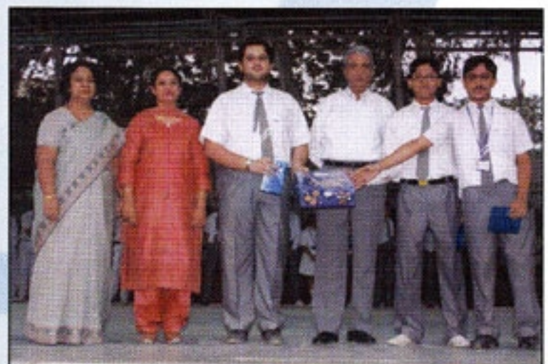
Winners of NIE Quiz