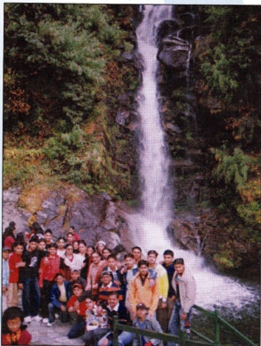
Against a scenic backdrop students enjoying their trip