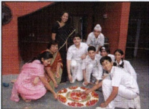
Winners of Rangoli competition

Next day a Rangoli Making Competition was held for classes VII, VIII & IX. The Rangolis were made with eco-friendly colours & materials like atta, haldi, mehendi, flower petals etc. The result was as follows.