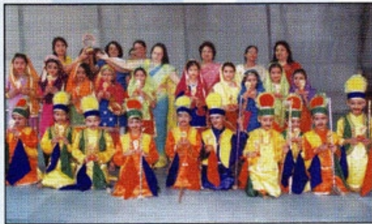
Winners of Folk Dance competition (Group II)

In group I, Goan dance presented by E & F sections of class I and in group II Punjabi Bhangra presented by sections E & F section of std. III won the 1st position in their respective categories.