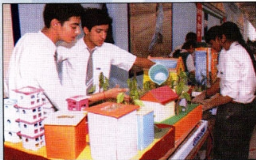
Model on "Technique in Rainwater Harvesting"