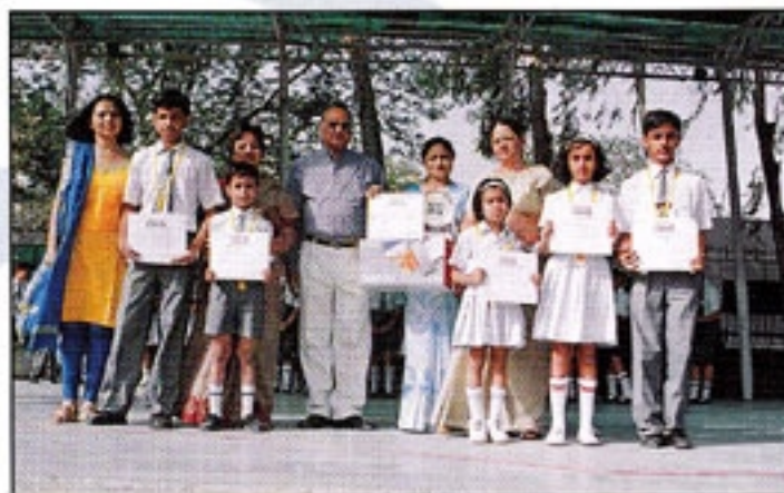
Students who bagged medals in procom.