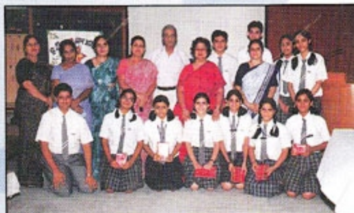
Winners of Hindi Recitation Competition IX-X