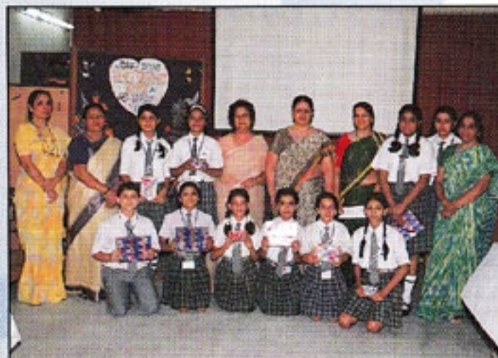
Winners of Sanskrit Recitation Competition VI - VIII