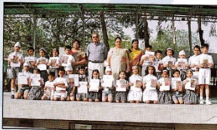
Winners of SPELL-WELL Competition I-V