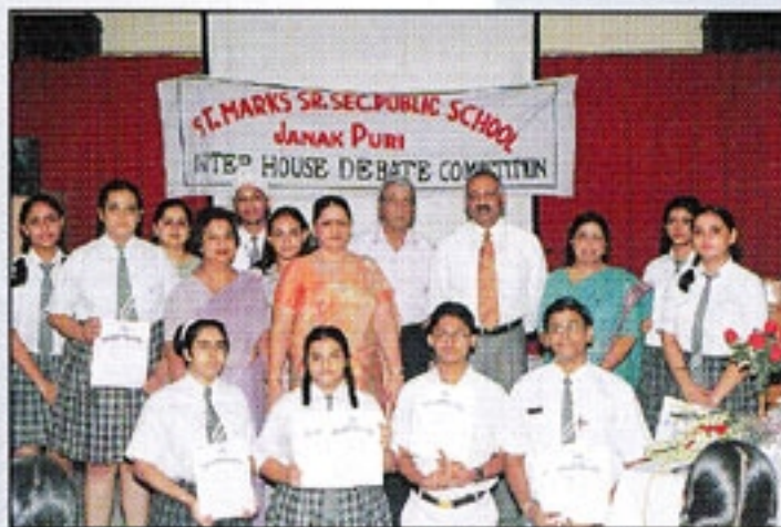
Winners of Inter House Debate Competition