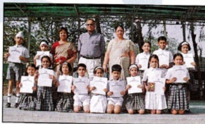
Winners of Read Aloud Competition