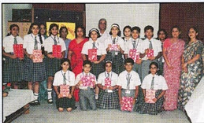
Winners of Hindi Recitation Competition VI-VIII