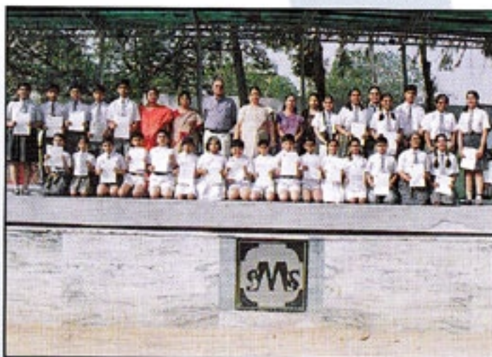
Winners of MacMillan Competition