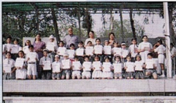
Winners of Handwriting Competition