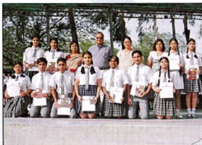
The budding writers : Winners of Essay Writing Competition