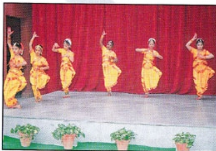
Orientation Programme : Students welcoming the parents