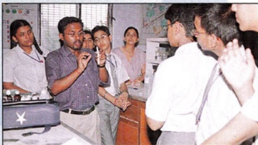
Eco-Club Members testing water samples in the Chemistry Lab.

The members also collected water samples from nearby areas like Vikaspuri, Hari Nagar and Rajouri Garden for water testing. People were made aware about the quality of drinking water of their area. The members of Vasudha feel their responsibility towards society and the mother earth that nurtures us and are sure to do well in days to come.