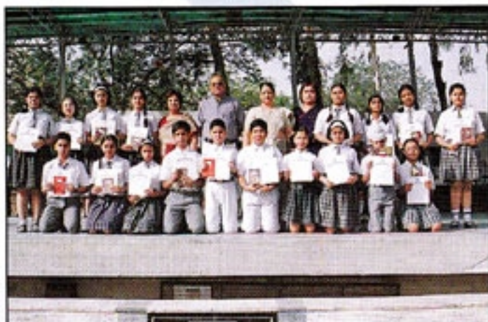
Winners of SPELL-WELL Competition VI - X

In the session 2005-06 Inter Section Hindi Recitation Competition was held in our School premises on July 18 th 2005, for classes VI to X at two levels - Middle & Senior. Following are the prize winners.