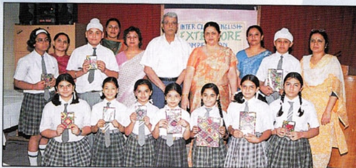
Winners of English Extempore competition